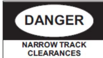
Figure OTTR 420-1