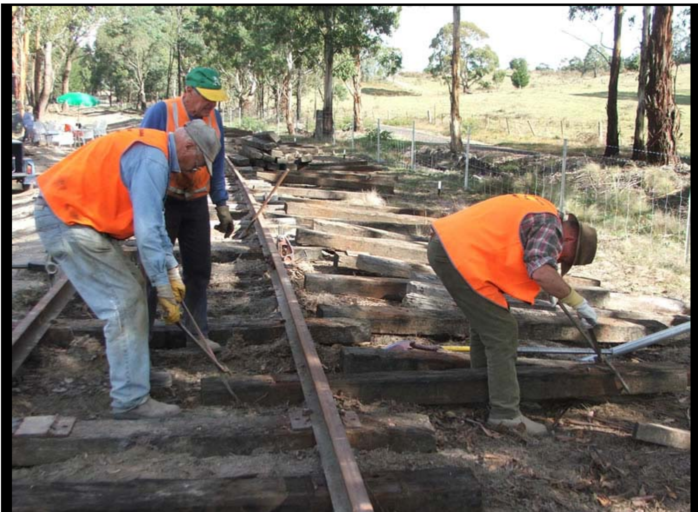
Head down & bum up was the procedure when dragging sleepers into place - we joked about being part of "Team Geriatric"