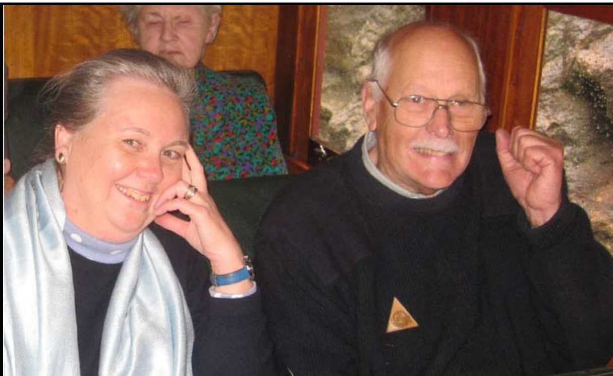
... you can clearly see how enthusiastic Ross was!