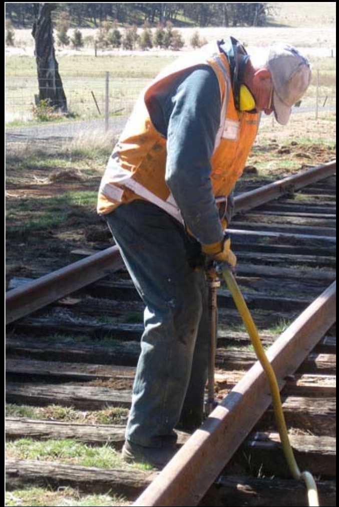
...and here on a pneumatic drill.