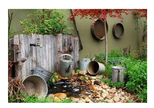
One of the beautiful garden rooms at Gairloch Garden

You can add the Gairloch Garden to your Oberon Tarana Heritage Railway Inc. experience subject to seasons.