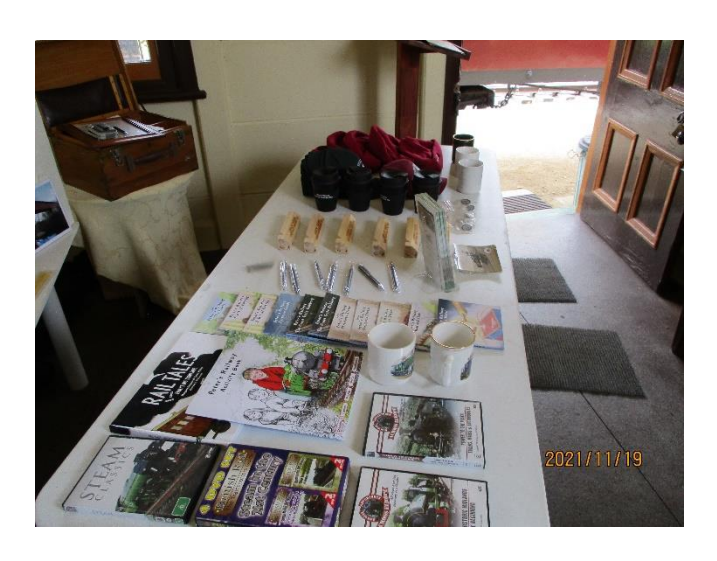
Some of OTHR's merchandise. This is a fundraiser for OTHR and at the same time gives you a memento of a great project. Got yours yet? An order form is at the end of this newsletter.

Yet another good reason to come along and see what the railway folk are doing at the station.