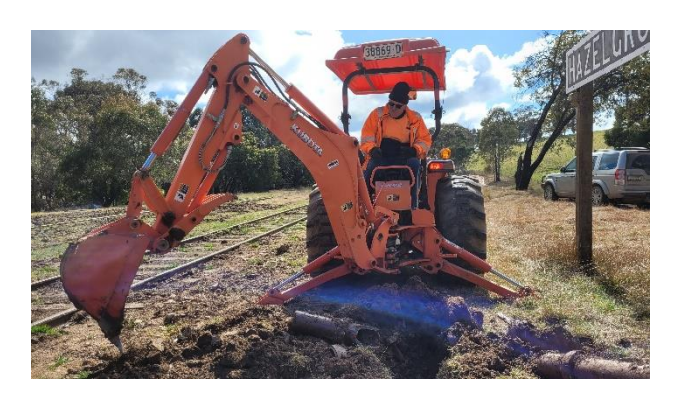
Hazelgrove - The original ceramic pipes were blocked and had to be removed in order to get storm water away from the track

Refer to OTHR website to download an application or see the application form at the end of this Newsletter.