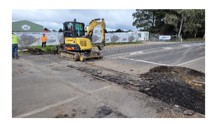
Another photo of the Albion Street Crossing. Since the photo was taken the crossing has been completed