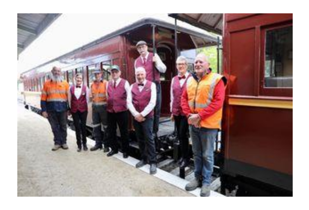
Volunteers are needed to fill all sorts of roles at OTHR.

Call him now on 0437 389 684 or email admin@other.com.au