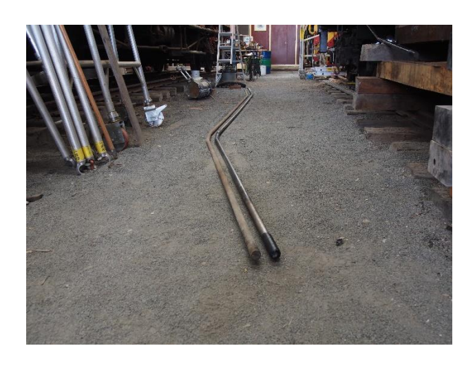
New truss rod alongside the old. The old one had thread damage and the engineering report indicated the diameter had narrowed too much