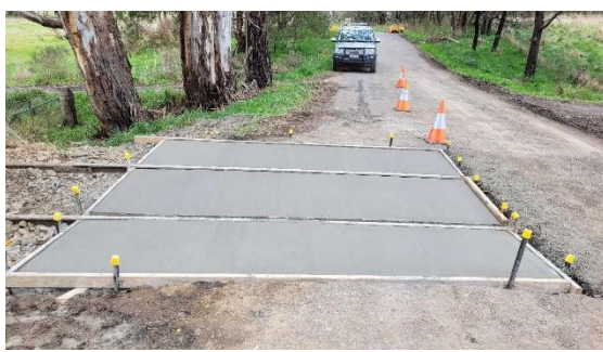
The Tip Road is another level crossing taking shape. This road needed to be kept open, so the crossing was poured in two parts.

"The work on the railway line to Hazelgrove has progressed well with trackwork mostly complete and only the road crossing at Albion Street, the Borg Gate, Rutters Ridge and the Tip Road to be completed over the next 10 days or so. Soon, the major milestone for the Heritage Railway to get up and running between Oberon and Hazelgrove will be in place. I believe the aim is for tourist trips on the line to commence in late 2023. Mayor Mark Kellam"