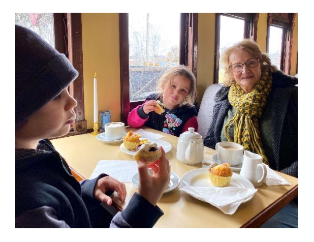
Devonshire Teas for all the family. Temporarily discontinued until the New Year

First Saturday Open Days have been cancelled for November and December. We expect that they will return in the New Year