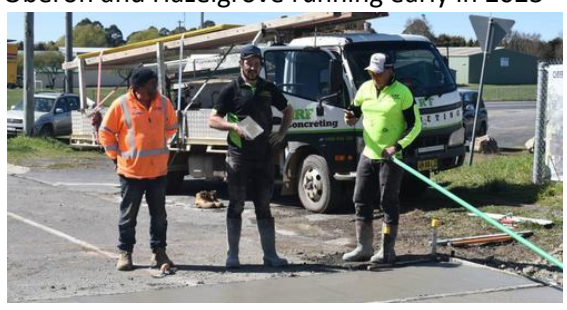
Starting the rebuild of the Albion Street, Crossing. CAM workers on site

OTHR hopes to have the railway between Oberon and Hazelgrove running early in 2023"