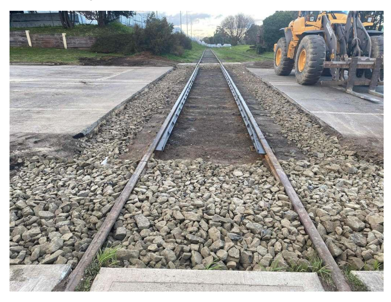
Some of the preparatory on Albion Street Level Crossing

Greg Bourne. Email admin@othr.com.au or mobile 0437 389 684