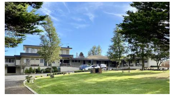
Meet our newest Sponsor.

Owned and operated by the Voytilla family, Titania Motel is located just minutes from the heart of Oberon, NSW in a quiet neighbourhood where a peaceful stay is assured.