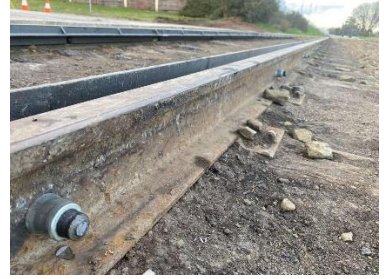
A good shot of a Huck Bolt Huck bolts are a pin & collar combo that are permanently clamped together making them ideal in applications that require a vibration resistant solution. Very good to hold a check rail in position

The works are being carried out by Complete Asset Management and assistance from volunteers from the Oberon Tarana Heritage Railway."