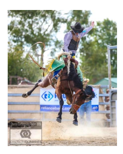
Action at the Oberon Rodeo

Come and check us out, say "G'Day" to the locals and we'll certainly extend the hand of friendship. For a small country town there's something to suit every taste in entertainment.