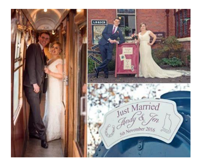
You could be the wedding couple with Oberon Station Precinct as a backdrop.

Enquiries can be made at: <a href="mailto:admin@othr.com.au">admin@othr.com.au</a> Hiring fees are incredibly competitive.