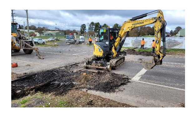
Major level crossings are currently being rebuilt. Picture shows commencement of restoration of the Albion Street crossing

"One of the best protections against disappointment to have a lot going on. Alain de Botton"