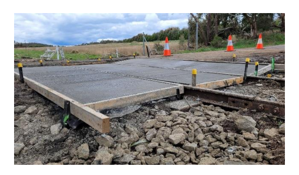
Newly laid concrete at the Tip Road crossing.