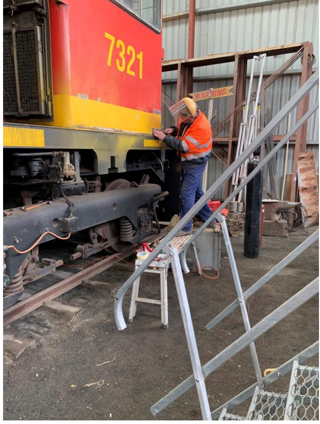
Rust repair on 7321