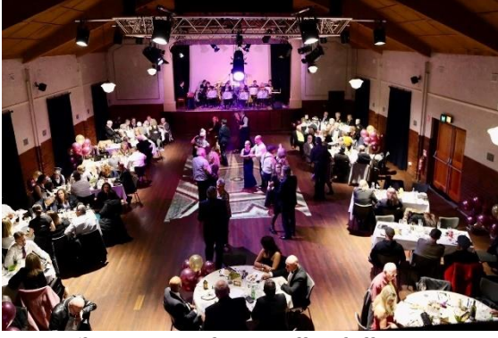
The Great Railway Ball in full swing.