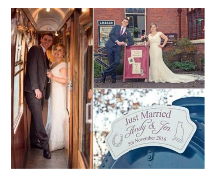
You could be the wedding couple with Oberon Station Precinct as a backdrop.

Enquiries can be made at: <a href="mailto:admin@othr.com.au">admin@othr.com.au</a> Hiring fees are incredibly competitive.