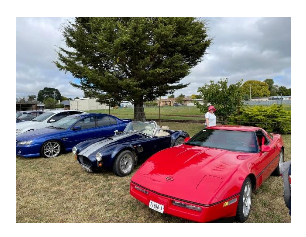
Some fine beauties at one of the OTHR Cars and Coffee events.

Lookin' for adventure. At the Oberon Cars and Coffee.