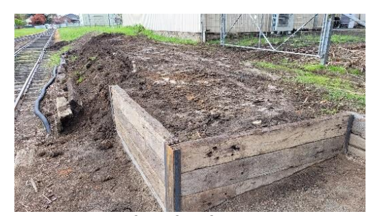
New entry path to the Oberon Station coming together thanks to our volunteers

Refer to OTHR website to download an application or see the application form at the end of this Newsletter.