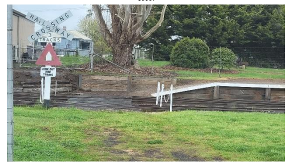
Another aspect to the beginnings of the new path indicating its location compared to the old entrance.