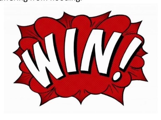
100 Club Form see page 27

This emergency and necessary work has improved the condition of the track which was suffering from flooding.