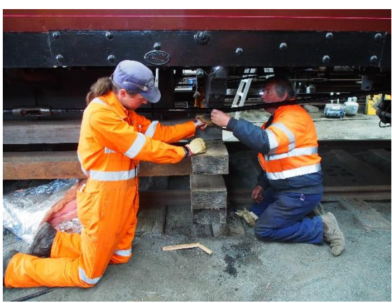
Truss rod installation CBA850