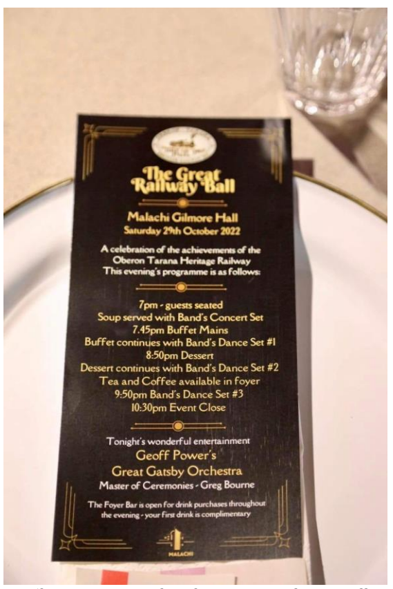
The programme for the Great Railway Ball. Nothing left to chance.