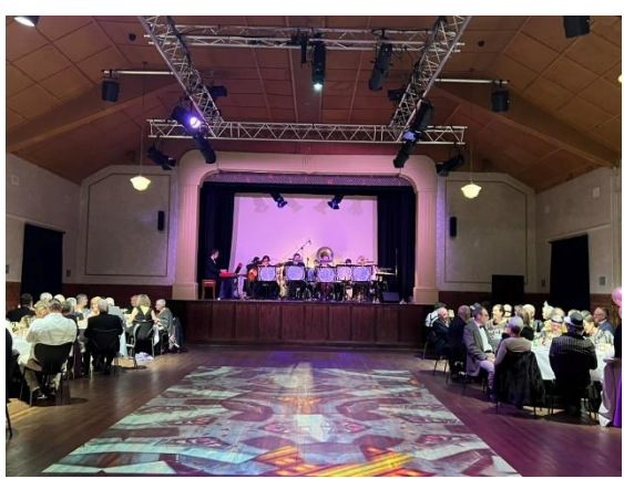
How lucky is Oberon to have the heritage listed Malachai Gilmore Hall being used as envisaged in the 1930's