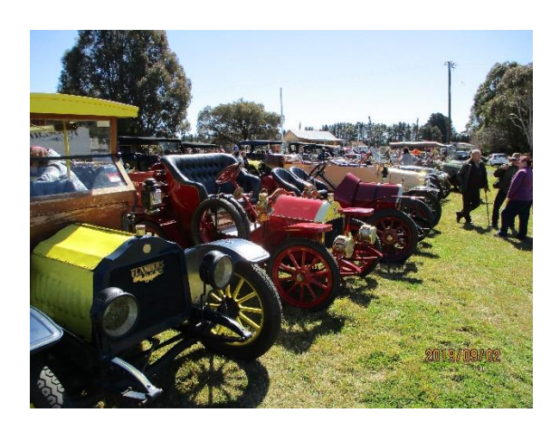
One of the many events hosted by OTHR at the Railway Precinct. This was an International Raily, and all vehicles were pre-1920.

Groups are starting to line up and results so far have been encouraging. If you are a member of another group, say a car club or Rotary or Probus or a gardening club, etc. and that group is looking for an excursion, please suggest they book a group visit to Oberon Station.