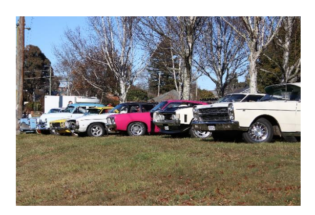
Groups large and small, OTHR can host them all.