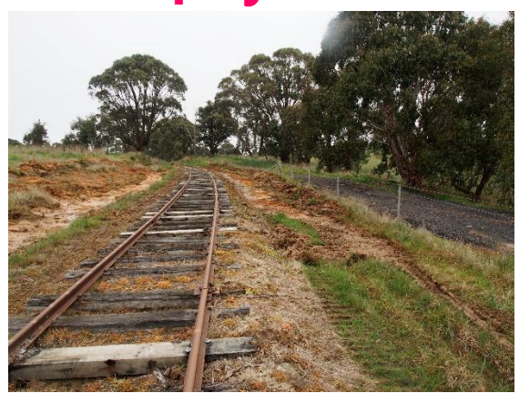
A view of the line showing drainage works to the left of picture. At this point there was quite a lot of flooding of the line.

La Nina has not spared OTHR. The track between the Tip Road and Hazelgrove has suffered flooding to various degrees.