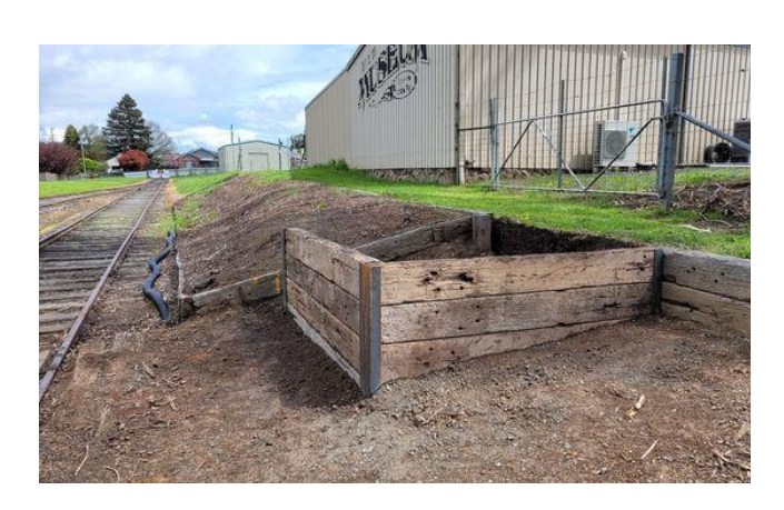
The upper level of Oberon platform's new entrance path is taking shape.

As has been mentioned elsewhere in this Newsletter, dreams that you dare to dream really can come true.