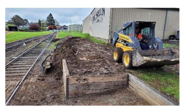
Pathway leads away from the Station towards the point where it will cross the line approximately 20 metres from the existing entrance.