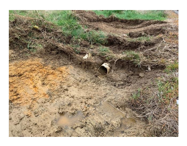
Work on the cess uncovered buried pipes which when cleared made a big difference