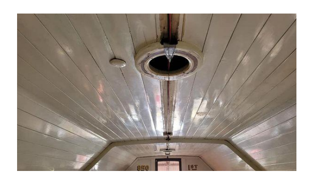
Interior of CBA850 showing rewiring in progress and installation of LED lighting to take place. Old wiring proved to be inadequate and dangerous.