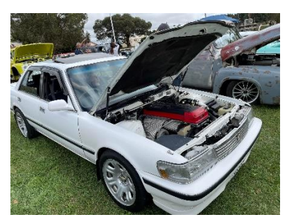
Don't forget Oberon Cars and Coffee, Saturday 19<sup>th</sup> November 2022 from 8.30am

We also expect and encourage all our contractors and their employees to act in a way that is consistent with Our Code. We will take appropriate measures where we believe they have not met our expectations or their contractual obligations.