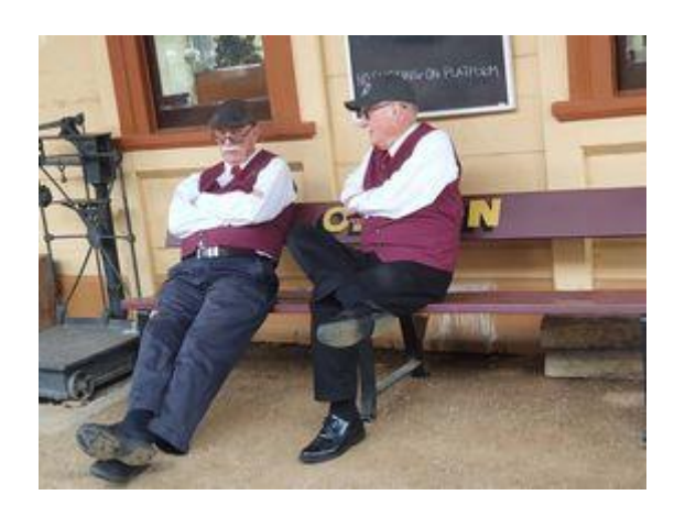
A couple of very energetic volunteers at an Open Day.

If you think the incentives may tip you over the line by making volunteering with OTHR less expensive, then talk to President Greg Bourne on Mob. 0437 389 684 to find out how we can make your Oberon volunteering a little more affordable.