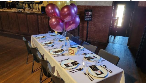
The very elegant tables dressed for the occasion of the Great Railway Ball.