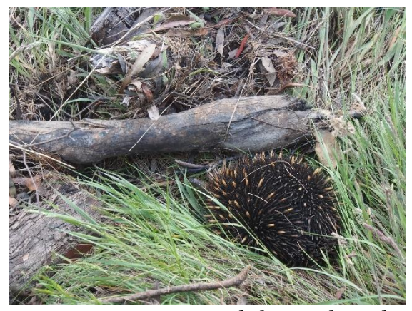
A Spiney Ant Eater or Echidna nearby to the track looking for some tasty morsels.

Below are a couple of photos of native animals we found on a recent trek down the track.