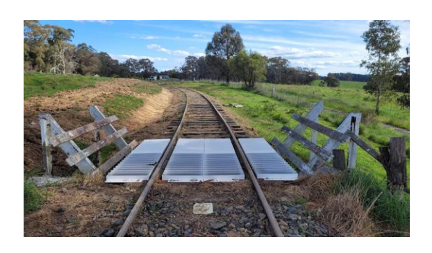
An example of a cattle grid that has been installed on the track.

Contractor, CAM, has been busy with the latest stage of their work, installing cattle grids improving the cess and formation of track. The work on replacing the missing track just will be finished before Christmas