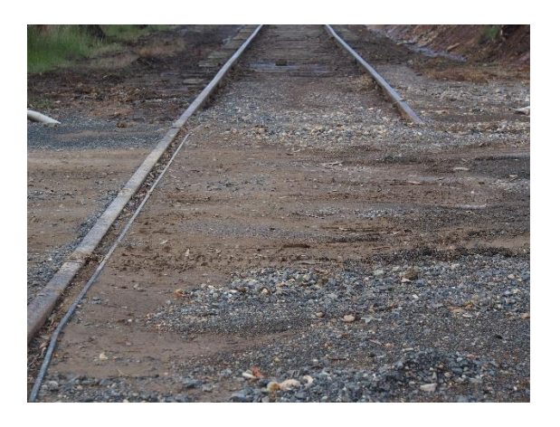
Some minor cleaning up required at the Hazelgrove level crossing. The rubble washed from Black Bullock Road,

We wish to acknowledge the suffering of residents a little further west in towns such as Forbes and Eugowra and the "blue sky" flooding of towns further along the river systems that is happening now.