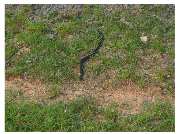
A friendly black snake joined us for a curious look at the new track.