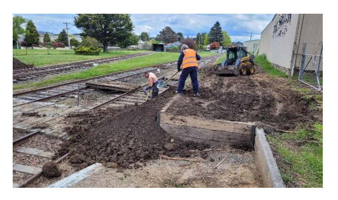
Another project at the southern end of Oberon Station. Forming up the new entrance path.