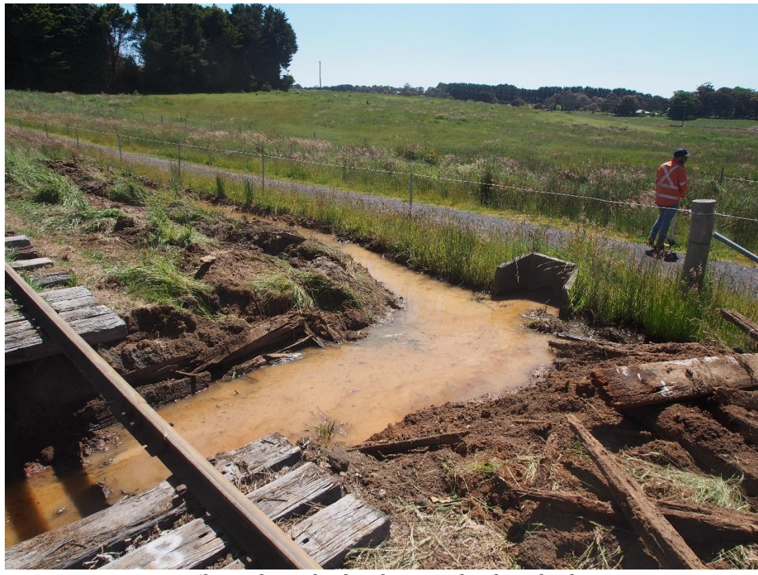
This culvert had to be completely rebuilt!

Culverts have been checked and up graded or rebuilt where necessary. In this photo CAM had to clear the blocked pipe under the rail trail and then the "cess" on the western side of the rail trail and the clearing of spoon drain in the adjacent farmer's paddock. Well done CAM!