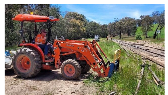
Moving the ruins of the old track were a snack according to President Greg at the reins of the