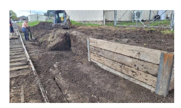
OTHR are simply great at earthworks!