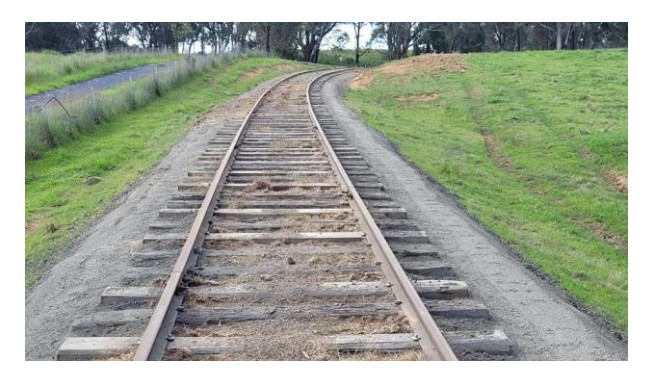
A beautiful sight. Enough to bring a tear to a glass eye!