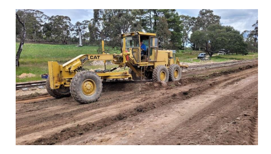
The vision and the reality.

OTHR breaks ground for the turn-around loop to be constructed at the Hazelgrove end of the line (Stage 1)