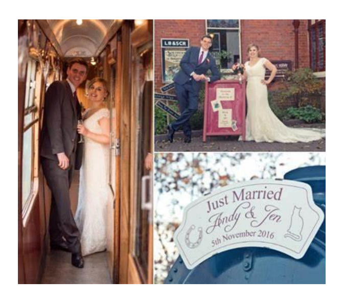
You could be the wedding couple with Oberon Station Precinct as a backdrop.

Enquiries can be made at: <a href="mailto:admin@othr.com.au">admin@othr.com.au</a> Hiring fees are incredibly competitive.