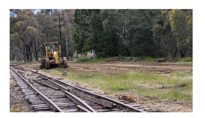
Grading commences at Hazelgrove Site.