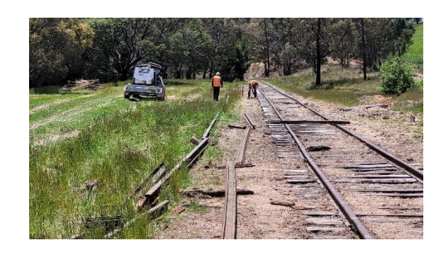
OTHR Volunteers removing the remains of old track