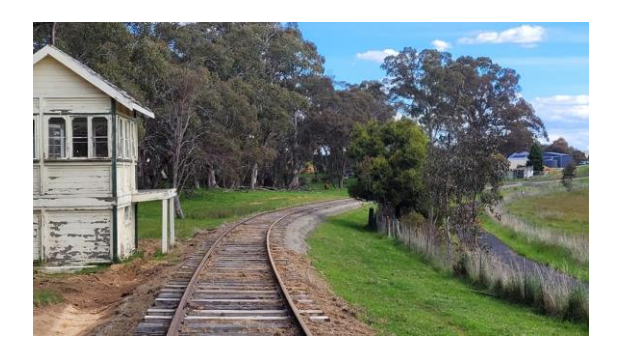
A sweeping curve past the old film setting.

The Oberon Railway Cars and Coffee event has been postponed to January or when the weather clears.