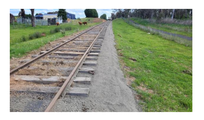
Section of the newly refurbished track looking back towards Oberon, NSW