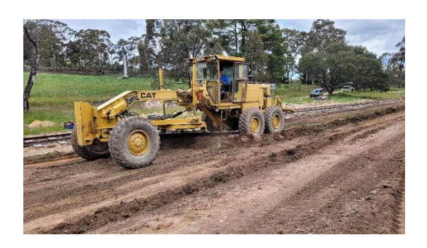
The big guns make the earthworks easy

The first jobs were unbolting fishplates from the old loop and moving rail sections into the main 4 foot. This allowed easier grader access for preparing the new loop formation. There is nothing like having heavy machinery doing all the arduous work.