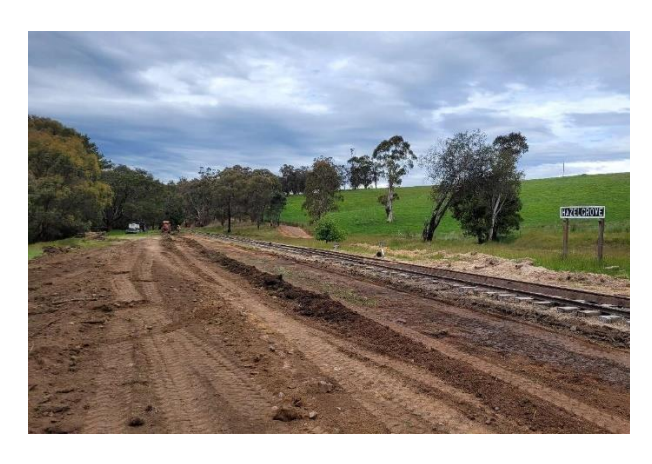
Site works at Hazelgrove, NSW