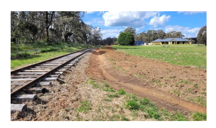
Another section of the spectacular railway line towards Hazelgrove. NSW

Application form is at the end of this newsletter