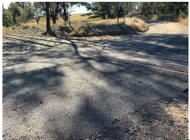
Finished level crossing at Black Bullock Road. The crossing is now wider because the upgrade included some essential work to direct water flow away from the edge of the road.

OTHR Membership Fee 2022/2023 now due. Renewal form page 23 of this Newsletter