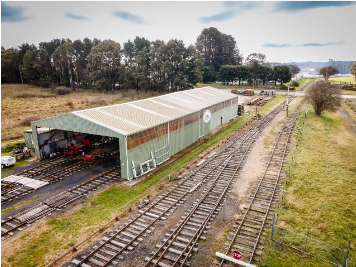
Rolling Stock Shed and main line heading North towards Hazelgrove