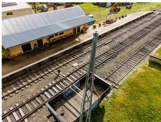
Oberon Station August 2022