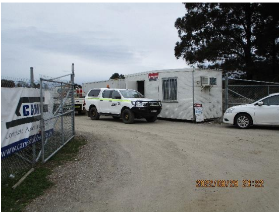
CAM Site Office, Oberon Station Precinct

We can assure all readers that once the line is completed any damage will be repaired by the contractors.