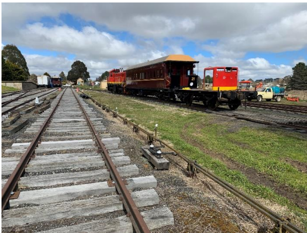
A shunting movement from the Rolling Stock Shed so the front end panel of 7321 could be loaded onto trailer

Start a conversation with someone you care about.