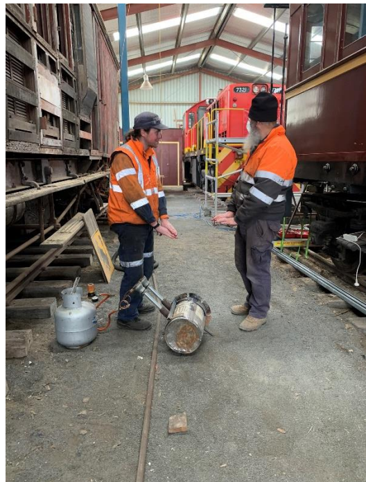
On a cold day in the Rolling Stock Shed!

OTHR Membership Fee 2022/2023 now due. Renewal form page 23 of this Newsletter