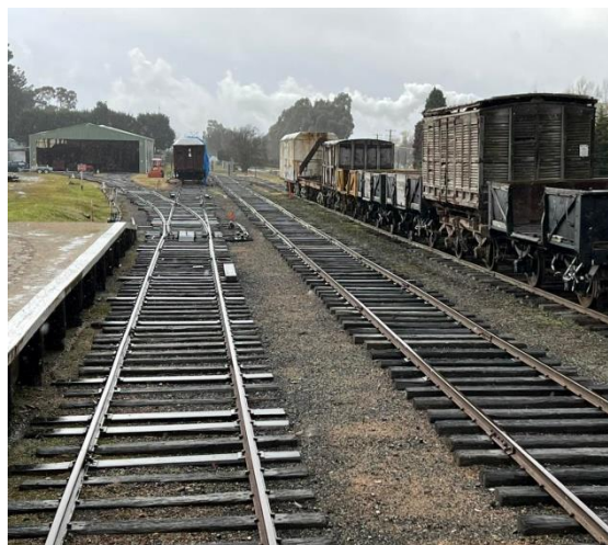
Looking down the line

We also expect and encourage all our contractors and their employees to act in a way that is consistent with Our Code. We will take appropriate measures where we believe they have not met our expectations or their contractual obligations.