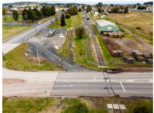
Level crossing at Albion Street just North of the Oberon Station Precinct

Application form is at the end of this newsletter