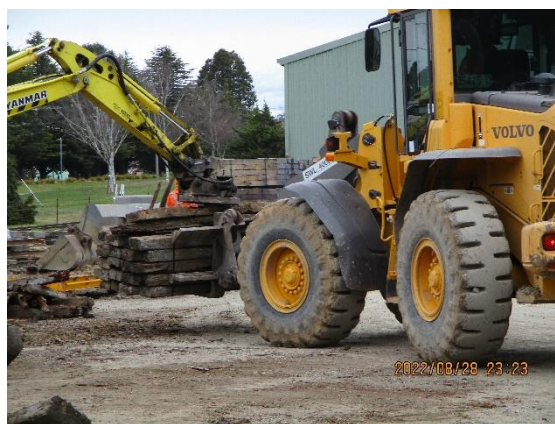
Contractors working in the security yard, Oberon Station Precinct.