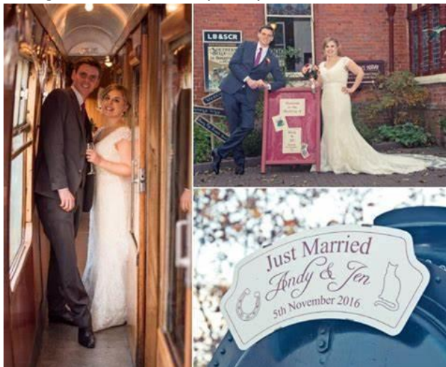
You could be the wedding couple with Oberon Station Precinct as a backdrop.