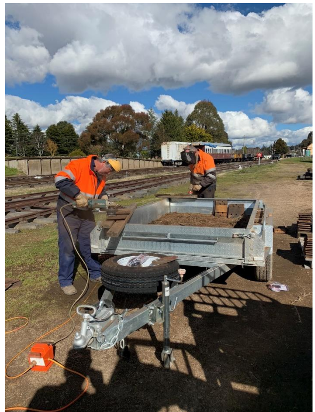
Working bee plate cleaning

Oberon RSL, Dudley Street, Oberon 7.30 pm