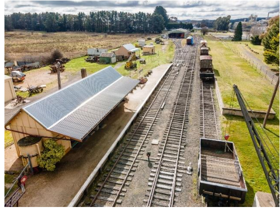
A general view of the Oberon Station Precinct

"Everything we do is freaking iffy. That's what makes it so much fun. John Sandford"