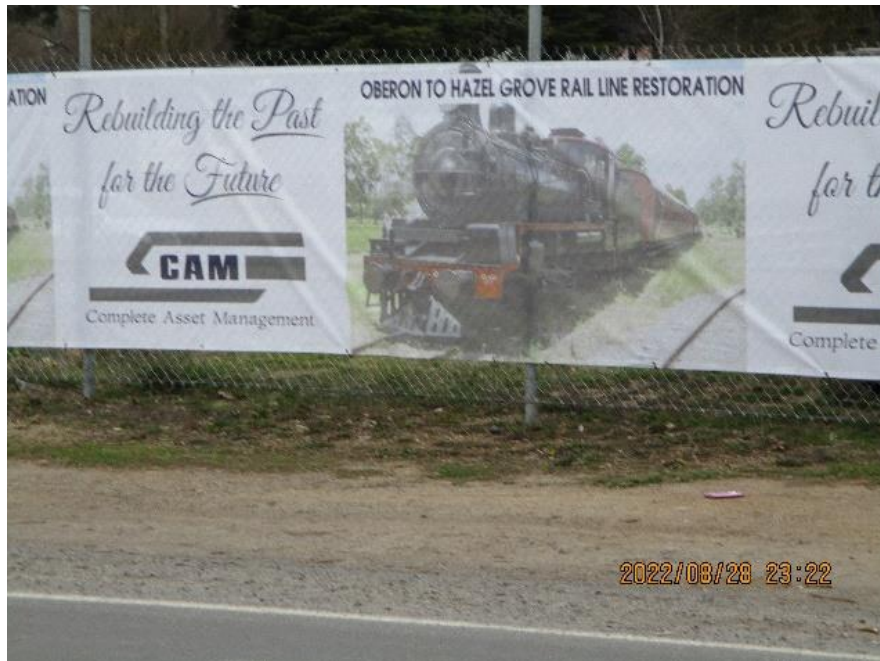
Prominent advertising by contractors CAM

OTHR Membership Fee 2022/2023 now due. Renewal form page 23 of this Newsletter