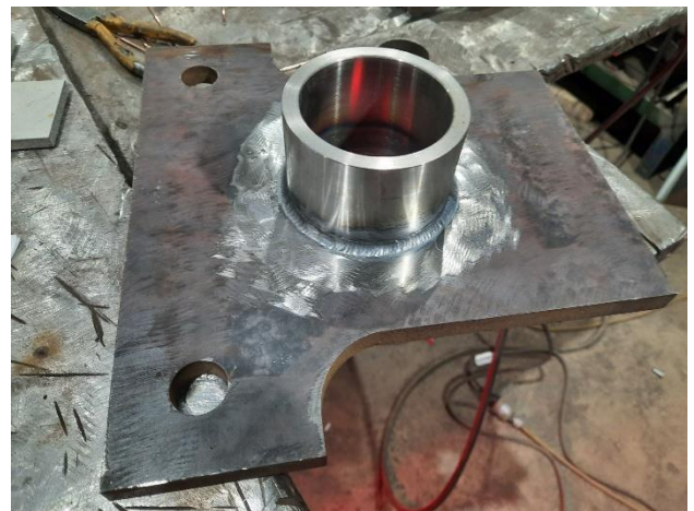
Quality work by local trades for the restoration of CBA850

OTHR Membership Fee 2022/2023 now due. Renewal form page 23 of this Newsletter