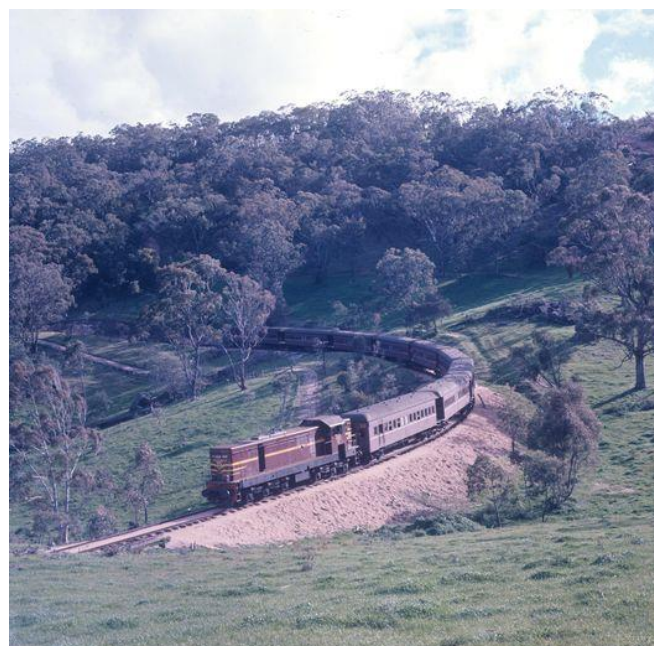
"The Rail Way Facebook page.

New South Wales Government Railways No 4912 (Clyde Engineering, Granville, No 262 of 1962) leads end platform set 62 on a New South Wales Transport Museum tour train near Carlwood on the Tarana to Oberon Line, 12 th October 1975.