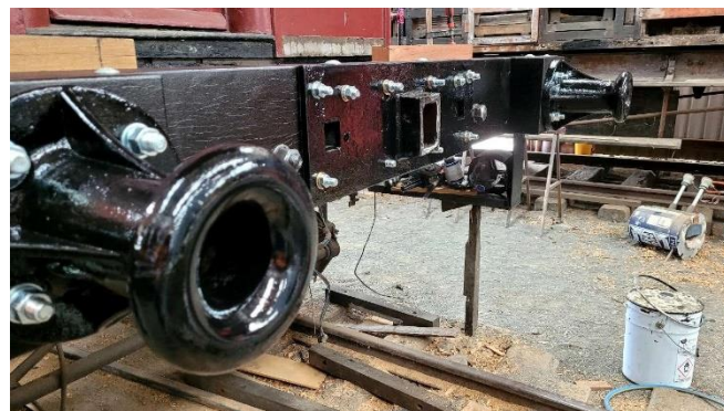
Buffer collars and centre plate fitted. To guard's end HLF854.