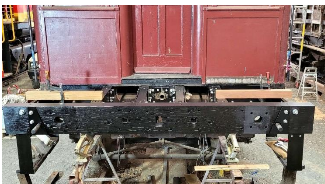
Headstock commencing fitment to HLF854.