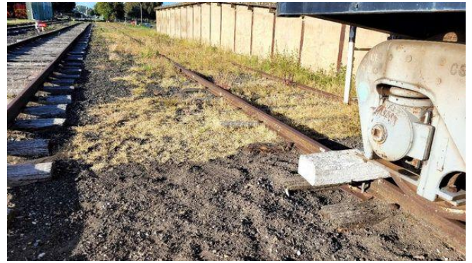
Weeding in progress.