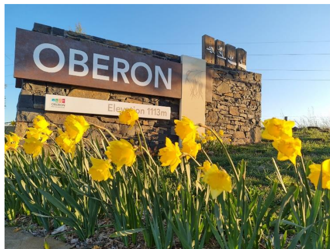
Springtime in Oberon.

Oberon has so much to offer Australia with talented residents, beautiful landscapes and much more. We are not merely a small town on the byway of a road map.