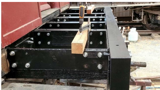
Side view of guard's end headstock work completed.