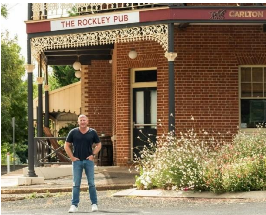
The Rockley Pub.