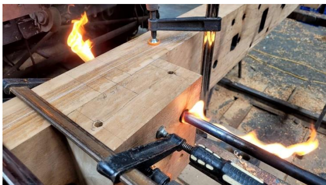
Burning through bolt holes to seal timber.