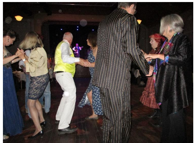
Revellers at the Great Railway Ball 2023.