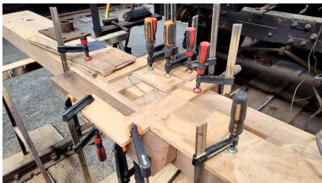
Laying out guides for mortise cutting on the rear of the headstock.