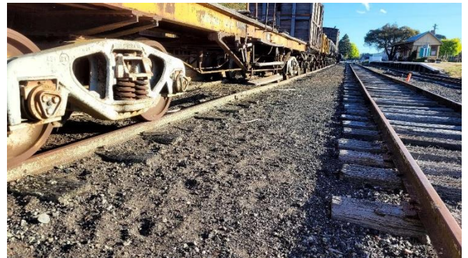
Another example of Barry's dedication to weeding.