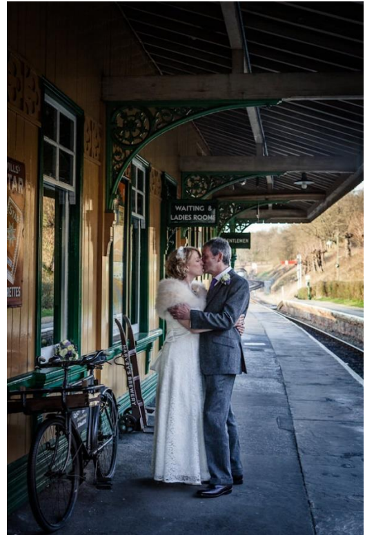
You can hire Oberon Station for your Vintage Wedding Photo.