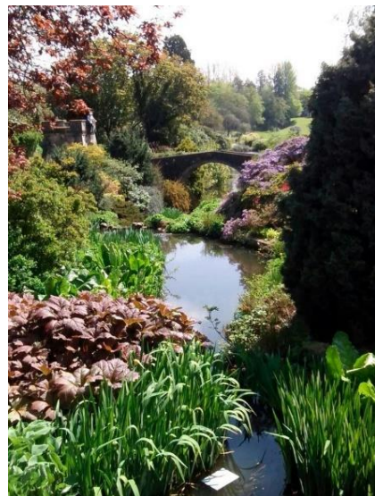
The extraordinary Mayfield Garden

We haven't settled the cost of this event yet. Mayfield Garden will be handling all ticketing and catering on our behalf for this event. Further advice to come.