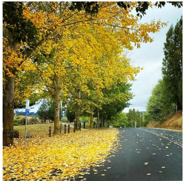
Autumn around The Common.

Autumnal colours are everywhere, and Oberon shows them off to the absolute best advantage.