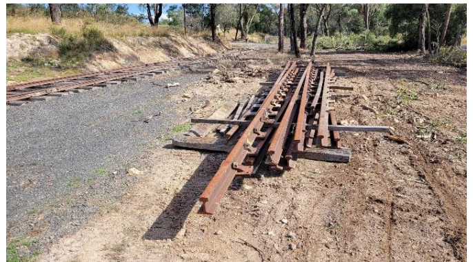
Rail for the southern turnout.