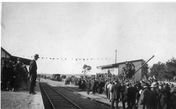
Opening Day 3 rd October 1923

All readers are invited to participate in the opening ceremony. Bring your classic vehicle and dress in period costume and enjoy the fun.