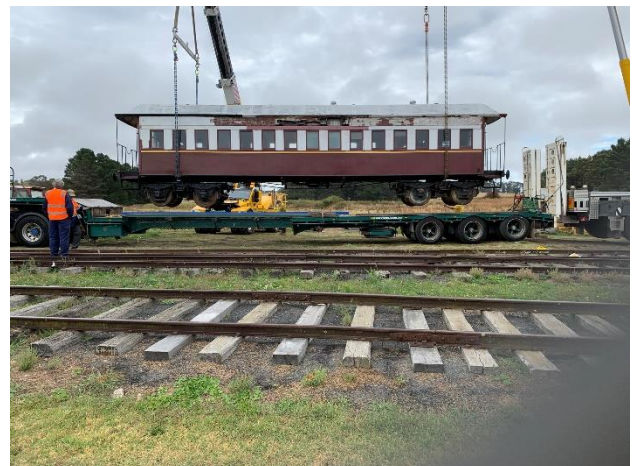
Privately owned carriage almost loaded and ready for the trip to Canowindra.

Network with other rail heritage groups and museums at Valley Heights, Lithgow, Zig Zag, Bathurst, and Cowra to form a Heritage Railway partnership to prioritise and promote the area as a Railway Tourist Precinct