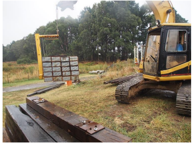
Sleepers being loaded in the Oberon Yard destination Hazelgrove

of the turnaround loop. Restoration of the loop starts the week after Easter.