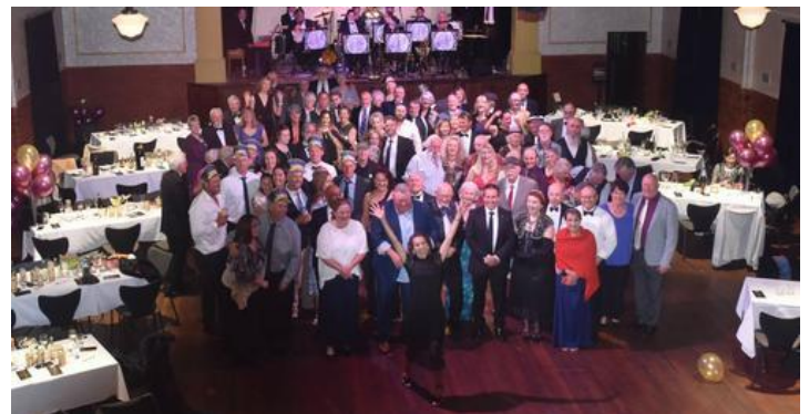
Guests at the 2022 Great Railway Ball.

Our plan is to take it up a notch or two for this year's guests. Be quick to organise tickets as space is limited to approximately 120 guests and tickets will be gone in a flash. Full details and pricing will be released shortly.