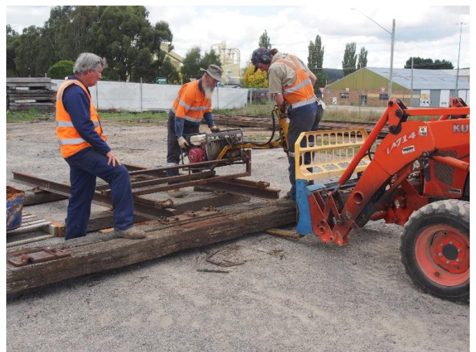
Saturday April 1 st Working Bee De-plating timbers in the Oberon Yard