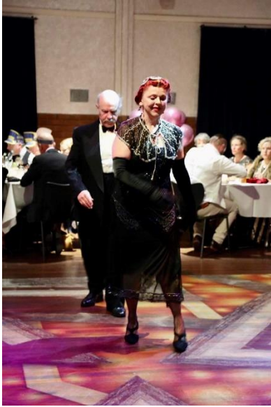
Living it up at the 2022 Great Railway Ball.