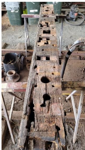
One thoroughly used headstock. Most likely the 126-year-old unit.