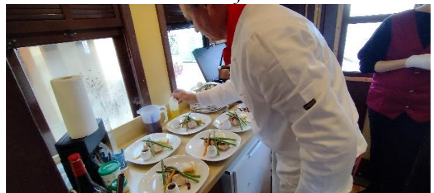
Another event available to all groups. Our chef preparing one of the courses served at the OTHR Winter Lunch in 2022. Enquiries for Seasonal Lunches are welcome. Contact us at www.admin@othr.com.au