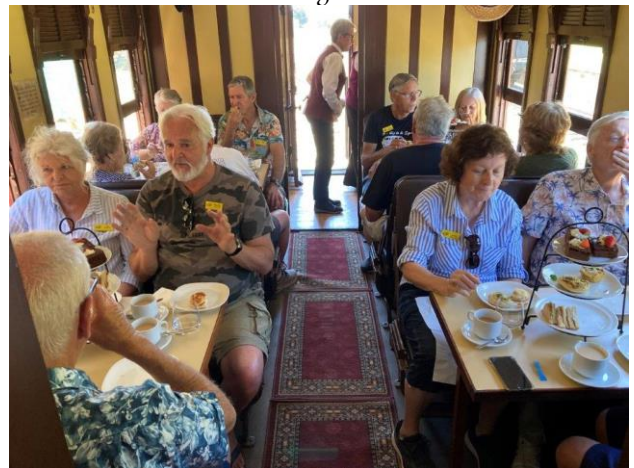
Events Directors of all Associations - join OTHR in the OTHR Carriage Café for a Devonshire Tea, High Tea or a Fettle's Lunch, or any other function, the choice is yours