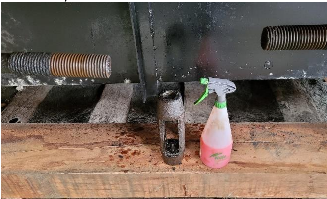
Removed turnbuckle and our special formula penetrating oil.