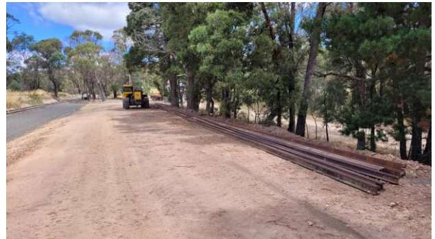
Rail for turn out at Hazelgrove, NSW.