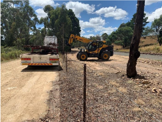
Unloading rail across the fence at Hazelgrove

March 2023, the main focus of the volunteers has been simply moving things around The privately-owned end platform car has been moved from the Oberon yard to a property at Canowindra Sleepers, timbers, turnouts and rail from the EDI site in Bathurst and the yard in Oberon to Hazelgrove station site.