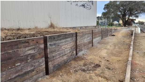
Photo shows completed walls on the new entrance ramp. The ramp is heading north onto the station platform.

A new concrete pathway across the lines will also be built. A new entrance will be constructed about 20 metres to the south of the existing entrance.