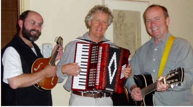
The Nodding Thistles' sound is based on songs and dance tunes played on accordion, mandolin and guitar with friends bringing instruments to suit the occasion.