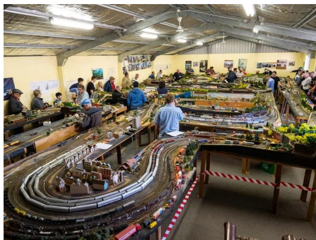
Typical model train layout like what will be on exhibition at Oberon, NSW

Open Day this Saturday June 3 rd 10.00 – 3.00 at the Oberon Station Quarterly Meeting Wednesday July 12 th – Oberon RSL 7.30 pm