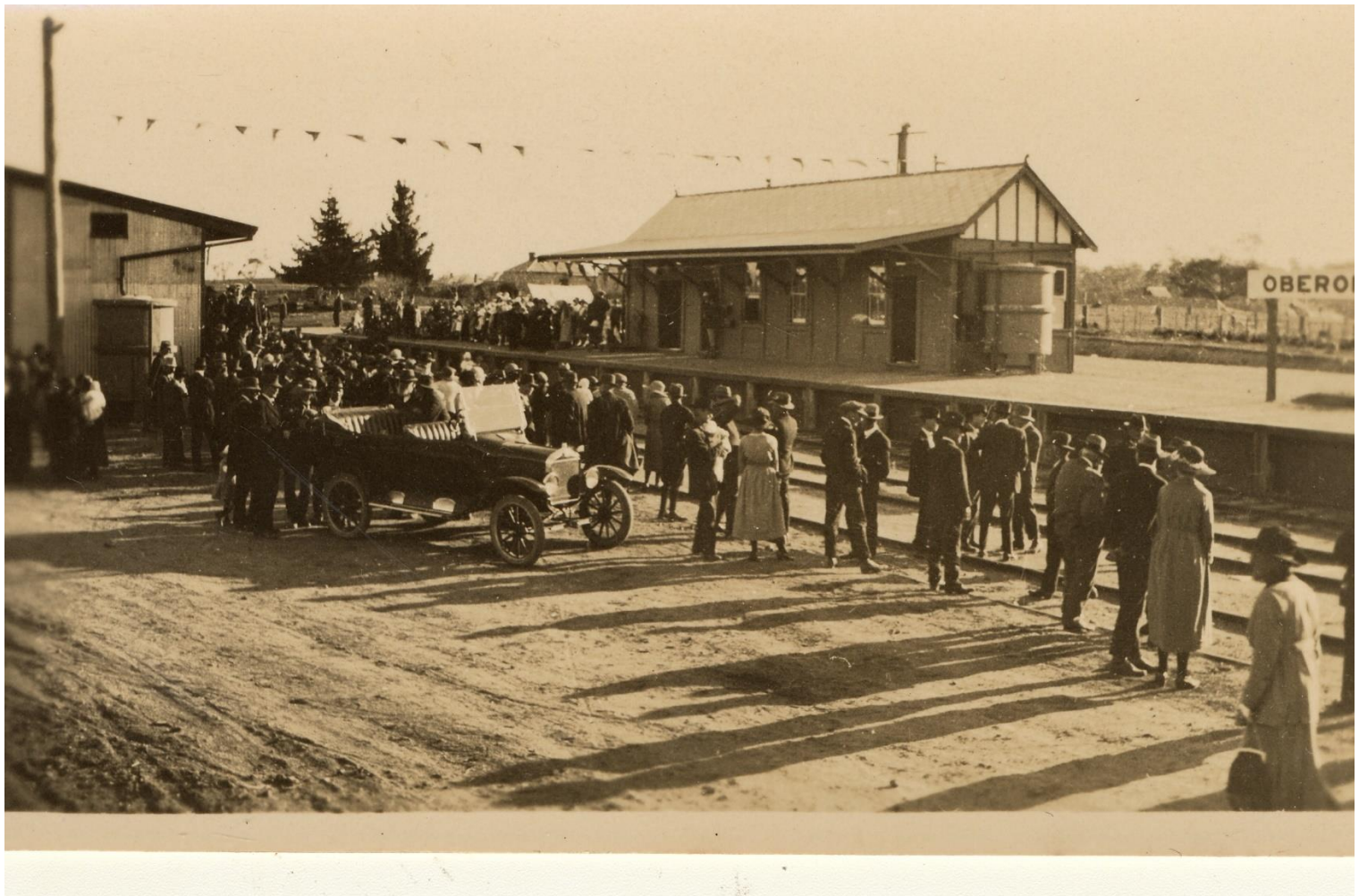
Crowd on eastern side of station October 3 rd 1923

Opening Day Tarana to Oberon branch line 3 rd October 1923