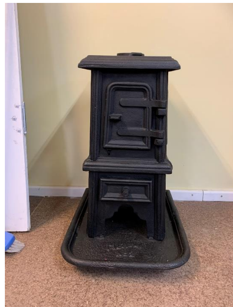
No 2 Metters dumpy Stove for HS36

Open Day this Saturday June 3 rd 10.00 – 3.00 at the Oberon Station Quarterly Meeting Wednesday July 12 th – Oberon RSL 7.30 pm