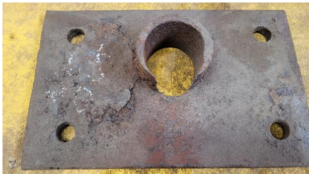
A rusted and worn part that supports the buffers on the Café Carriage.