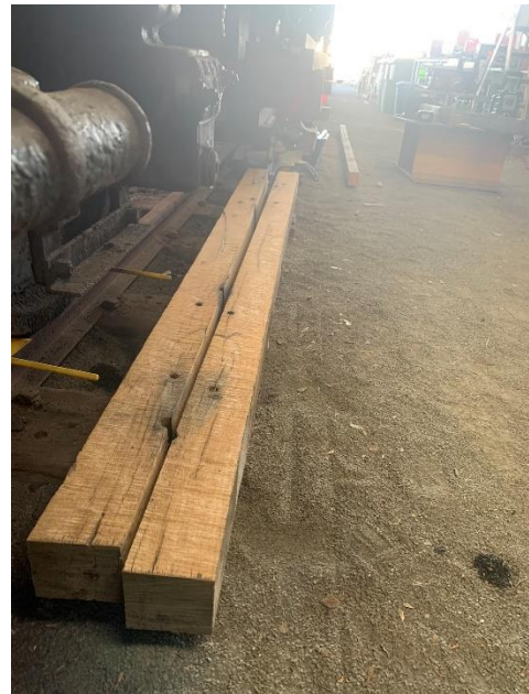
Tallowood milled from Sydney Harbour Bridge Transom Timbers being used in HS36

Open Day this Saturday June 3 rd 10.00 – 3.00 at the Oberon Station Quarterly Meeting Wednesday July 12 th – Oberon RSL 7.30 pm