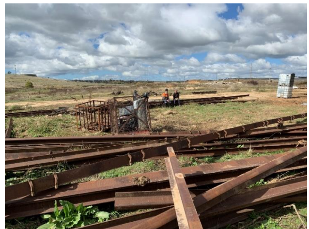
Volunteers at Kelso in Bathurst finished the job of finding the special plates needed for the southern turnout at Hazelgrove

Open Day this Saturday June 3 rd 10.00 – 3.00 at the Oberon Station Quarterly Meeting Wednesday July 12 th – Oberon RSL 7.30 pm