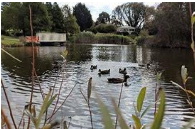
An aspect of The Common, Oberon's beautiful park and the probable setting for OTHR's celebratory "Picnic in the Park"