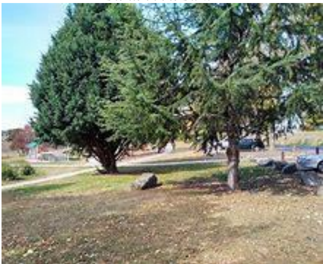
The beautiful Common situated in the heart of Oberon.