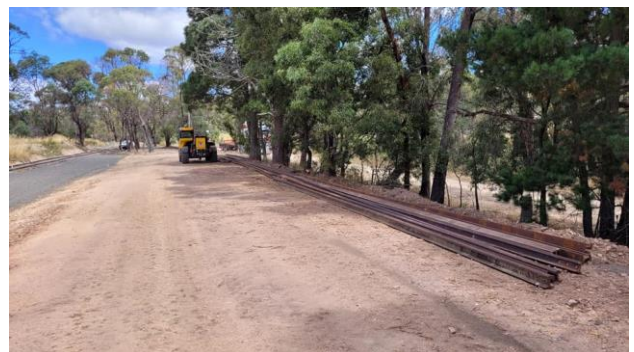
Rail for turn out at Hazelgrove, NSW.