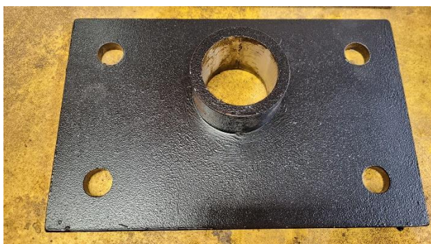
Same part built new and ready for installation.