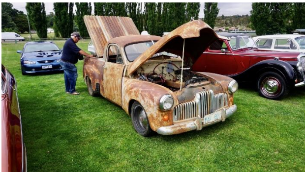
Picnic Day in a park, an event for car enthusiasts and cars of all descriptions.

There has been a change of venue and details haven't yet been finalized. Further advice to come.