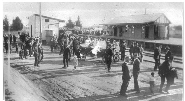
Opening Day Ceremony Tarana to Oberon branch line 3 rd October 1923

Fast forward to 2006 when an enthusiastic group of locals had a vision to restore the line as a tourist attraction. In 2023, 100 years after the opening later, it looks as though at least part of the track will be hosting passenger services again. This is what OTHR refer to as Stage 1, Oberon to Hazelgrove.