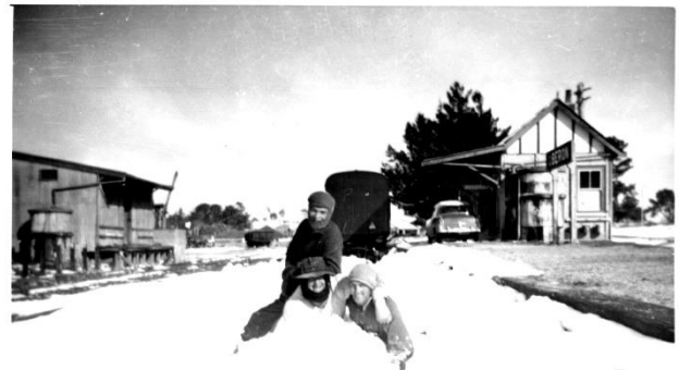
We used to get more snow in the 50's

Open Day this Saturday June 3 rd 10.00 – 3.00 at the Oberon Station Quarterly Meeting Wednesday July 12 th – Oberon RSL 7.30 pm