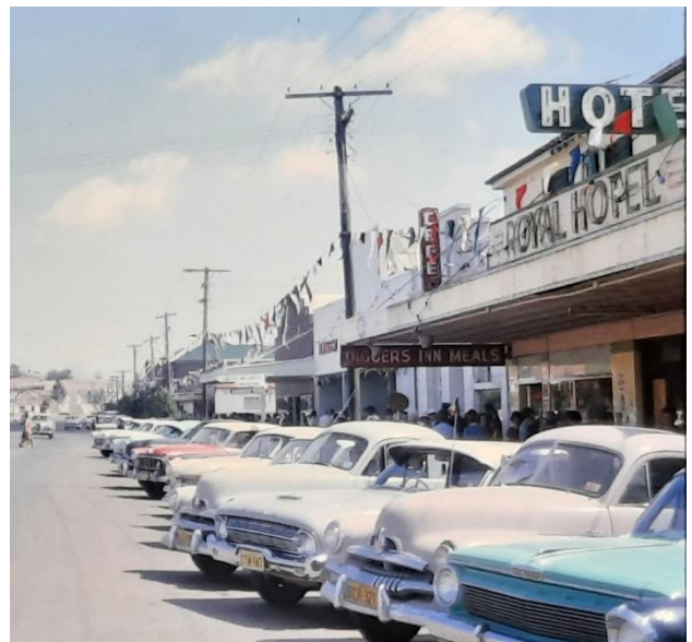
Oberon Street, Oberon. Street scene in the mid 1960's