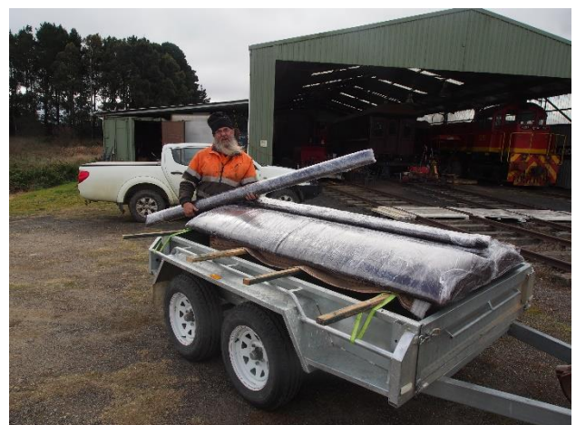
Neatly packaged HS36 seats on arrival in the yard

Open Day this Saturday June 3 rd 10.00 – 3.00 at the Oberon Station Quarterly Meeting Wednesday July 12 th – Oberon RSL 7.30 pm