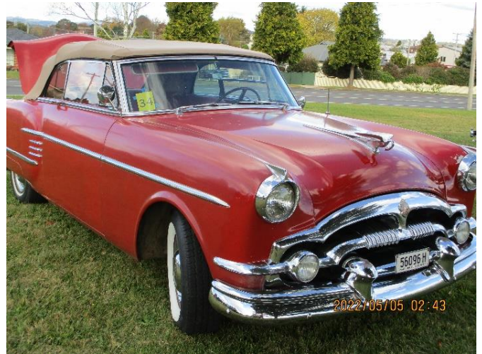
Put you and your classic in the picture at The Common