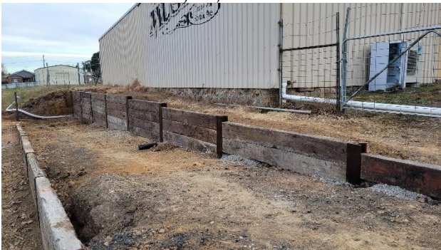
Another photo looking south. The concrete path will be laid in the next week or so.