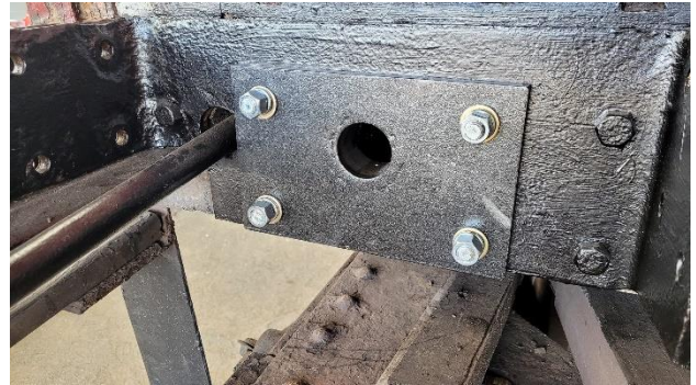
Restoration work on south end of the Café Carriage.

A team from the Lithgow Railway Workshops have been rebuilding some key parts of the carriage.