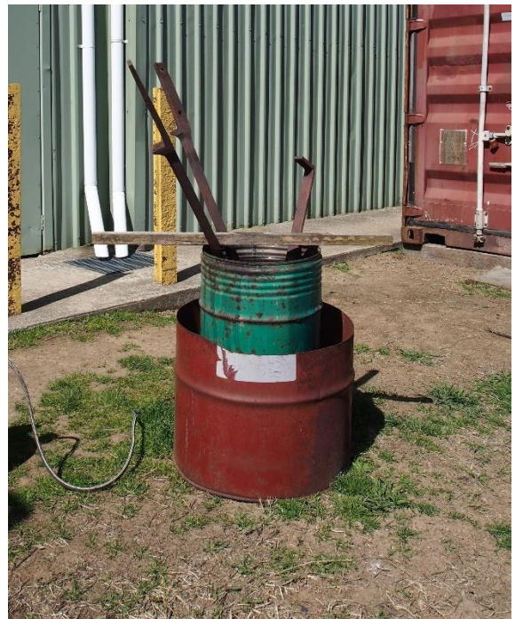
Many metal parts get a hot caustic wash to remove old paint