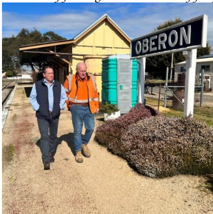
Returning to the Rolling Stock Shed after inspecting the new ramp access to the station platform.