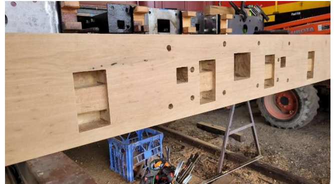
Rear headstock mortises cut. A time consuming job with a high level of accuracy required.

of overloading you with technical stuff, here's a few more photos of the restoration of HLF854 so far.