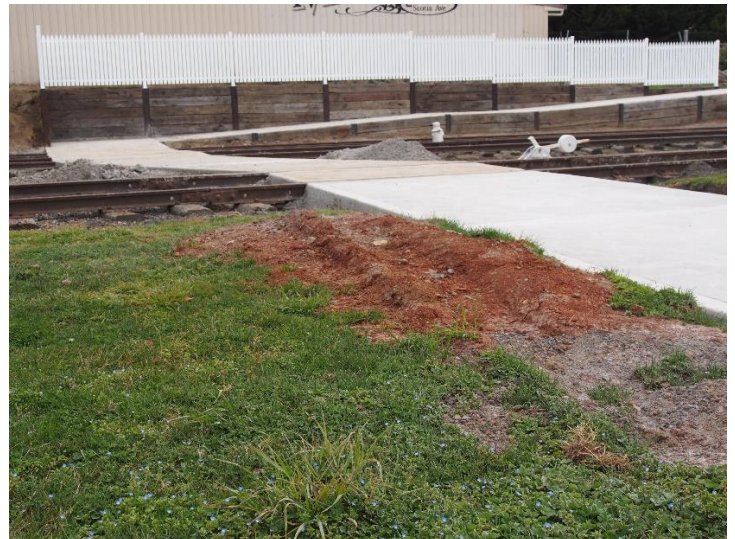
New path way looking west from North Street Car Park