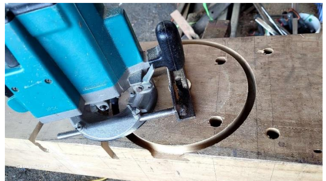
Preparing the headstock