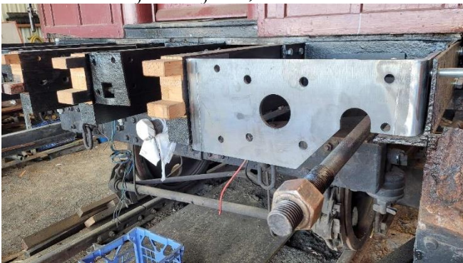
Trial fitting of angle plates....perfect!