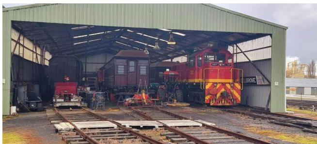
A peek into the OTHR Rolling Stock Shed.