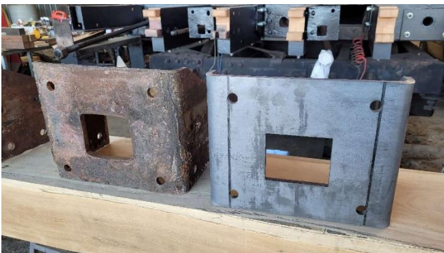
Comparison photo, New and Old