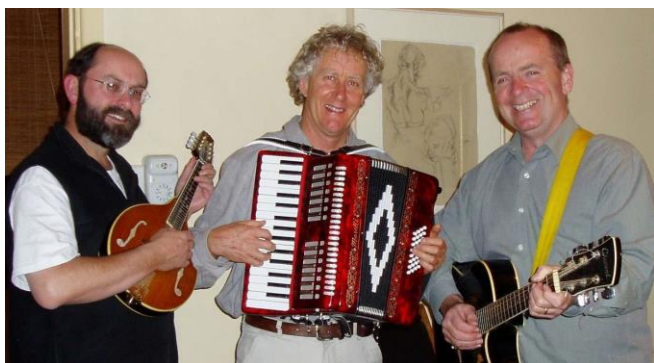
"The Nodding Thistles"

We will be offering a fabulous dinner, included in the cost of $100 PP. Interest is already high and tickets are limited, so jump in quickly and lodge your interest at admin@othr.com.au and we'll get back with further information.