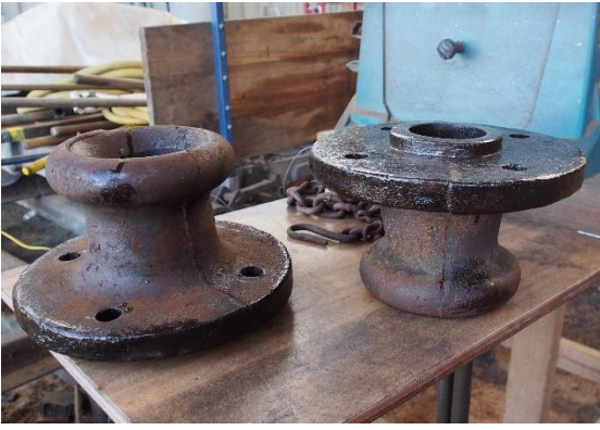
Buffer parts that have had the “hot wash”