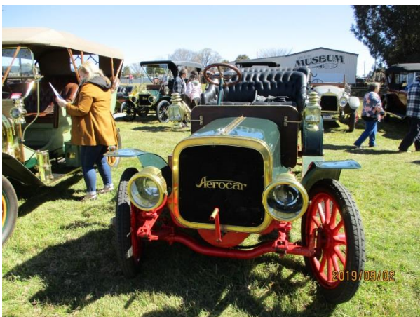
Another rare visitor to OTHR recently. Manufactured between 1905 and 1908, it was considered to be a luxury motor car.

To donate go to OTHR GoFundMe site and donate there, or alternatively send those donations to PO Box 299 Oberon. Please make it clear that you are donating to the rebuilding of the Oberon Branch line.