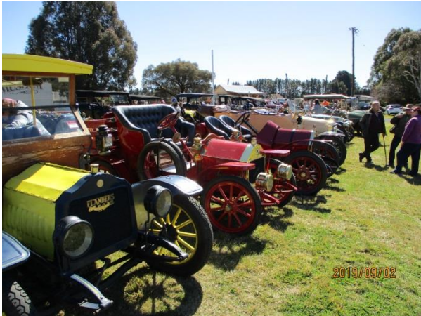
What a line up!