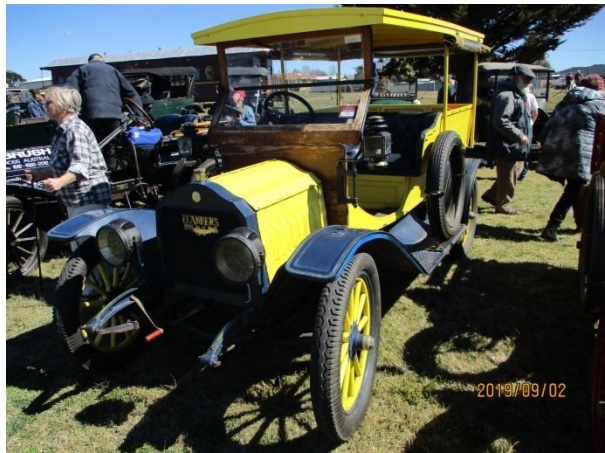
A great example of a Flanders motor car outside of the Oberon Heritage Station precinct. These vehicles were manufactured between 1910 and 1913.

OTHR is a volunteer group so you will be volunteering with a fun group but with serious intent.