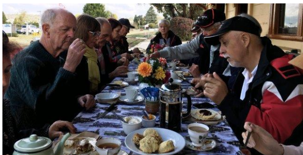
Hosting a recent group tour

Your committee is also actively advertising for group visits and we are providing a railway experience bar none. Groups are starting to line up and results so far have been encouraging. If you are a member of another group, say a car club or Rotary or Probus or a gardening club, etc. and that group is looking for an excursion, please suggest they book a group visit to Oberon station.