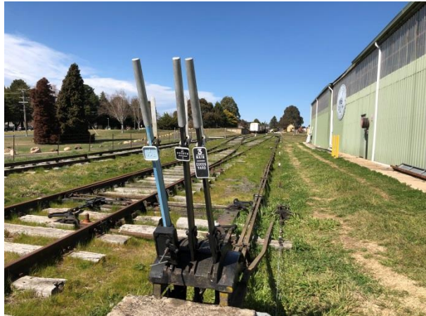
Operational "C" frame levers.