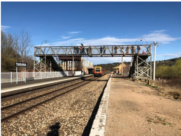
The Bathurst Bullet stopping for the first time at Tarana Heritage Station, the end of the line for the OTHR branch line.