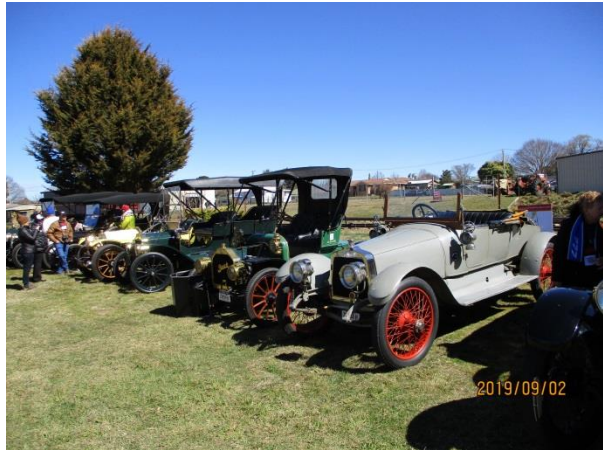
Never ending spectacle; wow!

The visitors lingered for many hours and thoroughly enjoyed their visit to Oberon – yes Simply Spectacular!