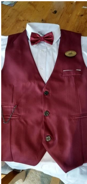
A mock-up of our future uniform featuring OTHR new corporate colours.

Still interested in volunteering? Then let's hear from you.