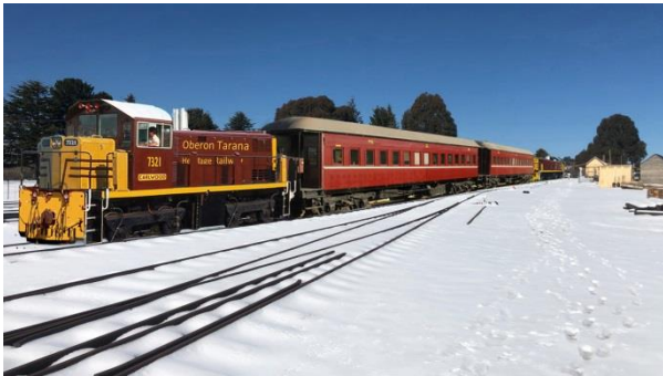
Our artist's impression of the heritage tourist train hauled by "Carlwood" in the foreground, 1897 End Platform Carriages in the centre and "Hazelgrove" bringing up the rear.

For group visits: see http://othr.com.au (contact us) or contact President Greg.