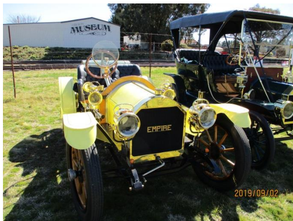
A very rare Empire motor car on a visit to the Oberon Heritage Station precinct. These vehicles were manufactured from 1906 - 1919. A beautiful pre 1916 T-model Ford is parked beside.