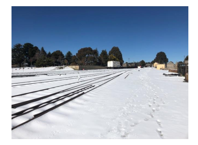
Snow at the Oberon Station yard August 2019