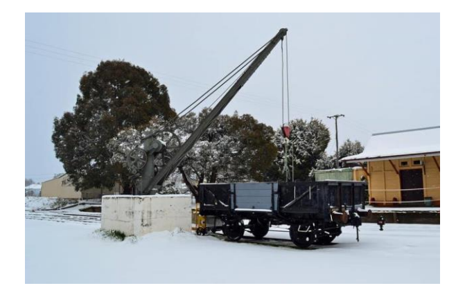
Oberon Heritage Station in Winter

A meeting was held between four interested civil engineering companies and OTHR committee to discuss the repair requirements. A selective tender process will now take place.