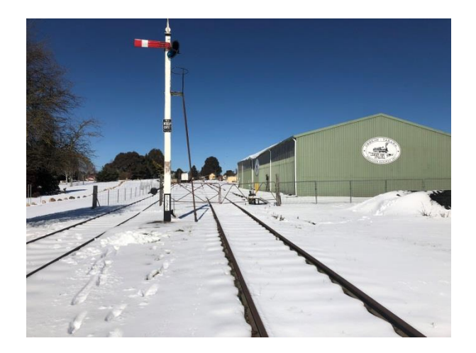
Snow at OTHR August 2019

Give it a go! There's nothing to lose and so much to gain. You might just find working on the railway is a great deal of fun.