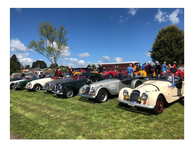
The recent Morgan Muster at the Oberon Herítage Railway precínct.

Keep an eye on the News/What's On" Section of the Website.