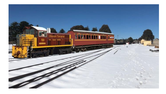
Our Artist's impression of Diesel 7321 "Carlwood" pulling HS36 in the recent snow in the Oberon Station yard.