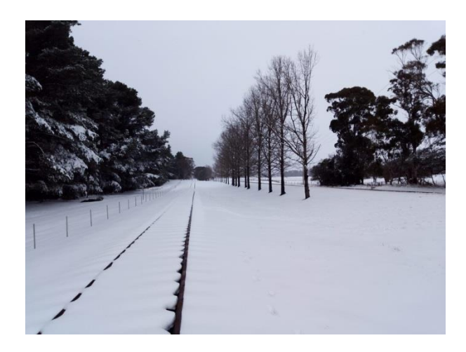
The track not far from Oberon Station Photo Martyn Salmon.

When you see these abbreviations in future it will give you an idea of what your committee is talking about.