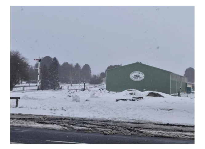
Snowy day at the Station yard.