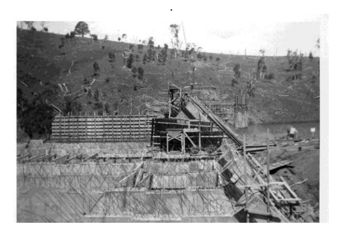
Construction of the dam, Oberon 1943