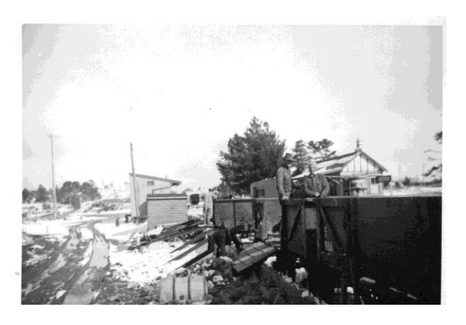
Loading produce at Oberon Station on a winter's day July 1965

We always need volunteers to help out even for an hour or two and that extra pair of hands really makes a difference.