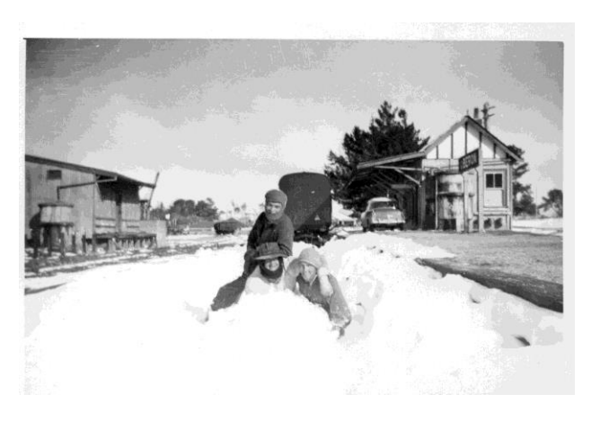
Nearly buried in snow at Oberon Station July 1965

There's no shortage of activities in Oberon in winter. Come and give us a try – you might even experience a snow fall.