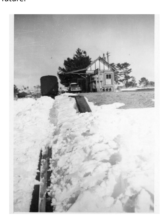
Snow drifts Oberon Station July 1965