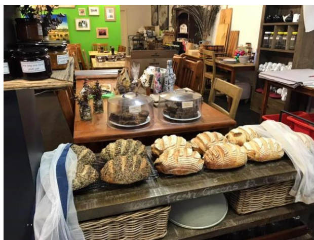
Some of the fine produce available from the Long Arm Cafe.

The order form is to be found later in this newsletter.