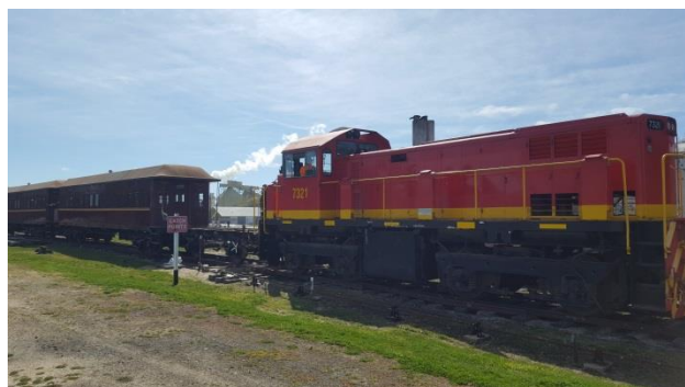
Trainee shunting in the Oberon Yard

Refer to OTHR website to download an application or see the application at the end of this Newsletter.