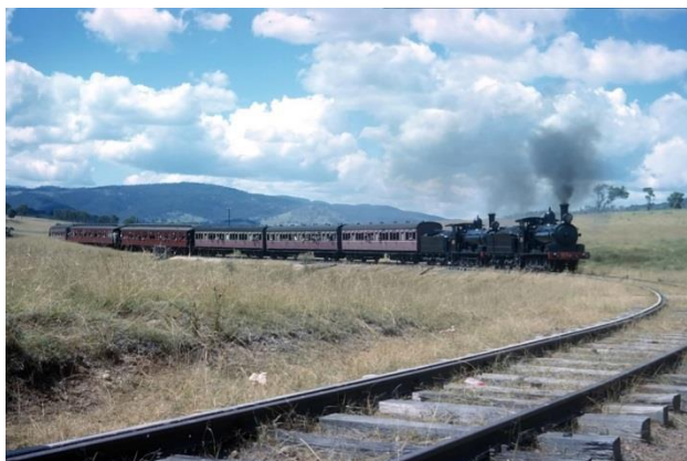
A couple of Z19 Class Locomotives making their way to Oberon

“19’s” – so I think I can claim to have ridden behind four of them, but never one!