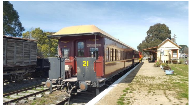
Photo shows our passenger train drawn up to the Oberon Station during a recent training exercise for Volunteers

Take this opportunity to also visit the fantastic Military Museum located opposite the Oberon RSL.”