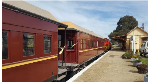
Another photo of our trainee drivers shunting in the Oberon Yard