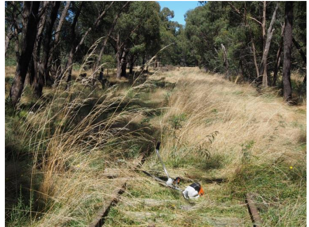
An idea of the clearing of vegetation undertaken