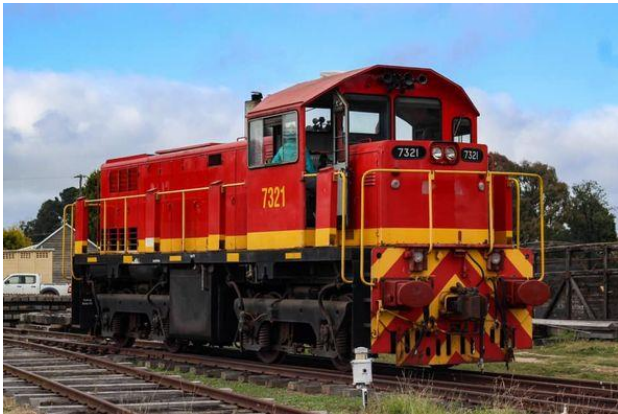
Volunteer Driver shunting one of OTHR's Locomotives in the Oberon yard.

Complete the review of SMS and Operational Procedures documents