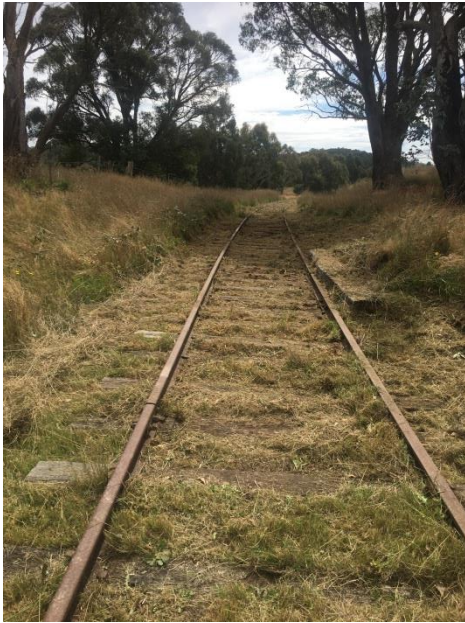
Line vegetation cleared to allow a survey of sleepers in preparation of tender documents.