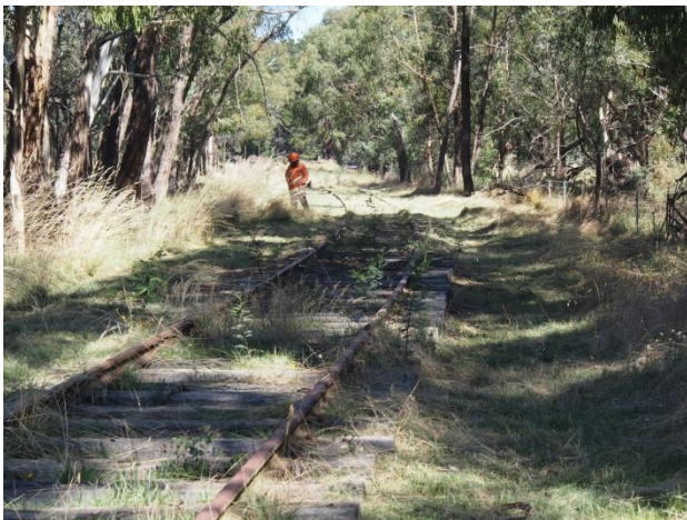
OTHR Volunteer clearing brush and weeds from the track between Oberon and Hazelgrove in preparation for rail survey.