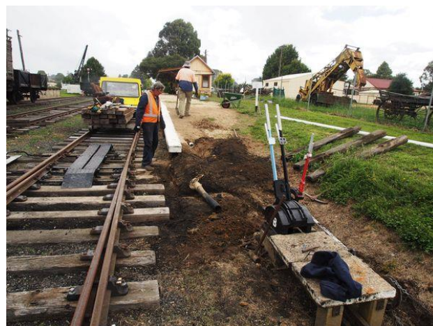
OTHR Volunteers at work near Oberon Station.

OTHR'S NEXT BI-MONTHLY MEETING IS 2 ND JUNE 2021. OBERON RSL. SPECIAL GUEST: TO BE ANNOUNCED.