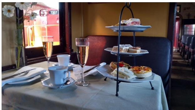
This is a depiction of our High Tea (not yet available)