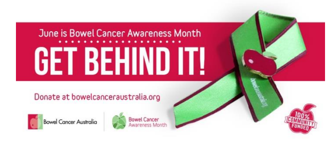
Members, be aware and get tested.