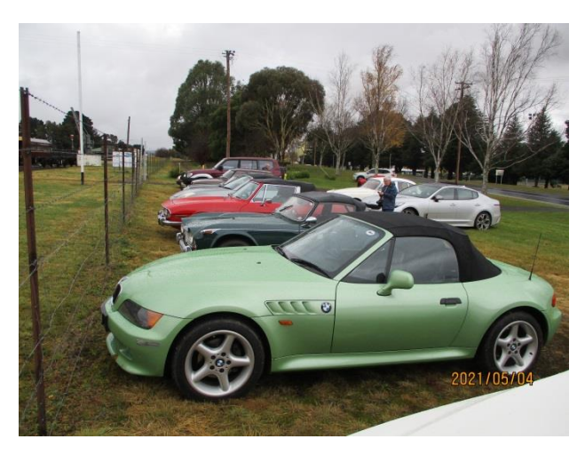
A few more classics at the Oberon Station.