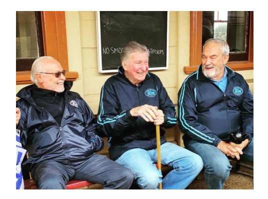
Discussing times past - members of Taree Historic Car Club Inc.