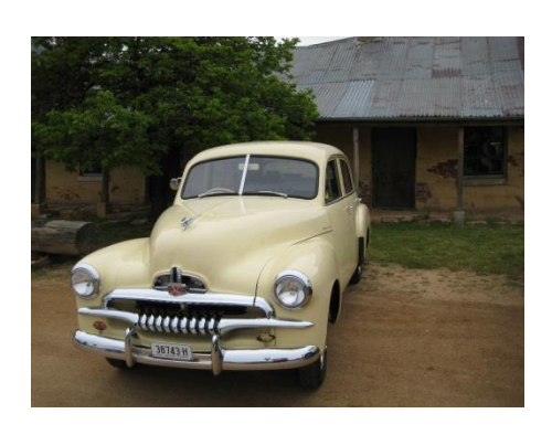
See this car at the event.

"Coffee on the Go" will provide coffee etc. and OTHR will be manning the BBQ. The precinct will be open should anyone wish to investigate the OTHR project with the usual entry fee applying.