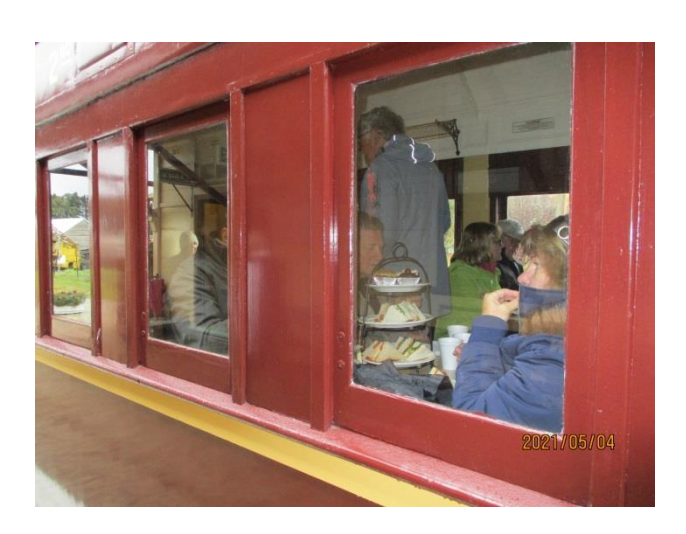
On board the Oberon Pop-up Café.