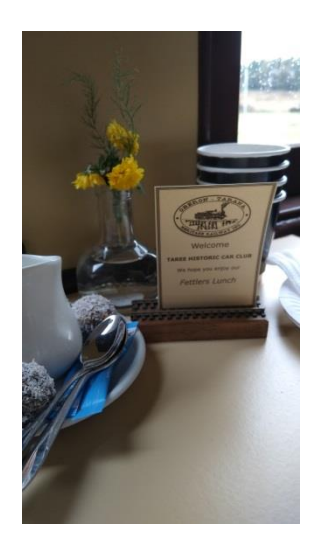
Table setting for the Fettler's Lunch

The Taree Historic Motor Club member were certainly incredulous that a small village like Oberon had so much to offer, and they hadn't scratched the surface!