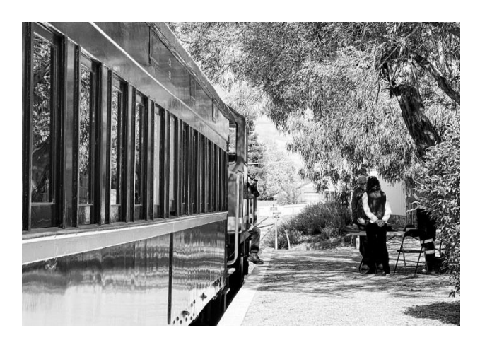
An idyllic scene at Oberon Station