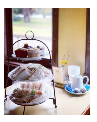
Lunch is served