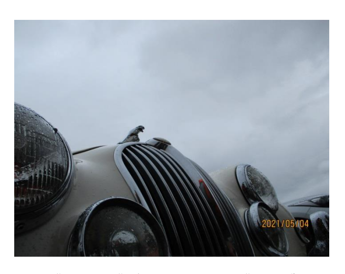
A glamorous lady contrasting a gloomy sky.