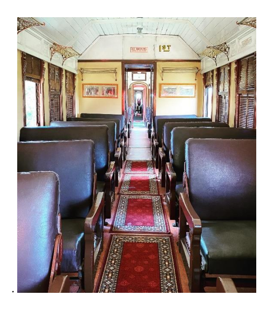
Interior of one of our 1897 End Platform Carriages.