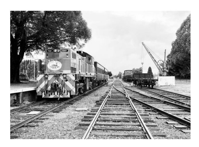
Delightful scene of Oberon Station Precinct Yard