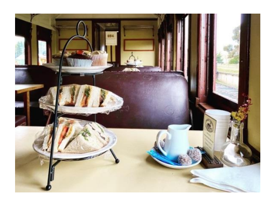
Fettlers Lunch in our pop-up café