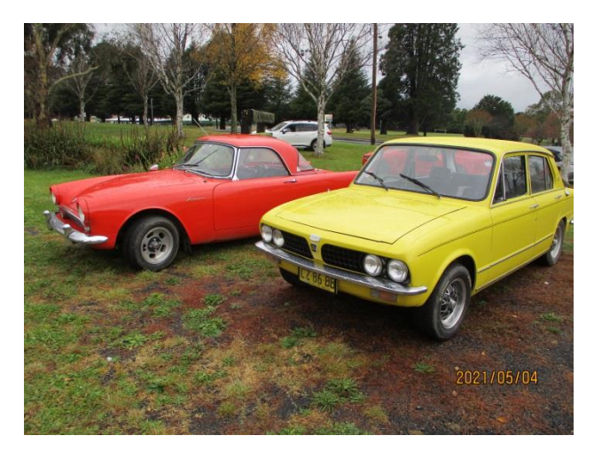
English beauties visiting from the NSW Mid-North Coast