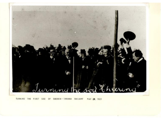
"Turning the Sod. Cheering" says the caption. Lithgow Mercury 28th May 1921