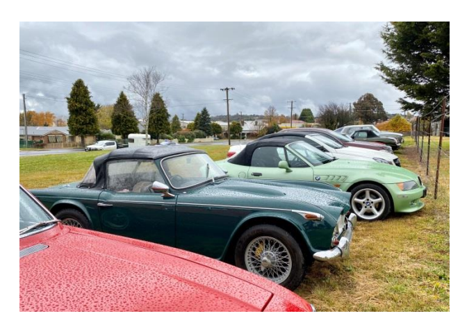
More beauties at the Station