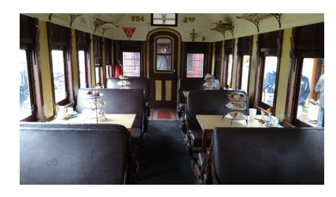
The OTHR pop-up café.