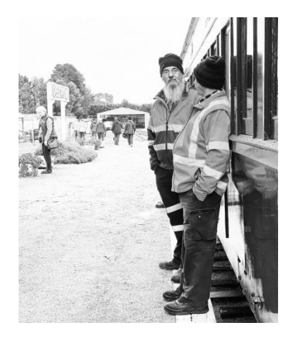
Volunteers working tirelessly at a group visit