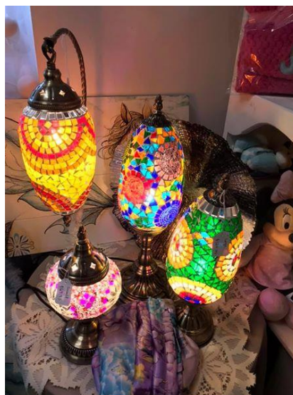
Some of the eclectic wares you'll find at Kringle Cottage

We would appreciate you passing this newsletter to others who might be thinking about a wonderful and vibrant trip to a spectacular part of Australia.