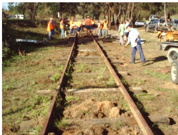
Part of the original work crew

I have included some photos of the 2007 Christmas Party. Sad to say some of these folk are no longer with us.