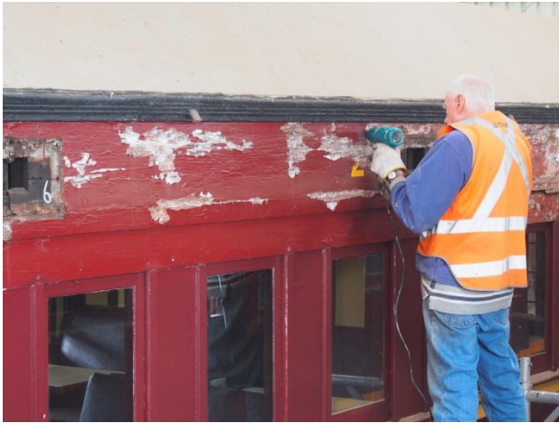
Preparation of the carriages on the other side for painting.

It's often said by some that they would like to volunteer but don't know where to look; they have skills that must be of use but where?