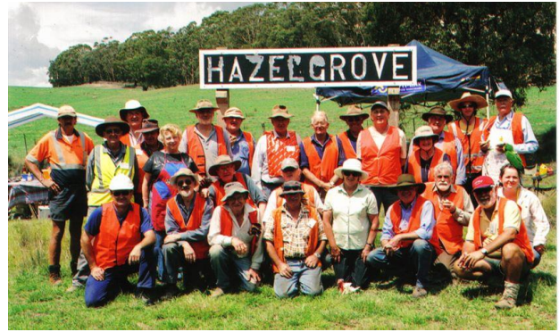
An early group of volunteers at the Hazelgrove Station site. Who do you remember?

An email outlining your ideas would be appreciated.