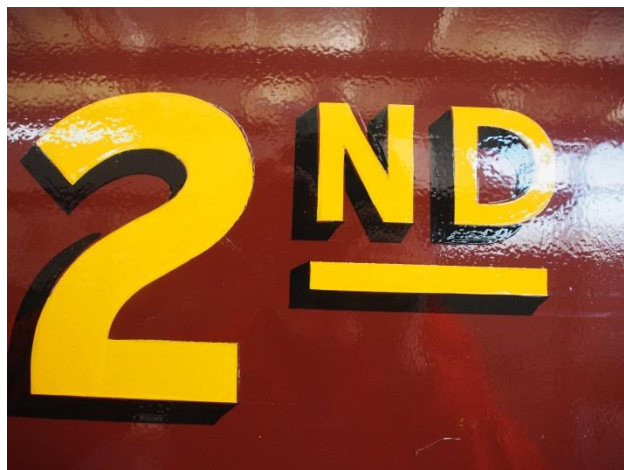
Ray, the sign writer's detailed work.