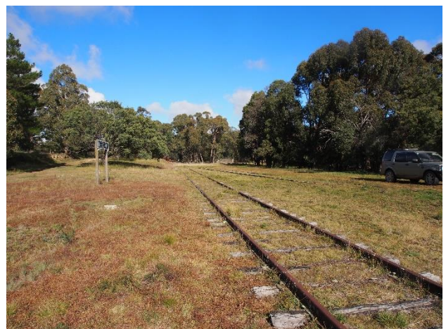
Hazelgrove June 2020