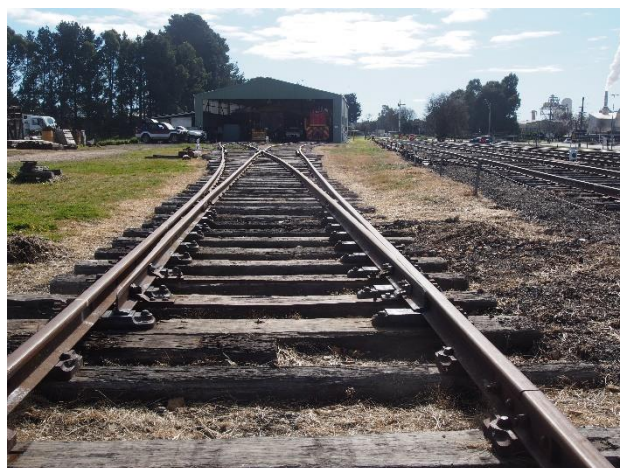
View of recent track work in the Oberon Yard. Points road 4 and 5