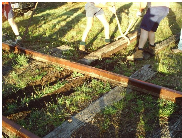
This is where it all began

Here is one of the earlier drawings used as an example for the committee as to how it may look. The drawing of the loco is just to indicate what it may look like and the locomotive has no historical significance to the Oberon line.