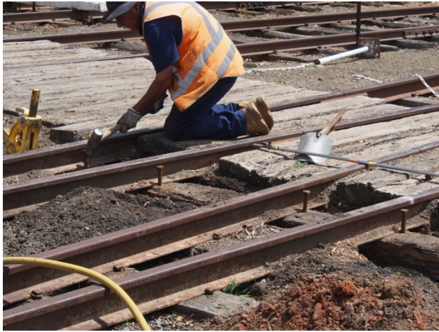
Volunteer Graham restoring the line near the pedestrian walkway