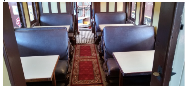
Interior view of works progress of the café.

Once completed the café will be used at our regular open days, and other events planned for the future.