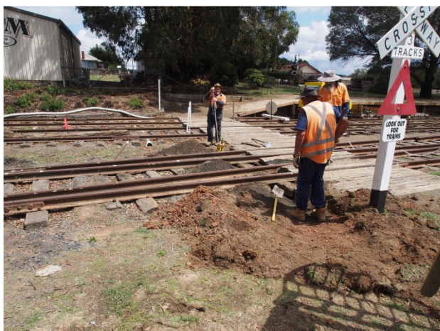
Inserting new timber near the pedestrian crossing.