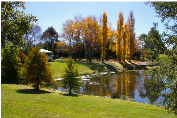
"The Common", Oberon's beautiful park located in the heart of town.

We would appreciate you passing this newsletter to others who might be thinking about a wonderful and vibrant trip to a spectacular part of Australia.