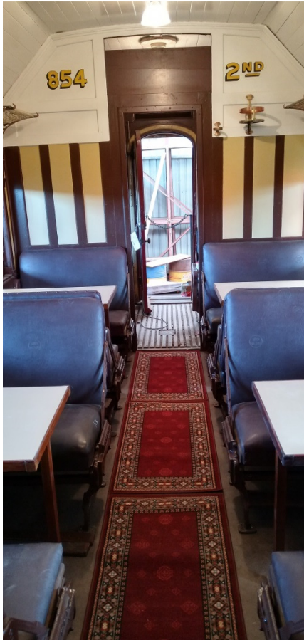
Another view of the works.