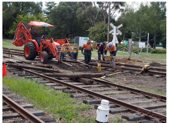
Latest working bee showing work on the line at the southern end of the Oberon Yard.