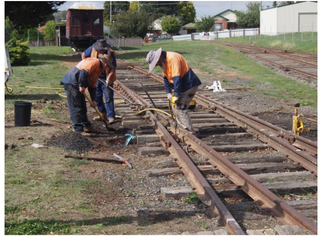
Further restoration on the line towards the coal shed

We are always on the lookout for volunteers for working bees.