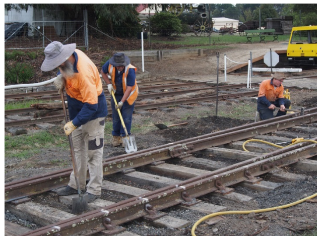
OTHR volunteers making the track good just south of the station platform.

The working bees usually have a main focus on track work in the Oberon Yard and “regulars” have developed into a very competent group of fettlers. We can always find other work for participants indoors or outdoors.