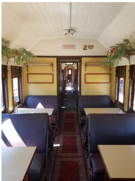
OTHR Café ready for the Rotovanner visit.