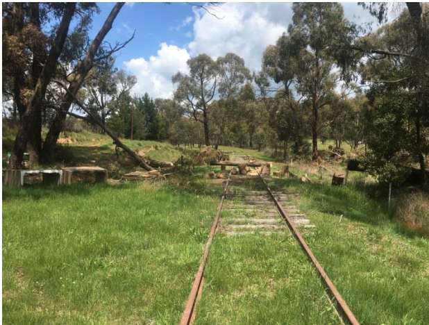
Tree largely removed