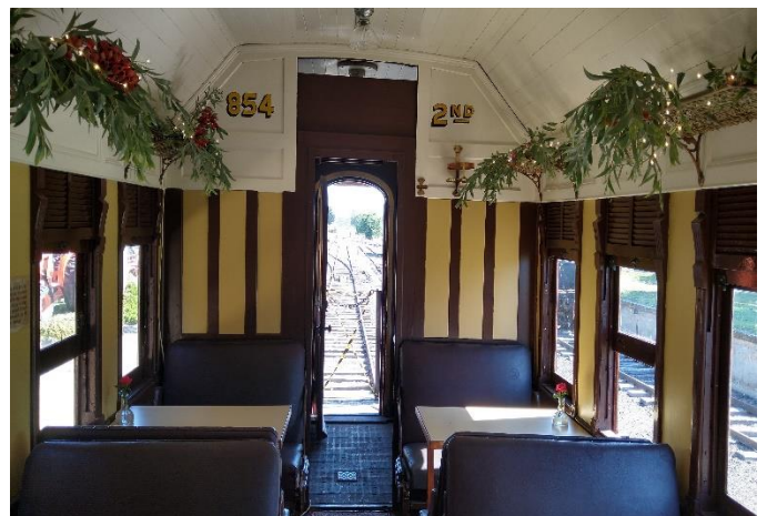
Christmas Decorations for December Open Day

Network with other rail heritage groups and museums at Valley Heights, Lithgow, Zig Zag, Bathurst and Cowra to form a Heritage Railway partnership to prioritise and promote the area as a Railway Tourist Precinct.