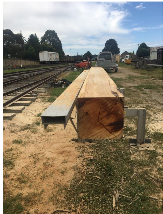
Same log now milled and ready to be seasoned.