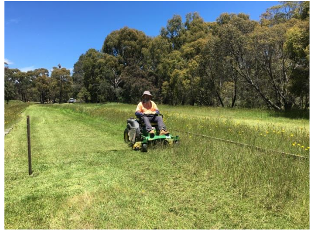
Mowing at Hazelgrove November 14 th

Over the coming weeks we will be progressively practicing weed control along the entire length of the track back to Oberon.