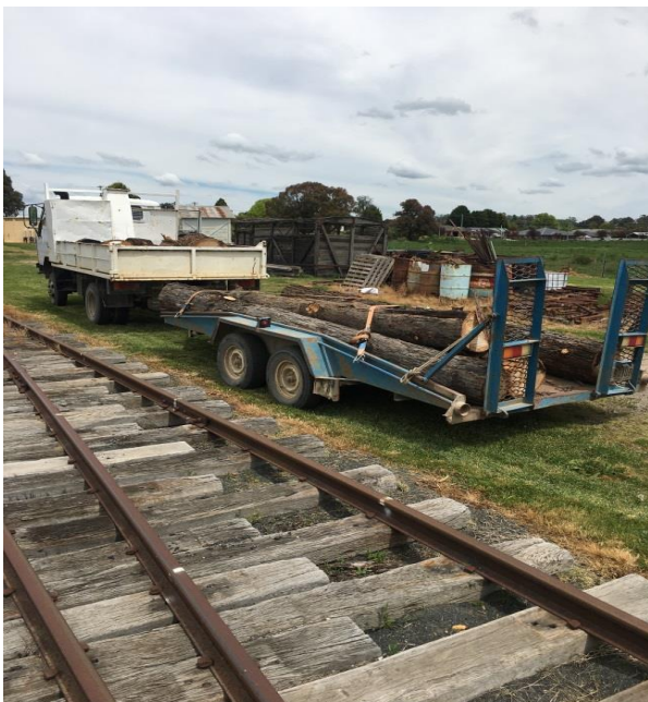
Logs safely back at the Oberon Station precinct.