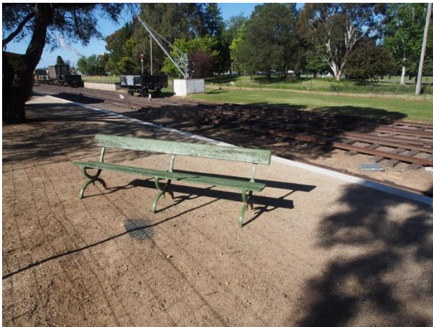
Station Seat in need of painting 14 th November