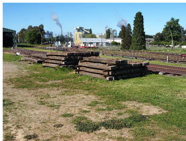
This month we have received 80 sleepers donated by Transport for New South Wales and facilitated by John Holland Rail.