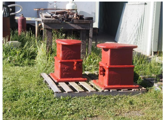
73 Class buffers sand blasted and primed ready for fitting.