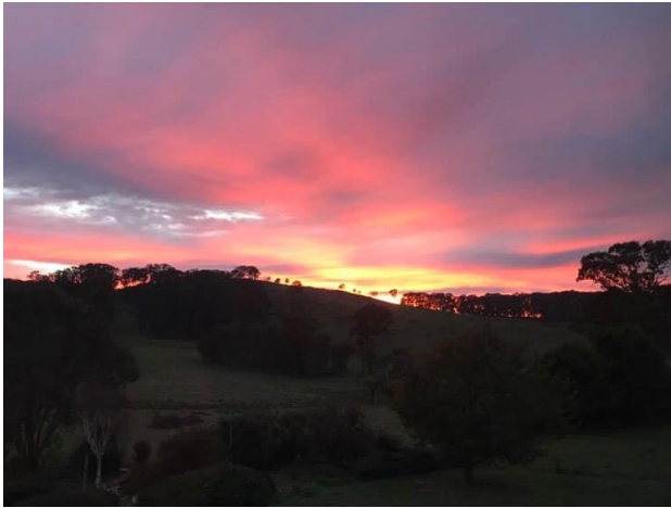
Sunset at Oberon...Simply Spectacular.