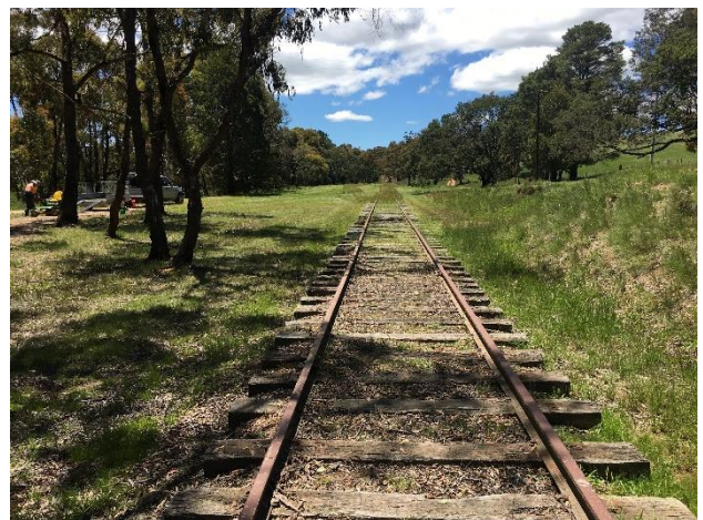
End of Day November 14 th