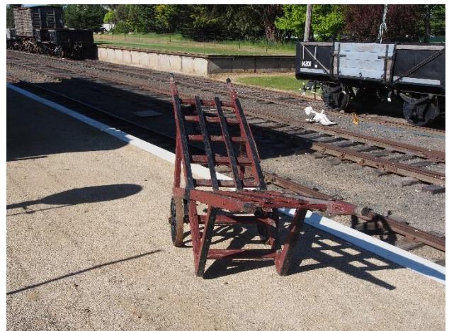
This trolley is earmarked for sanding back and re-painting.