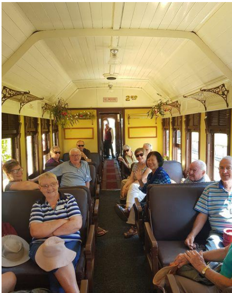
A group of Rotovanners enjoying our 1897 End Platform Carriage.

The day presented picture perfect Oberon Spring weather.