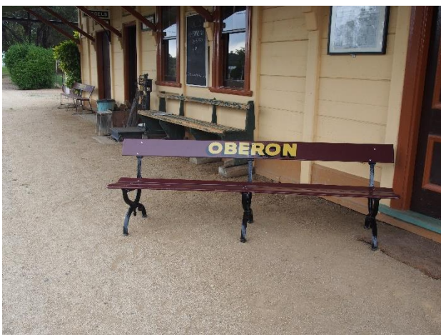
The Same Seat on December 2 nd