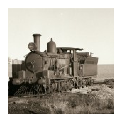
Locomotive on the Tarana Oberon line 1942

The essay is also a microcosm of rural life in Oberon in 1915. It was written during World War 1 and that event doesn't appear to be impacting Oberon very much at all at that point of time. The essay was written just eight years before the Tarana – Oberon branch line came to life.