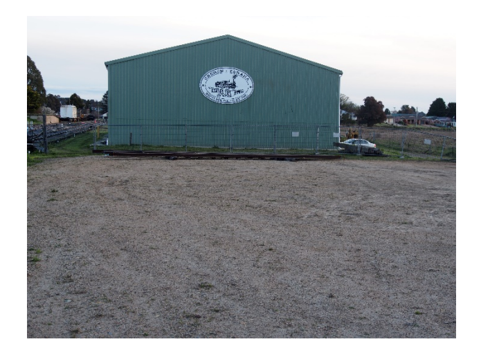
Ready for rehabilitation at the Hazelgrove terminal.

Our partners, and third parties, can also have a direct impact on the reputation of OTHR through their behaviours and actions. For this reason, we want to work with our partners to ensure that they share our commitment to safety, ethics, and compliance. We also expect and encourage all our contractors and their employees to act in a way that is consistent with Our Code. We will take appropriate measures where we believe they have not met our expectations or their contractual obligations.