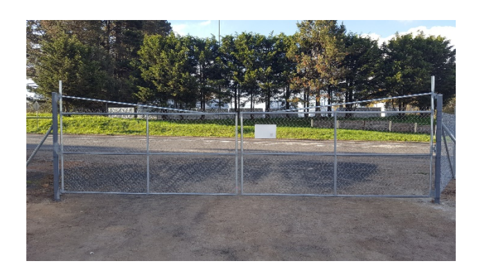
The new entrance to the "yard" off Albion Street.

Network with other rail heritage groups and museums at Valley Heights, Lithgow, Zig Zag, Bathurst and Cowra to form a Heritage Railway partnership to prioritise and promote the area as a Railway Tourist Precinct