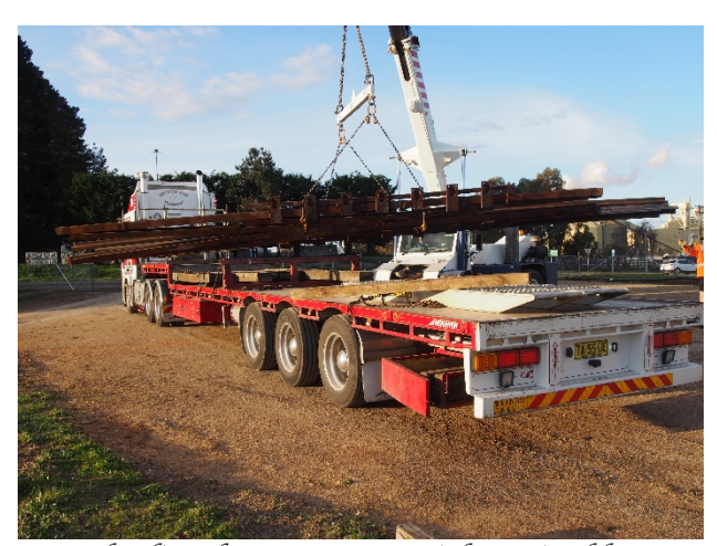
Unloading the turnout materials received from Gilgandra, NSW