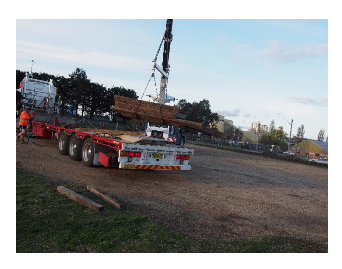
New turnout arrives at Oberon Storage Yard