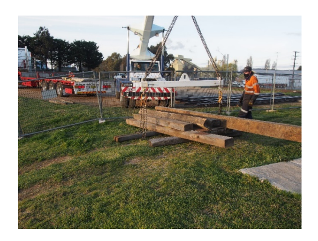
More turnout materials unloaded to the Oberon Storage Yard.