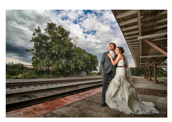
This could be your Bridal Party with Oberon Station Precinct as a backdrop.