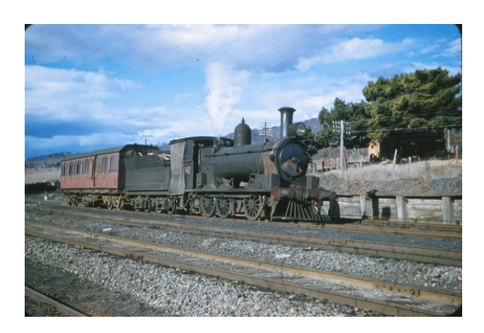
Passenger train at Tarana

Complete the review of SMS and Operational Procedures documents