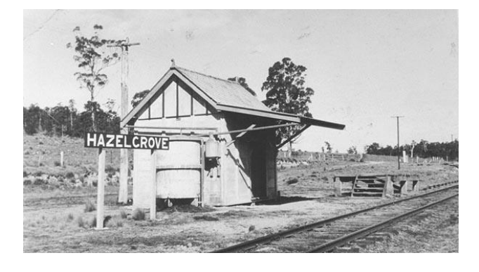
Hazelgrove Station clearly showing the waiting shed and the station stop adjacent and to the south

With COVID 19 restrictions easing in New South Wales, we would like you to consider re-engaging with us in volunteer work. Not all work is labour intensive; there is a job for everyone. Contact President Greg for further information.