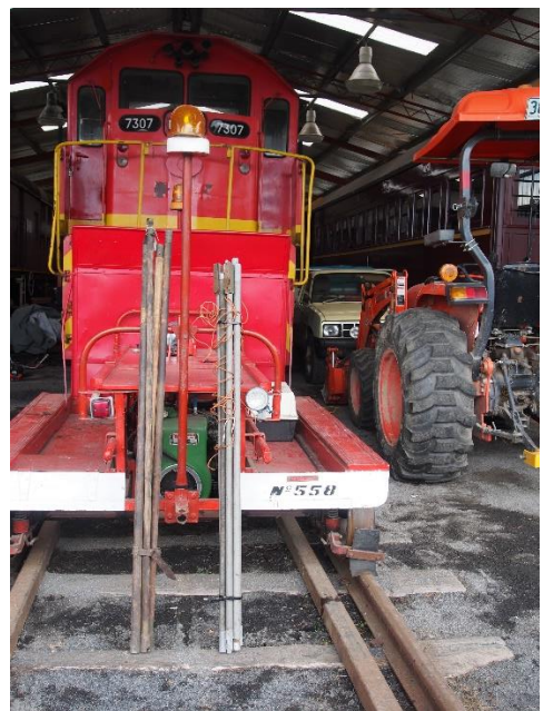
Two good set of the extension rods supported by the Wickham Section Car

"This particular item was used on the Oberon – Tarana railway.