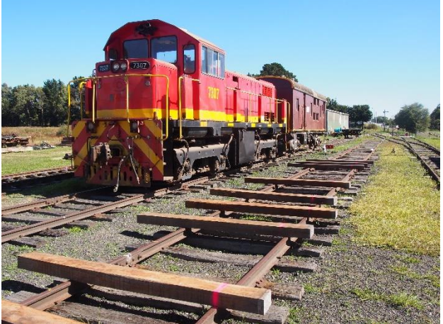
Photo taken on January 16<sup>th</sup> during the shunt The new sleepers on road 2 have replaced old sleepers at the end of their useful life in road 3

Network with other rail heritage groups and museums at Valley Heights, Lithgow, Zig Zag, Bathurst and Cowra to form a Heritage Railway partnership to prioritise and promote the area as a Railway Tourist Precinct.