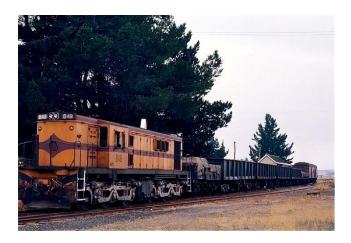
Freight train at Oberon Station