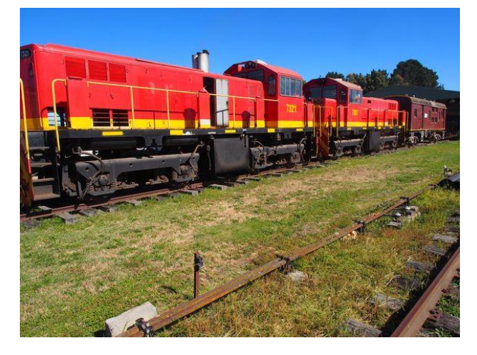
Some of the Rolling Stock involved in the recent major shunt.