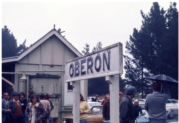
Oberon Station clearly showing car park at the rear.