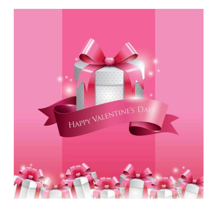
From all the romantics on the OTHR Committee... Happy Valentine's Day to all our romantic readers.

WITH COVID-19 RESTRICTIONS SLOWLY BEING LIFTED, OTHR WILL BE RESUMING BI-MONTHLY MEETINGS FROM APRIL 2021. KEEP A LOOK OUT FOR FURTHER ANNOUNCEMENTS.