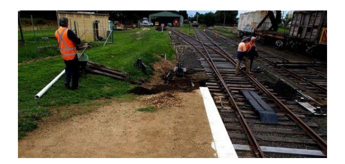
Another view of the repairs.