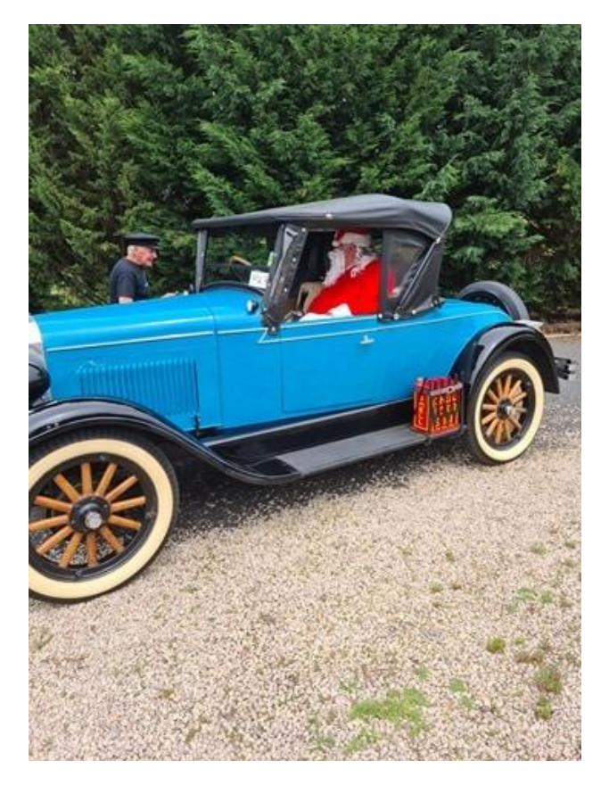
OTHR's Santa in his sleigh December 2020