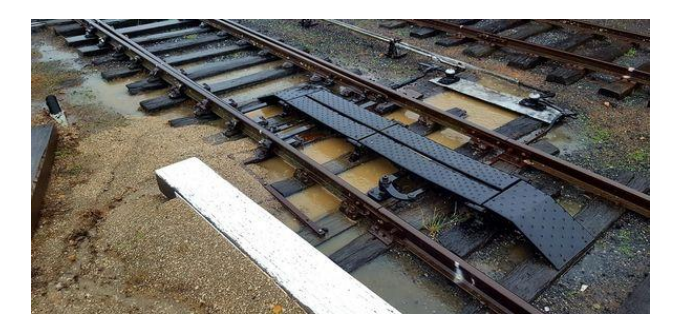
Problem: erosion of station and pooling of water.

Photos give some idea of progress made. Still further work is needed to re-pin the three sleepers.