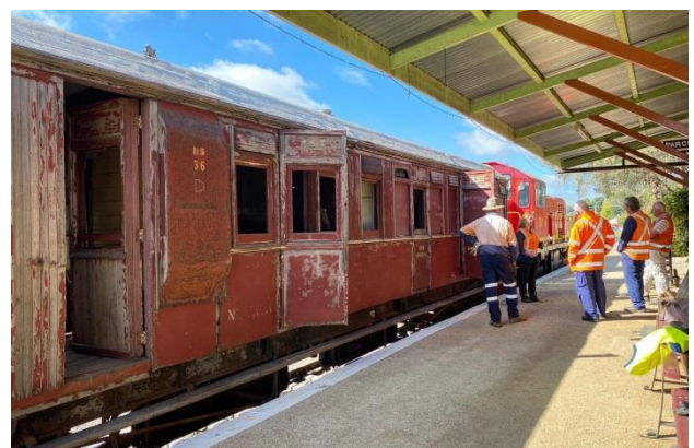
Circa March 2021. HS36 at Oberon Station drawn up in exactly the same position as in the 1930's above.