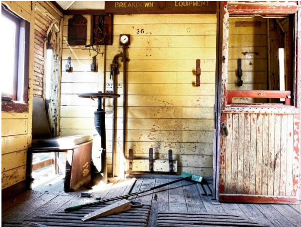
Guards Compartment in H536 after a general clean up.