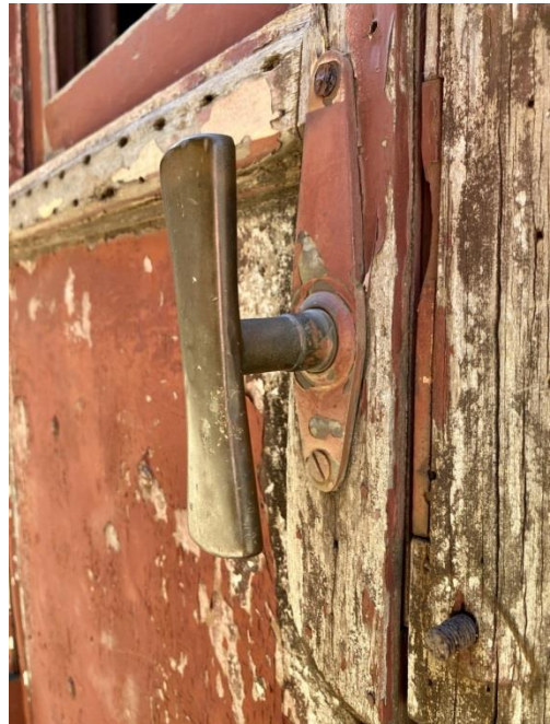
A view of the ornate brass door handle of HS36.

For group visits: see http://othr.com.au (contact us) or contact President Greg.