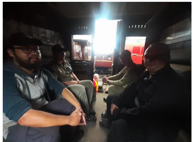
A few gentlemen on a private tour of the Oberon Station Precinct seated in HS36