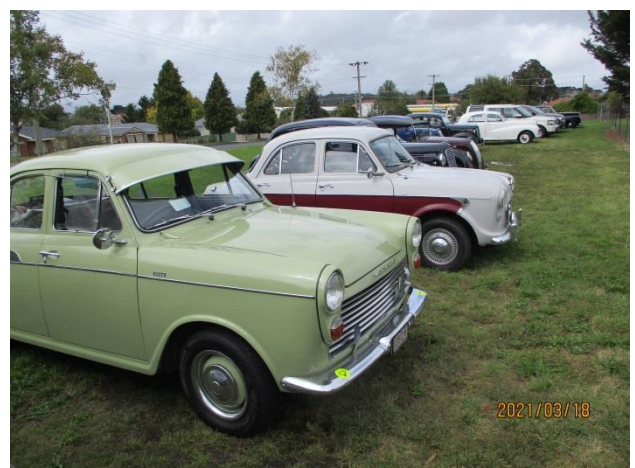
Some of the lovely Morris' attending Oberon Railway Precinct as part of their grand tour.

The Morris Register members certainly enjoyed their day in Oberon and OTHR enjoyed hosting them.