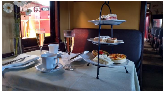
This is a depiction of our High Tea (not yet available)