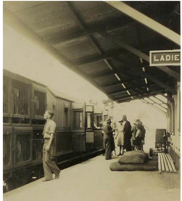
Circa 1930's Mixed at Oberon Station showing the side loading HS Composite Carriage with a GSV loaded sheep van.