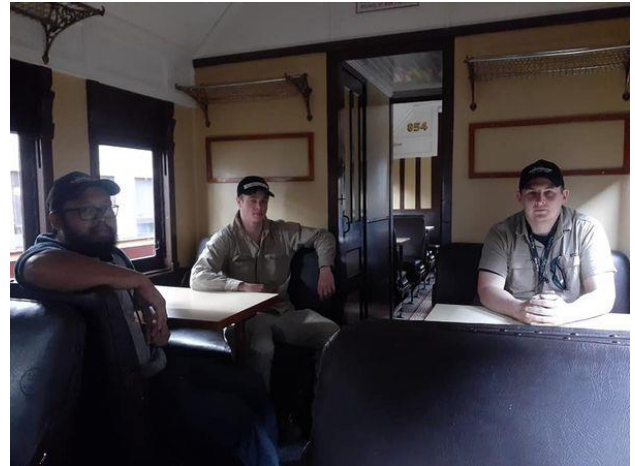
Private tour visitors seated in the pop up café located in one of our 1897 End Platform Carriages.

OTHR, Oberon District Museum and the Skoda Tatra Museum are open between 10 AM and 2 PM on the first Saturday of each month, coinciding with the Oberon Farmers Market.