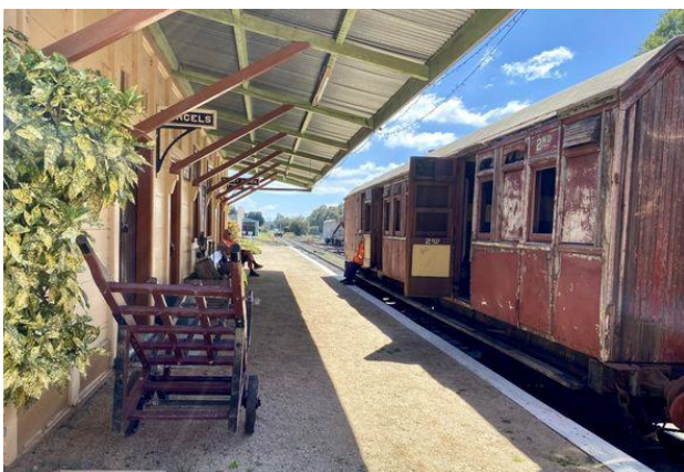
A wonderful view of HS36 and the Oberon Station Platform. 2021 or is it 1964?