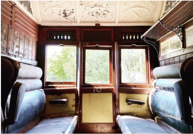
Inside view of a first class compartment in HS36. Remarkable Condition!!