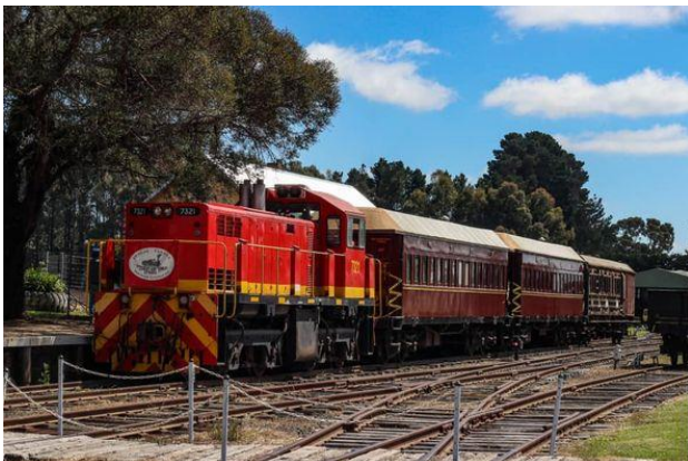
Open Day, 6 th March 2021 showing our 73 Class locomotive at the station with the two 1897 End Platform Carriages and HS36. Below, preparing for the Open Day.

Complete the review of SMS and Operational Procedures documents