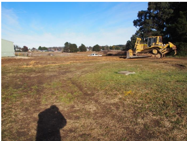
Oberon Council's gun bulldozer levelling an area behind the rolling stock shed for use as a storage depot for the railway refurbishment.

This area will be used to stockpile materials for use in the reconstruction. As materials are sourced, they will be stored pending redeployment in the refurbishment of the railway line.