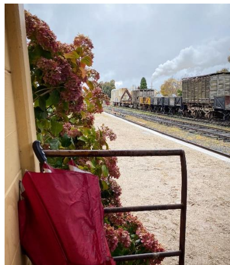
Rainey Day at Oberon Station