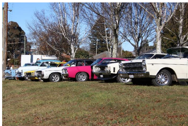
Another section of Oberon Railway Cars and Coffee 27 th June