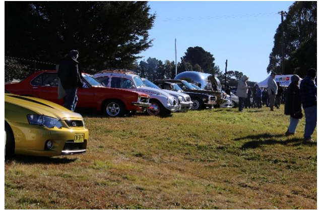
Yet more visitors to Oberon Railway Cars and Coffee.