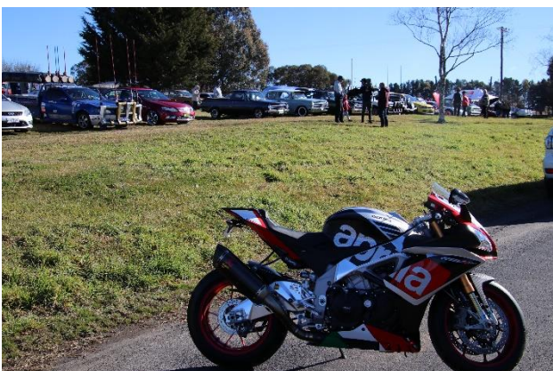
A fabulous Motor Bike at Oberon Railway Cars and Coffee