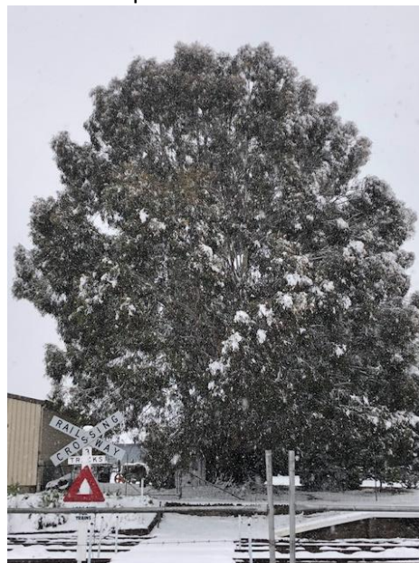
Spectacular entrance to the Oberon Heritage Station on a snowy June day.