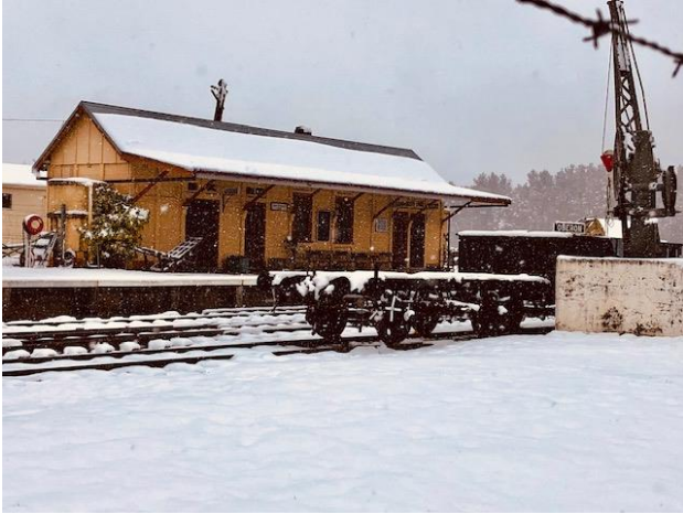
A winter's day in June.