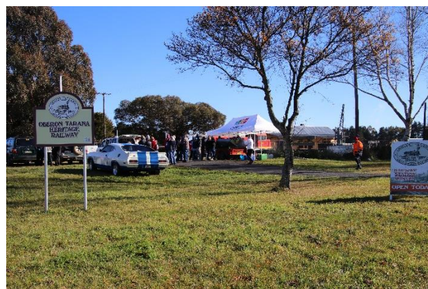
Oberon Railway Cars and Coffee Engine Room Early in the day.

So, all car enthusiasts note, reserve the date when announced for a run to Oberon and enjoy a lovely day with like-minded people.