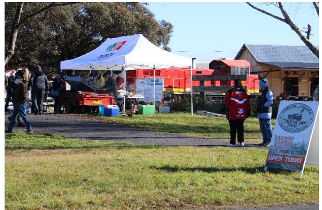
The engine room