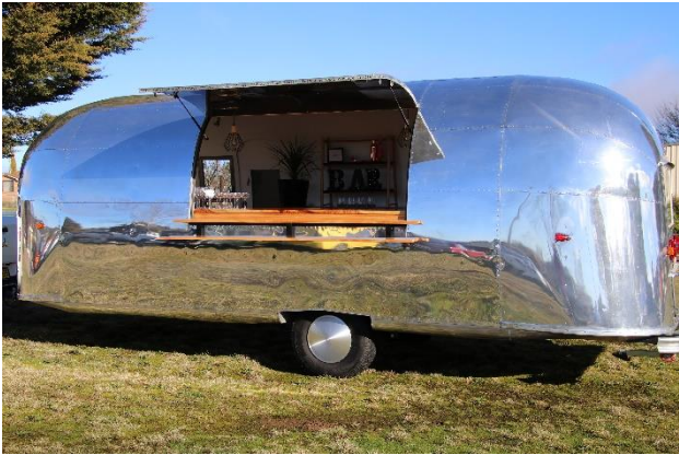
Local, Donna's exquisite Airstream caravan set up as a functions bar at Oberon Railway Cars and Coffee.