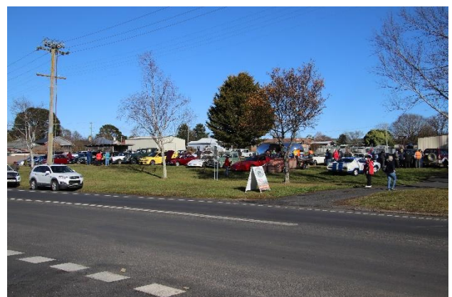
A general view of just one part of Oberon Railway Cars and Coffee on Sunday 27 th June.

IMPORTANT NOTICE. Open Day 3 rd July cancelled due to restrictions surrounding Corona Virus.