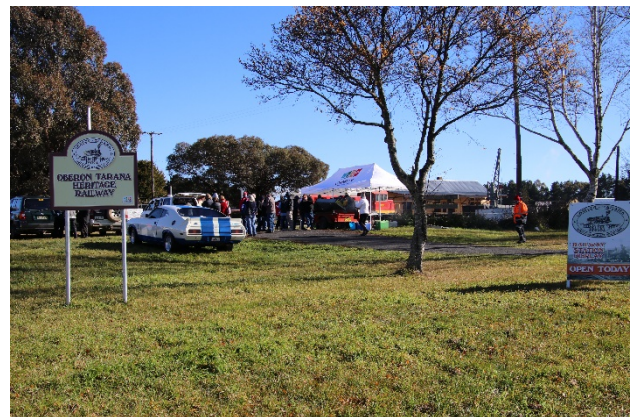
Oberon Railway Cars and Coffee Engine Room Early in the day.

So, all car enthusiasts note, reserve the date when announced for a run to Oberon and enjoy a lovely day with like-minded people.