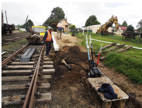
Working Bee activity