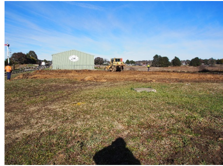
And so work begins. on Stage 1 Oberon to Hazelgrove.

This area will be used to stockpile materials for use in the reconstruction. As materials are sourced, they will be stored pending redeployment in the refurbishment of the railway line.