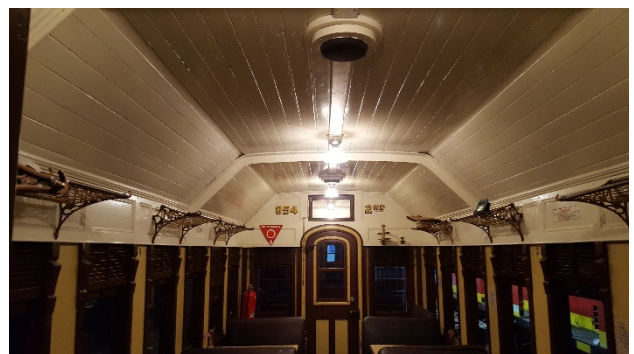
Lighting Improvements in HLF 854