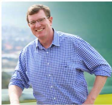
Andrew Gee Co-Patron Federal Minister for Veteran Affairs and Minister for Defence Personnel.

Congratulations and Best Wishes from the Committee and Members of Oberon Tarana Heritage Railway Inc.