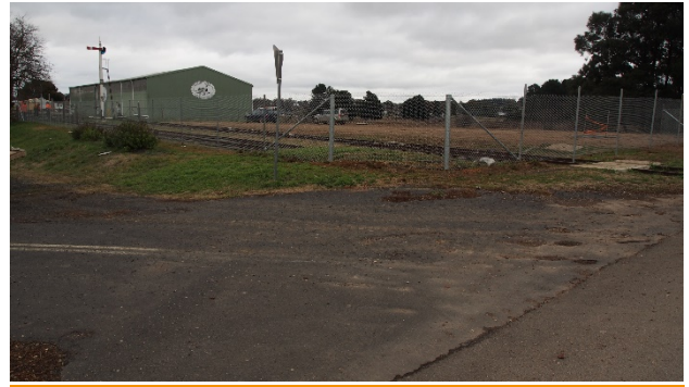
Fencing project is completed!