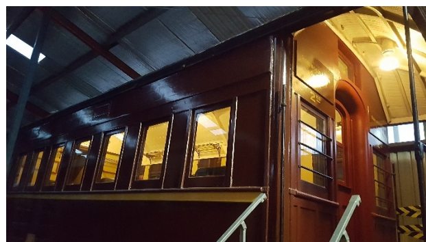
Lighting Improvements in HLF 854