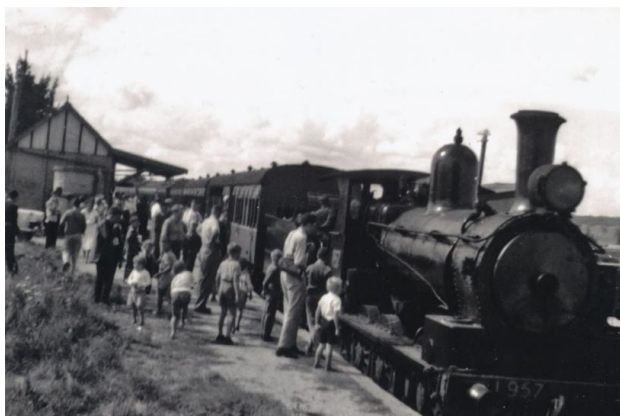
A very early arrival at Oberon Station.

Evening News Wednesday 1 st October 1884. "...The chairman of the Oberon Progress Committee telegraphed as follows – Great indignation was expressed at the meeting of the Progress Committee on Saturday night at the Tarana to Oberon railway, not having been included in the estimates. A special meeting has been called for Saturday, October 4, to consider the action of the members for the district..."