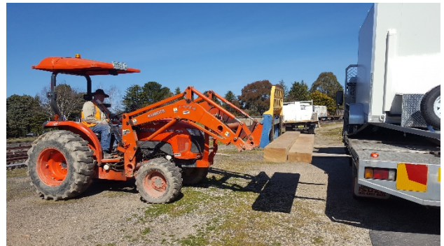
The tallowwood headstocks for the End Platform Cars were delivered on September 1 st From Manning Timber Supplies Hillville NSW