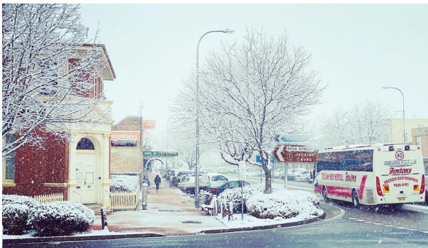
A delightful Winter's Day in Oberon's main Street

Membership is due at the end of June annually. Refer to OTHR website to download an application or see the application form at the end of this Newsletter