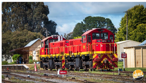
Assembling the train for the November Open Day.