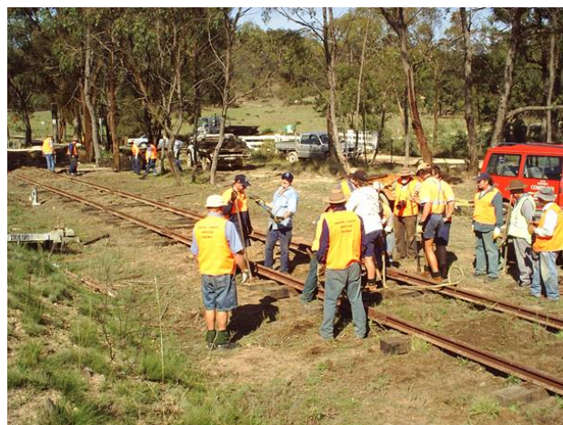
Some of the early volunteers hard at work on the track probably around 2006.