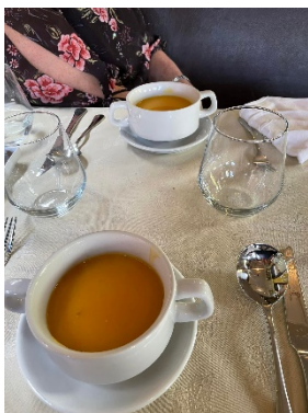
Another course presented at the OTHR High Tea enjoyed by staff from the Long Arm Farm Café.

Membership is required to cover insurance for any volunteer work you can contribute. Membership is due at the end of June annually. Refer to OTHR website to download an application or see the application form at the end of this Newsletter