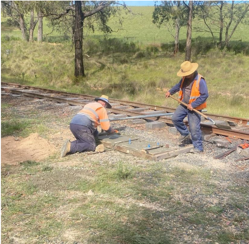
Laying the concrete pad for the installation of frame A at the northern end of Hazelgrove.