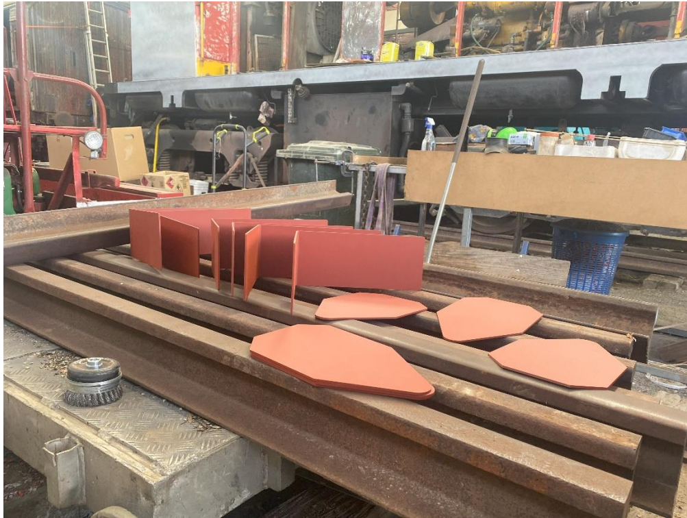
Preparation for the installation of kilometre and half kilometre posts along the line Hazelgrove to Oberon. The posts and standard shape markers are ready to go