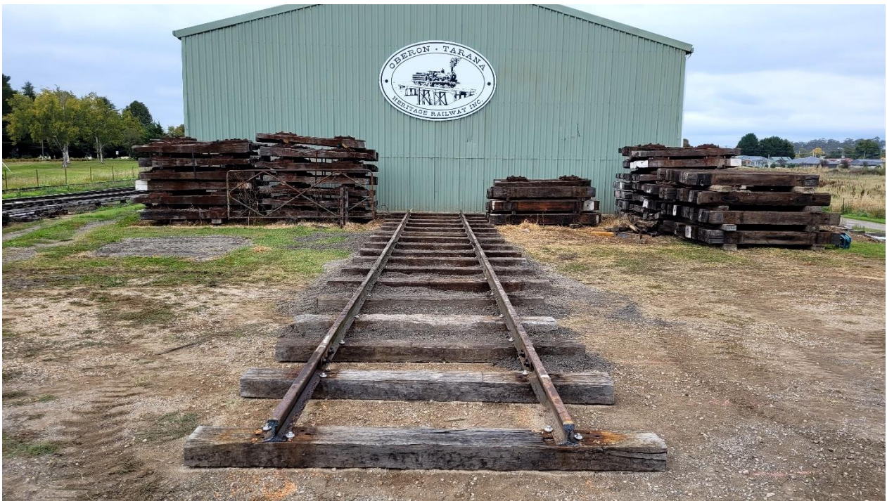
New track work in the Oberon Yard completed in March Getting ready for the delivery of End platform Car 1958