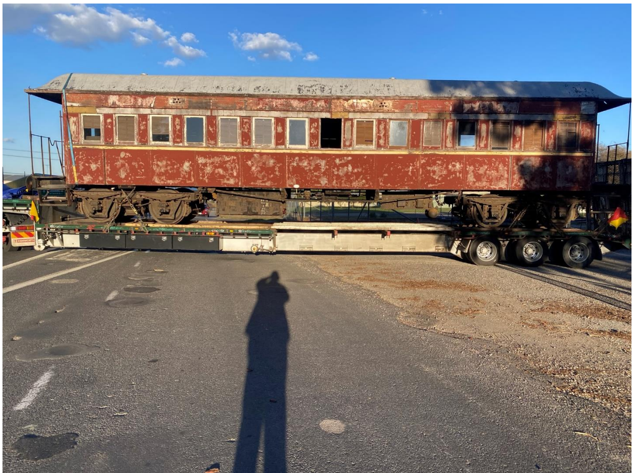
Delivery started with the blocking off of Albion Street for a few minutes last Sunday

The next Oberon Tarana Heritage Railway Inc. Quarterly General Meetings 10 th July and 9 th October 2024 Oberon RSL, 7.30 PM