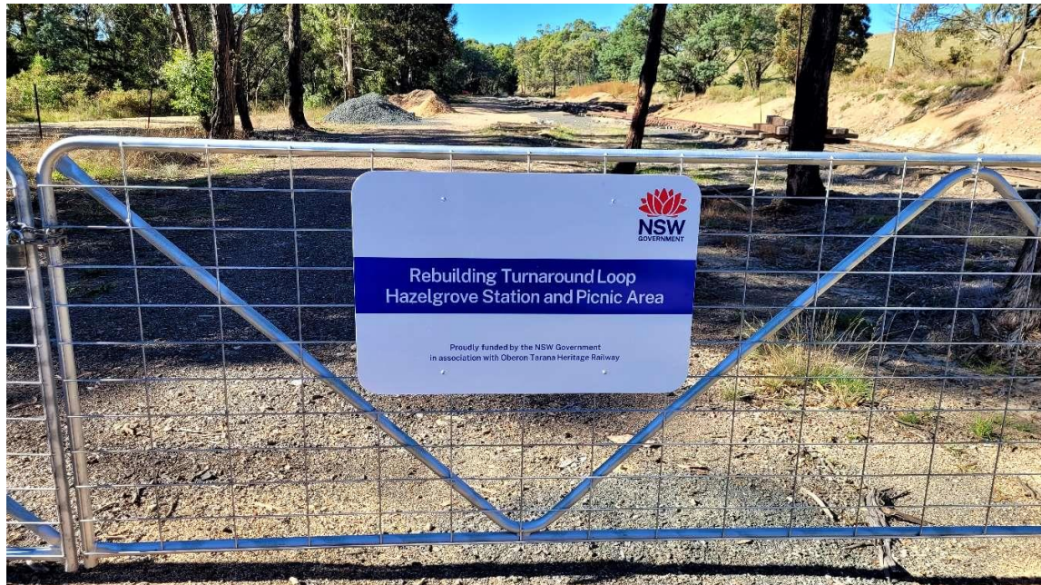
Sign noting the donation from the State Government for the funds that enabled this work. The station, picnic and toilet facilities are still to come.

Work at Hazelgrove on the runaround loop continues in earnest. The loop is now connected to both north and south turnouts. The southern turnout is currently being completed. Most of the rail is down with just some plating, gauging, and screwing to finish off. The turnout will then be jacked and packed to allow four rail welds to be performed welding our 71.5lb main rail to the 94lb turnout. This will happen in May after which the ground frames will be connected.