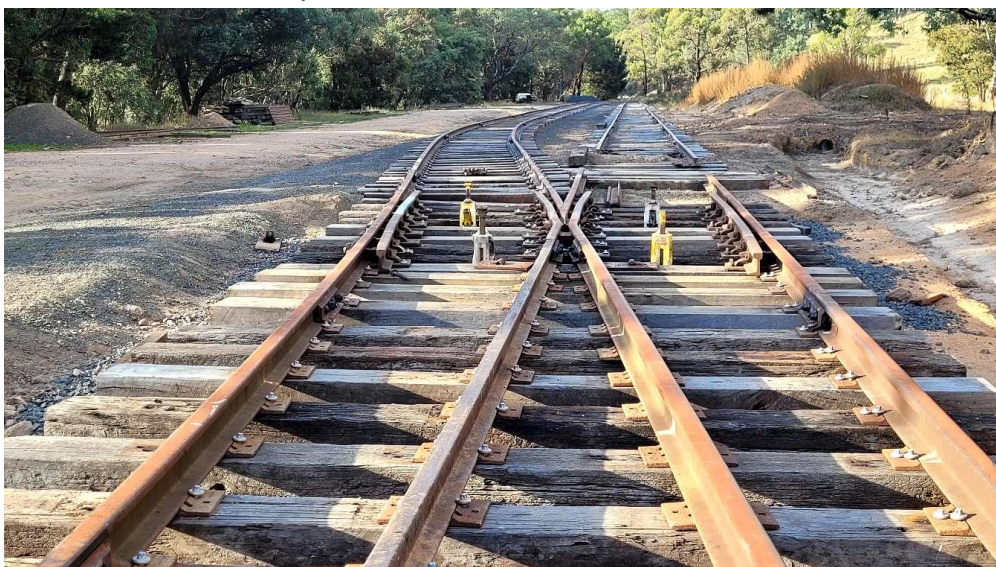
Looking back to the north showing commencement of the loop line. Next issue – Details of the work at Hazelgrove Mark Handel

The next Oberon Tarana Heritage Railway Inc. Quarterly General Meetings 10 th July and 9 th October 2024 Oberon RSL, 7.30 PM