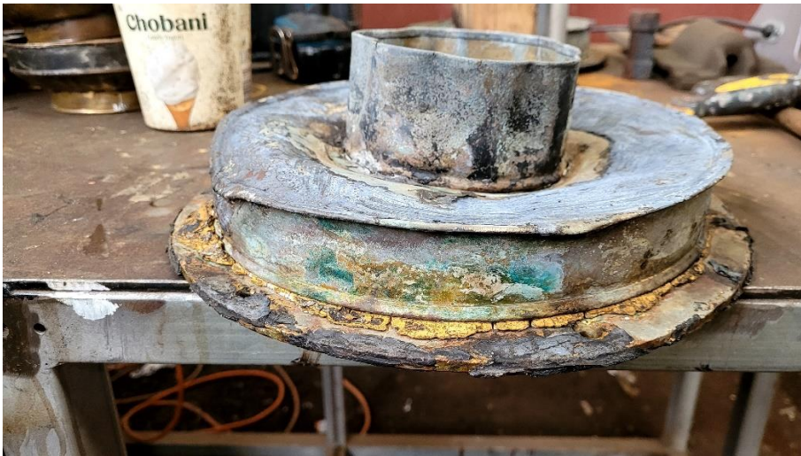
Left - Vent on removal from the roof Below – Vent after repairs

Work has also commenced on the roof with the removal of around 50% of the vents and hoods for repair. These were all banged up and had to be fully stripped of paints etc for repair. Many had hairline cracks requiring soldering to restore to serviceable condition. Work will continue on the roof until complete.