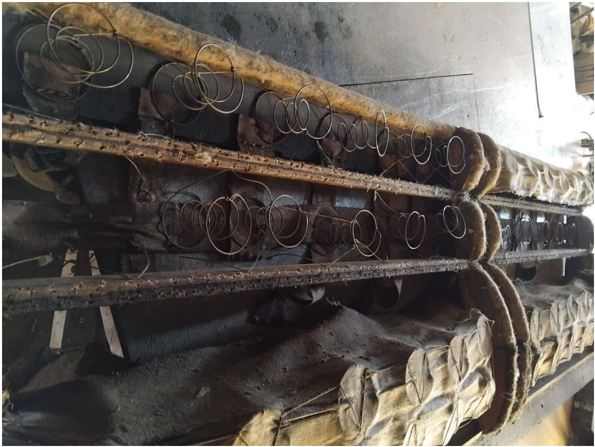
First class seat striped back.