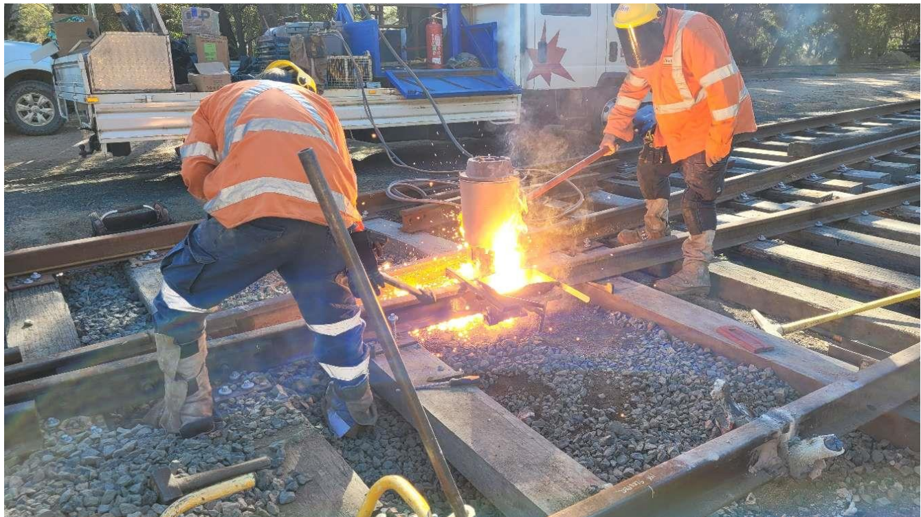
Thermite welding. Hot stuff!

Attention now turns to the road crossings. Each road crossing must have a level crossing interface agreement Oberon council. Data collection is taking place and will form part of the detailed information in our future meetings with ONRSR