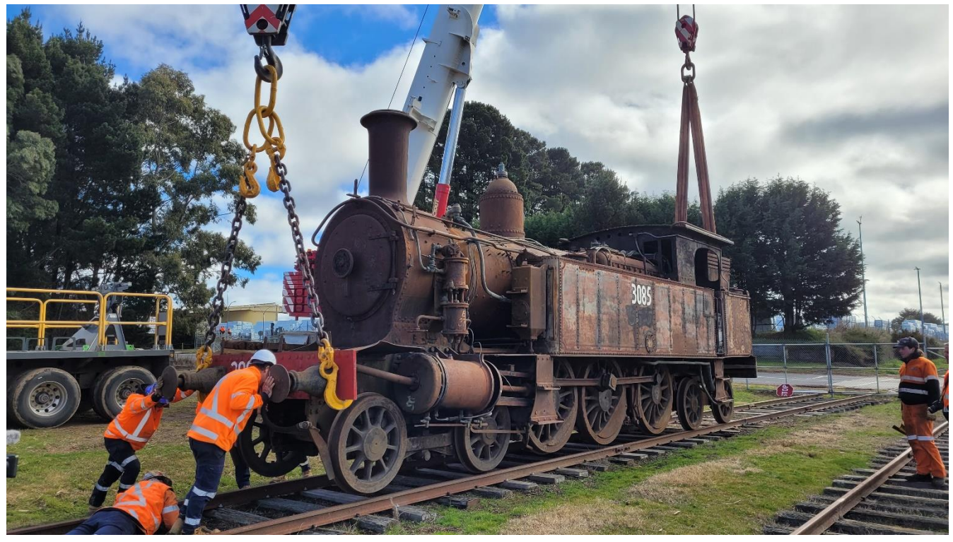
A gentle lowering onto the rails