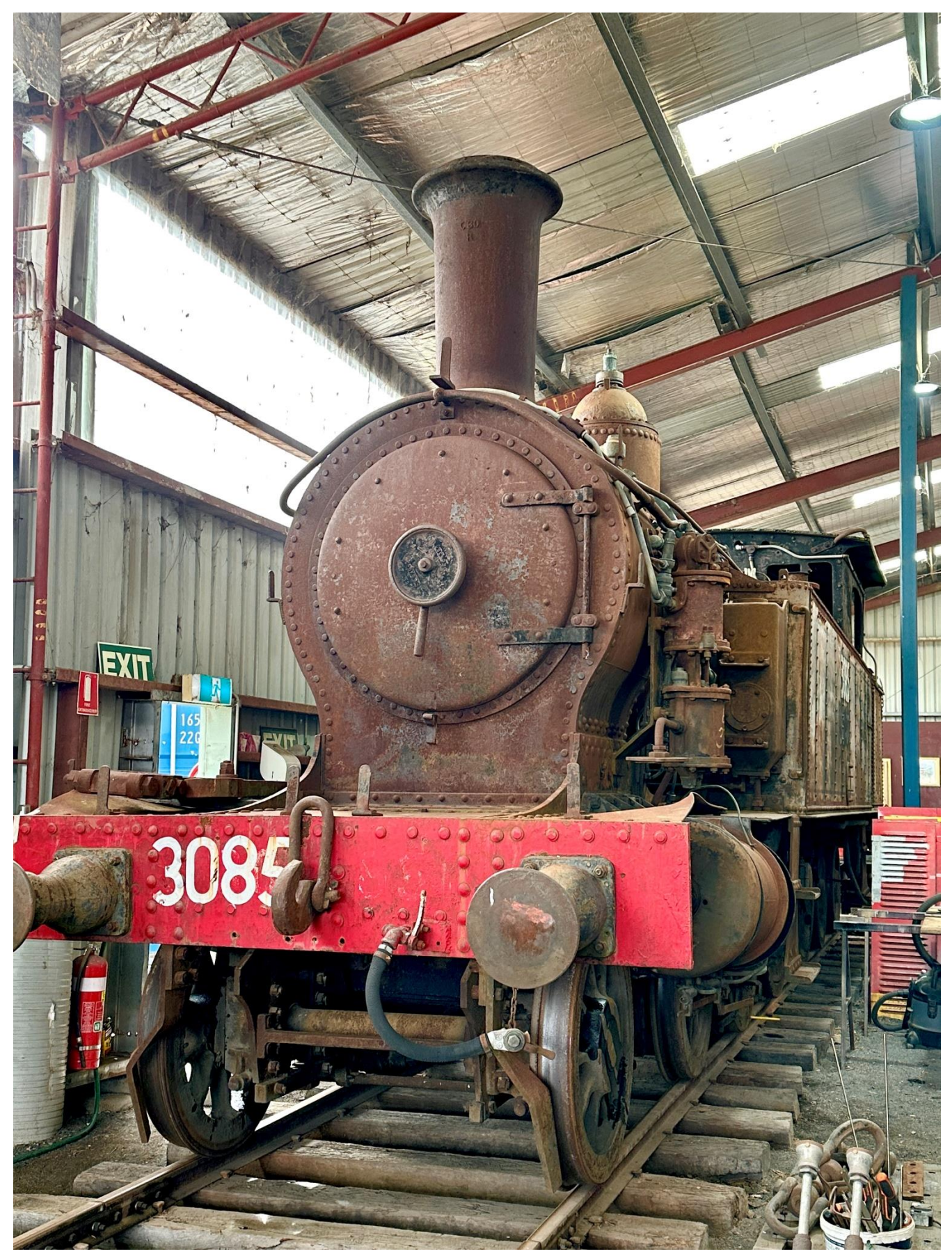
Undercover in the Rolling Stock Shed