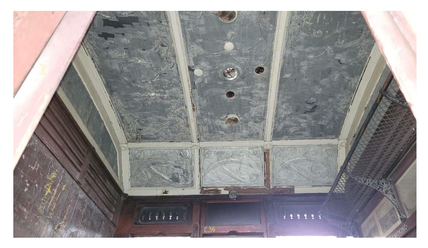
Ceiling after laser cleaning