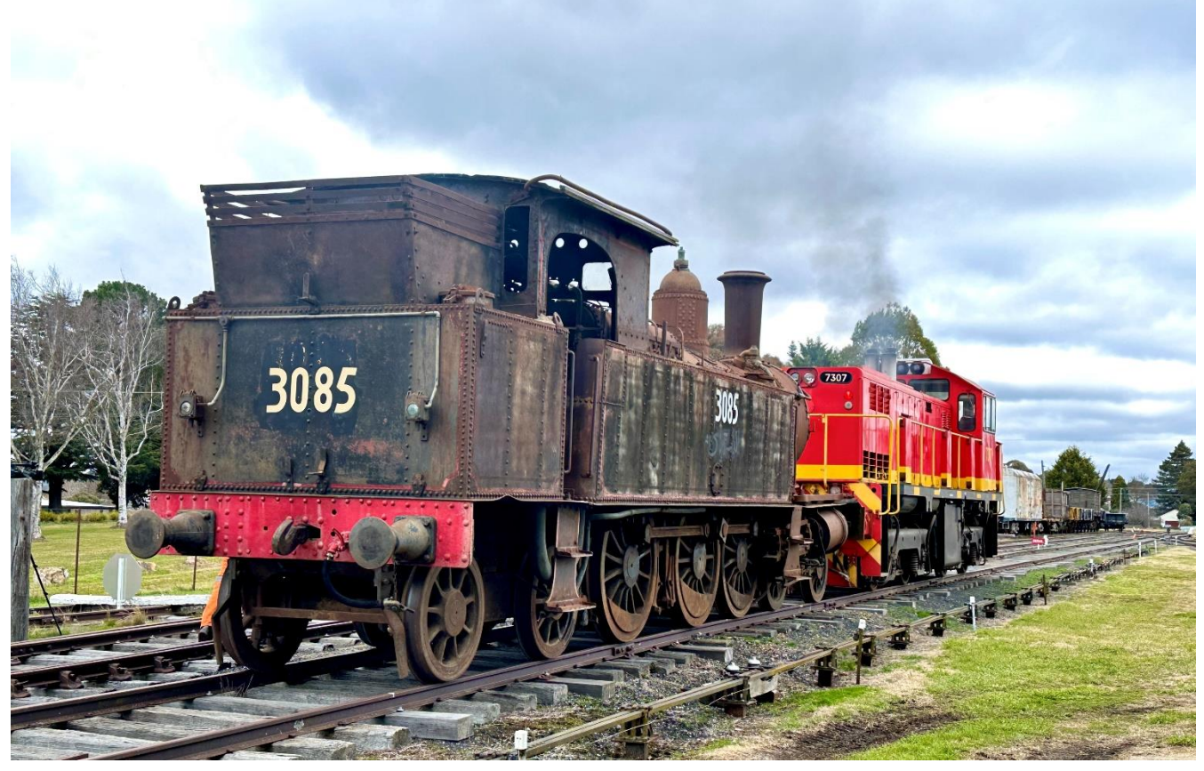
Shunting underway: 7307 showing signs of having to do more work than normal