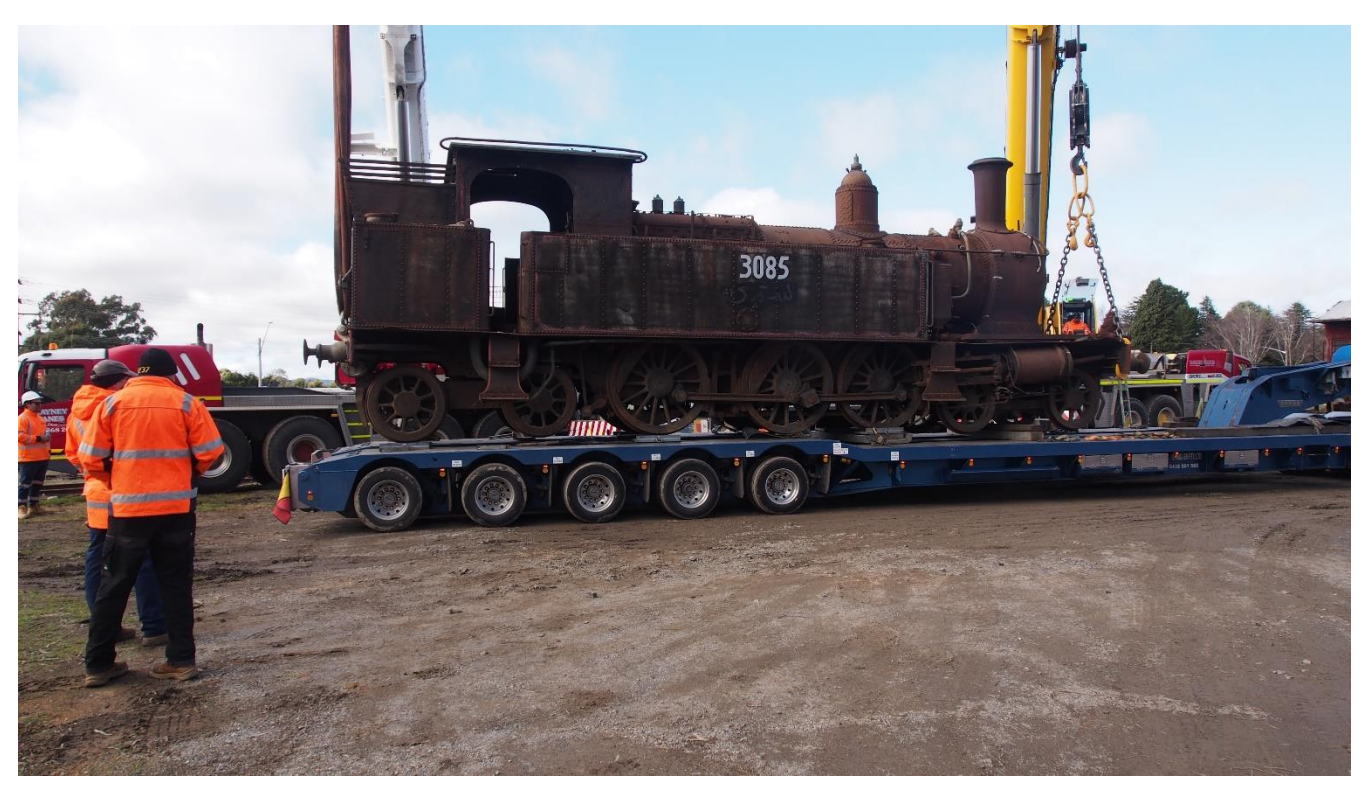
Lifting rig on the front of the locomotive