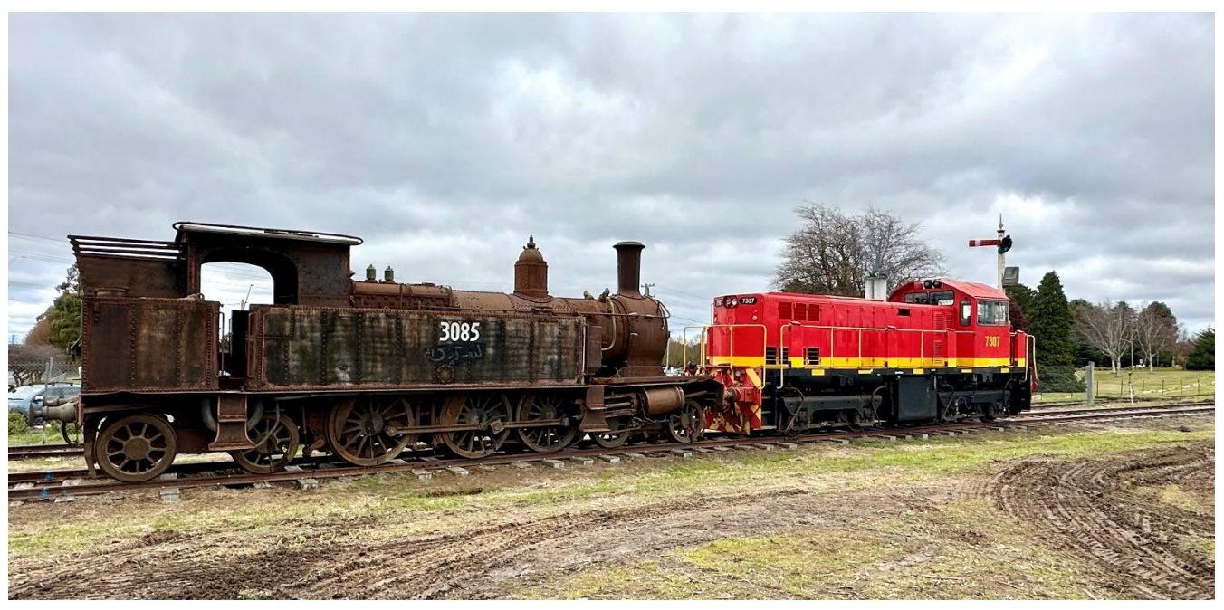
Ready for the shunt to the rolling stock shed