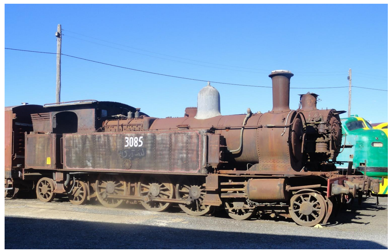
3805 In Goulburn Roundhouse May 2023