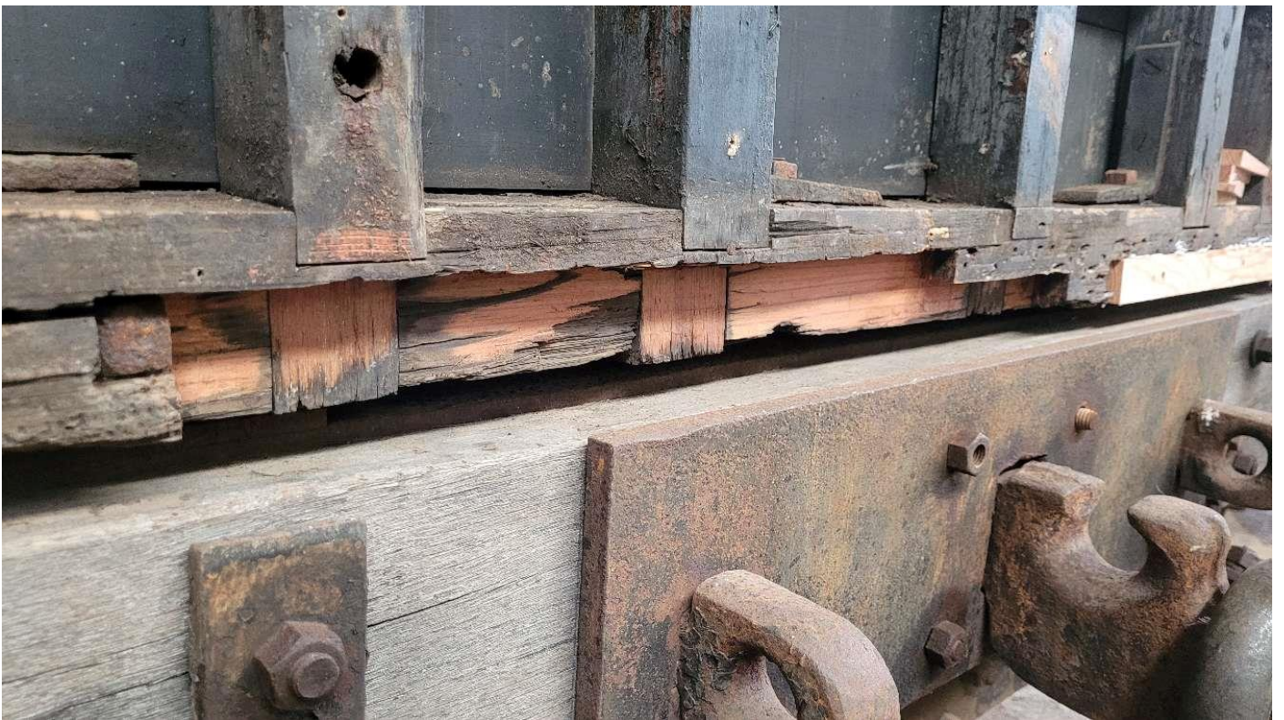
Rot cut out from bottom rail of guard's end wall.

Next General Meeting Annual General Meeting 9 th October 2024 at 7.30 PM