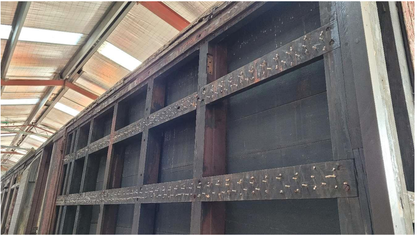
Lots of dowelling on north east guard wall. Since completed ready for matchboard.