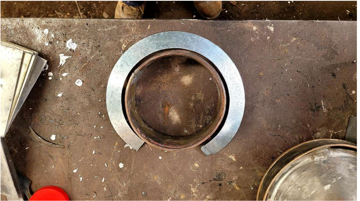
Vent repair works