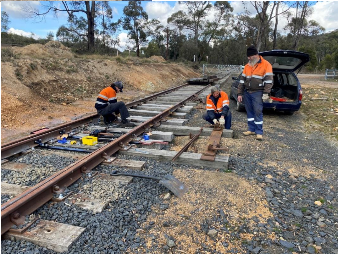
Volunteers temporarily layout rodding and bell cranks.

Facing point lock and rodding being positioned for fitment.