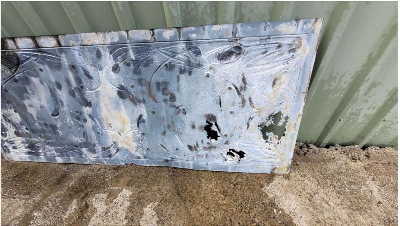
Ceiling panel holes requiring repair.