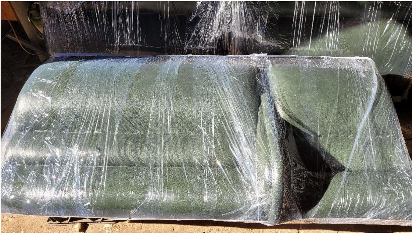
Some of the First-Class seating completed and delivered.