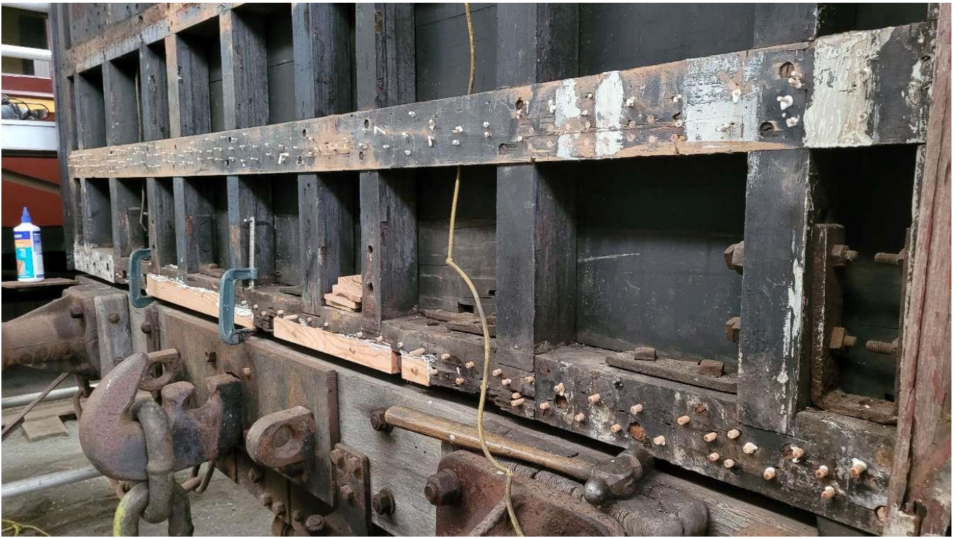
Spliced in timbers and lots more dowelling