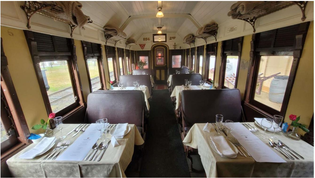
HLF854 dressed and ready.