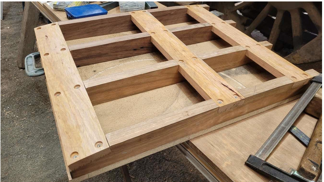
Mock frame built to enable steam bending of matchboards.

Next General Meeting Annual General Meeting 9 th October 2024 at 7.30 PM