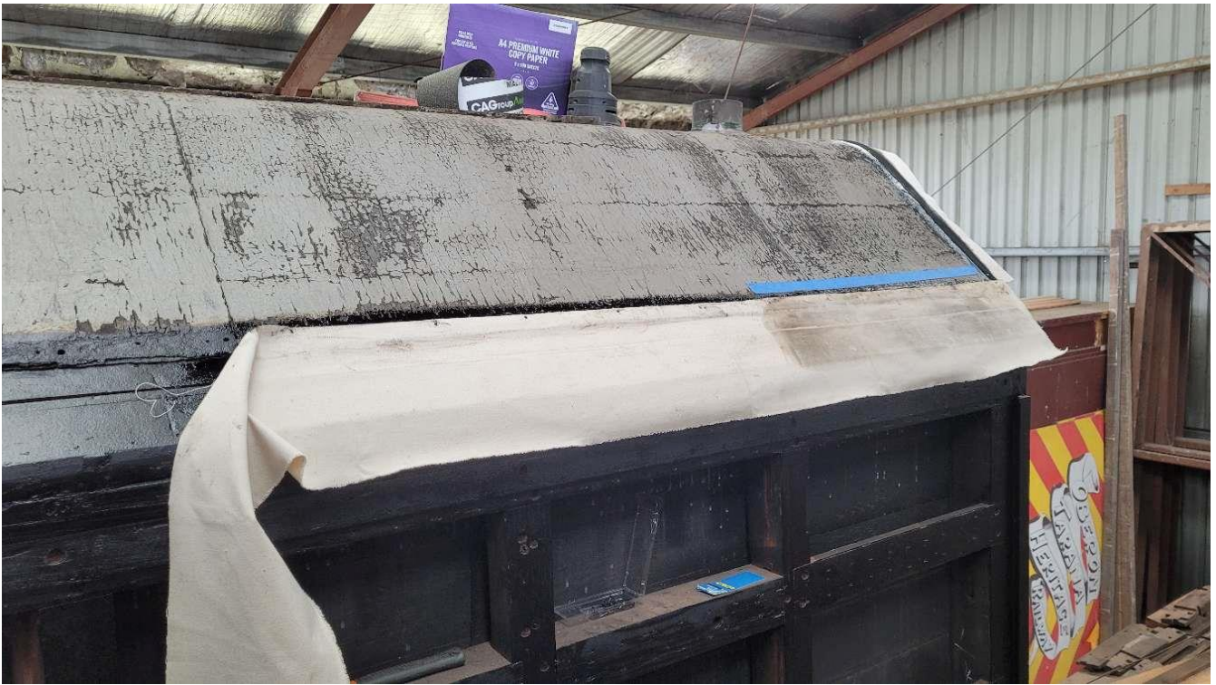
Canvas being added to gutter line.