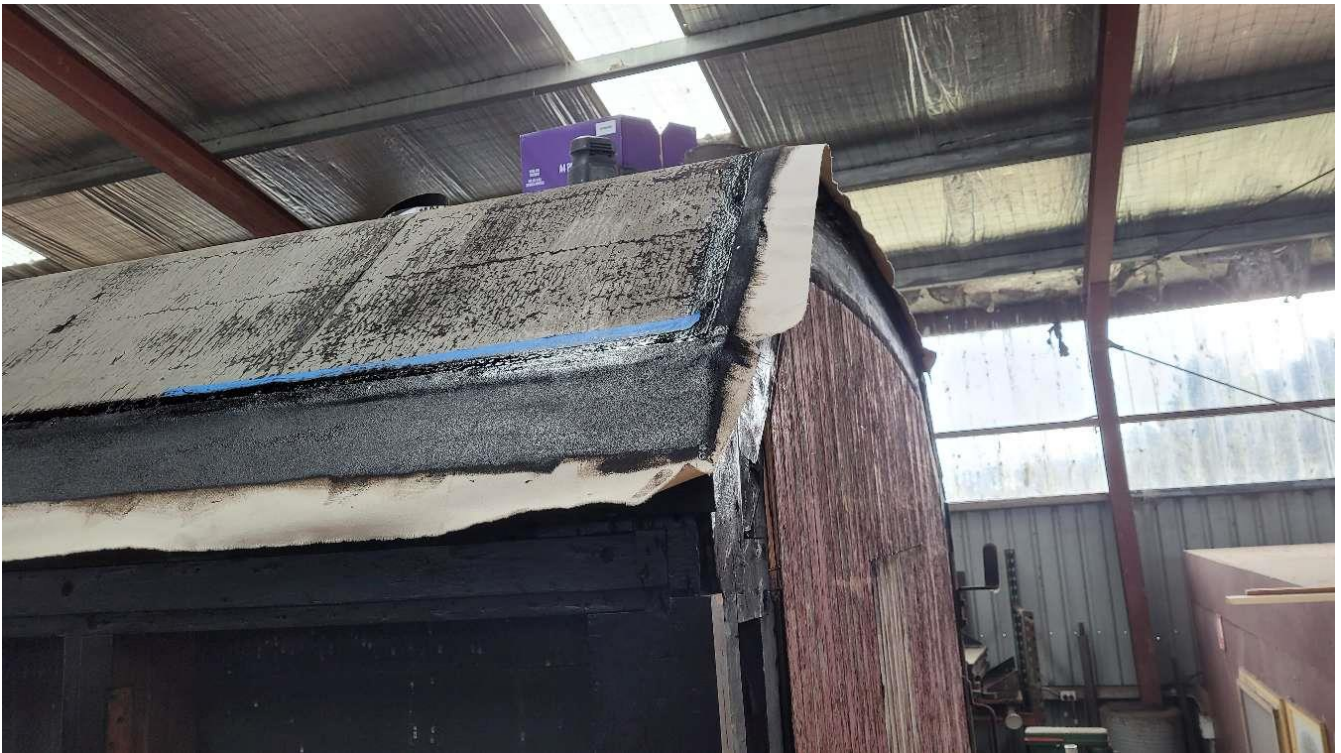
Canvas bitumised and waterproofed

Next General Meeting Annual General Meeting 9 th October 2024 at 7.30 PM