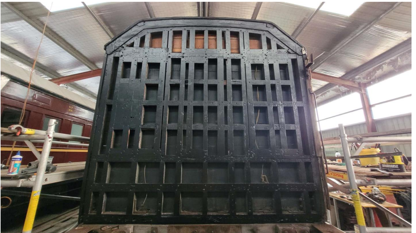
Guard's end repairs completed, bitumen painted and ready for matchboard

Next General Meeting Annual General Meeting 9 th October 2024 at 7.30 PM