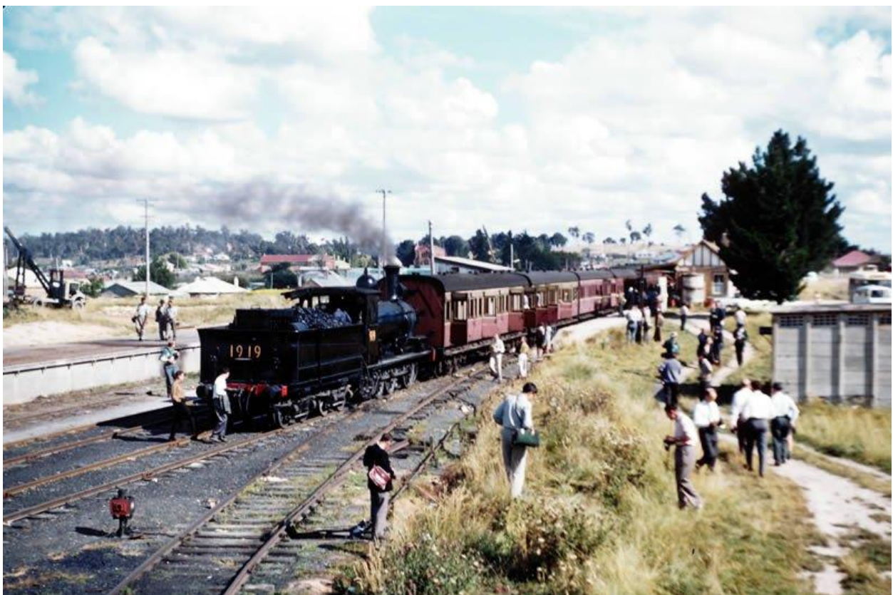
2 nd March 1963 – consist has been reorganised for trip back to Tarana

Membership Renewal now due Volunteer Today. Call Greg Bourne on 0437 389 684 for details