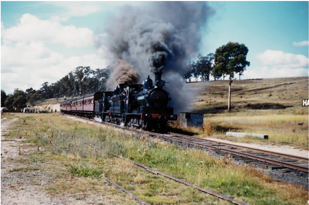
2 nd March 1963 – the run around loop was obviously not in use in 1963