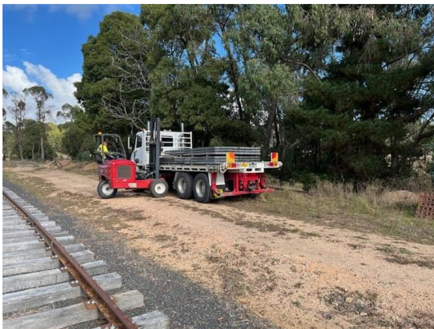
May - a delivery of components for the new platform at Hazelgrove

Check our website for information for all our Track Maintenance Vehicles https://othr.com.au/track-maintenance-vehicles-2/