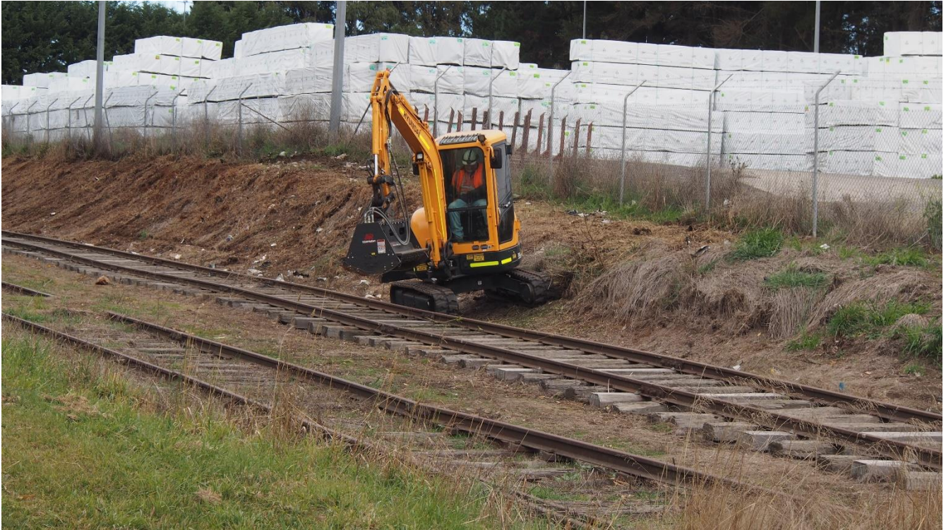
Excavator organised by Highland Pine clearing vegetation in the rail corridor.