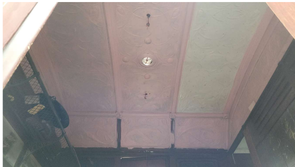
C36 compartment ceiling in primer.