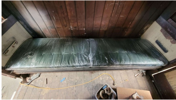
1st Class seat squabs trial fitted

Commenced work on compartment B36 to C36 east frame section. Removed all existing drop light rails and removed all hardened drop light window rubber bumpers.