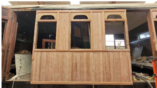
C36/D36 matchboard sealed, trims in place.