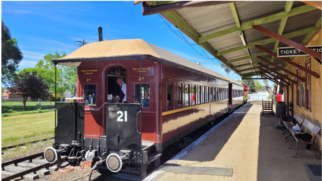
Set 21 ready for Christmas Lunch

All these events provide significant income for OTHR to help us achieve our end goals.