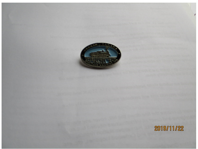
Official OTHR Merchandise Buy Now.