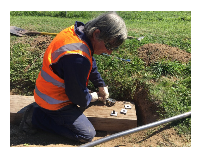
Bolting it in place - March working bee.