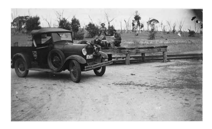
A very rare photo of Carlwood Stop on the Oberon to Tarana branch line from the 1920's.

Still interested in volunteering? Then let's hear from you.