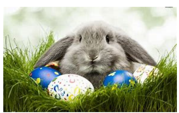
Happy Easter to all OTHR Members, Friends and Readers.

The moral of this Pandemic is to heed all instructions, but operate as much as usual. OTHR will continue to try to make the Oberon Railway Precinct as safe as possible.