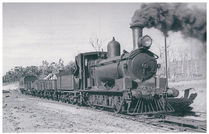
Steamed up and ready to leave the Hazelgrove Stop.