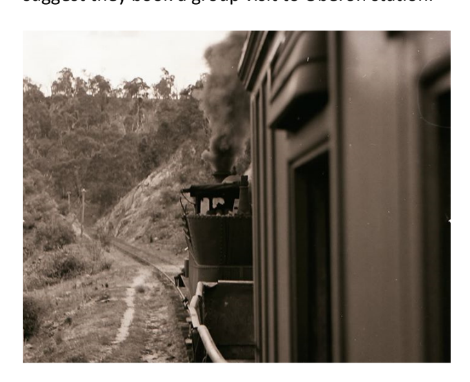
Travelling up the 1 on 25 incline towards Hazelgrove.

If you are a member of another group, say a car club or Rotary or Probus or a gardening club, etc. and that group is looking for an excursion, please suggest they book a group visit to Oberon station.