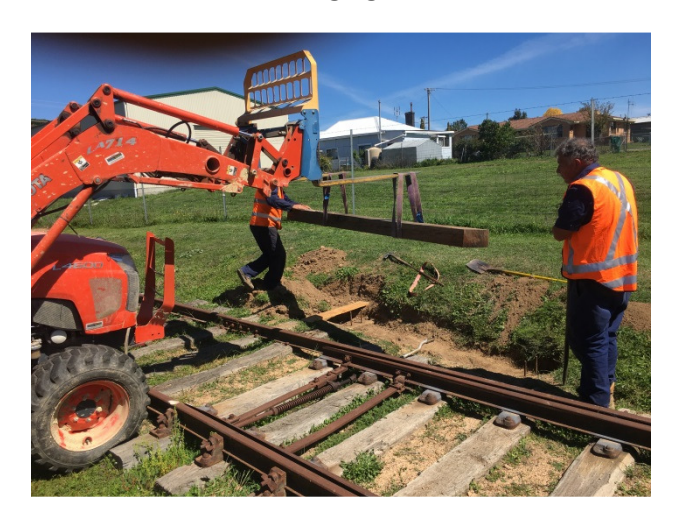
Placing the timber for E-frame - March