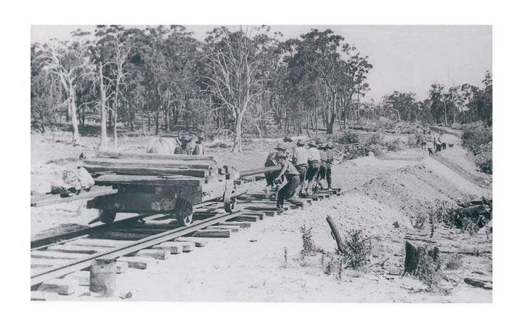
Laying the line between Tarana and Oberon in the early 1920's

Along with the Australian specialist construction brands Orminoid and Lanko, Davco is part of the international ParexGroup. ParexGroup is a truly global company and a leading producer of speciality dry-mix solutions with 3.905 employees. The group has a strong local focus