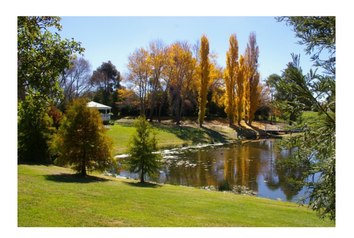
"The Common", Oberon's beautiful park located in the heart of town.

We would appreciate you passing this newsletter to others who might be thinking about a wonderful and vibrant trip to a spectacular part of Australia.