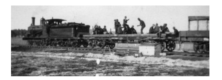
Another rare photo. Building the Oberon Branch Line, early 1920's

These sales are a good source of income for your organisation.