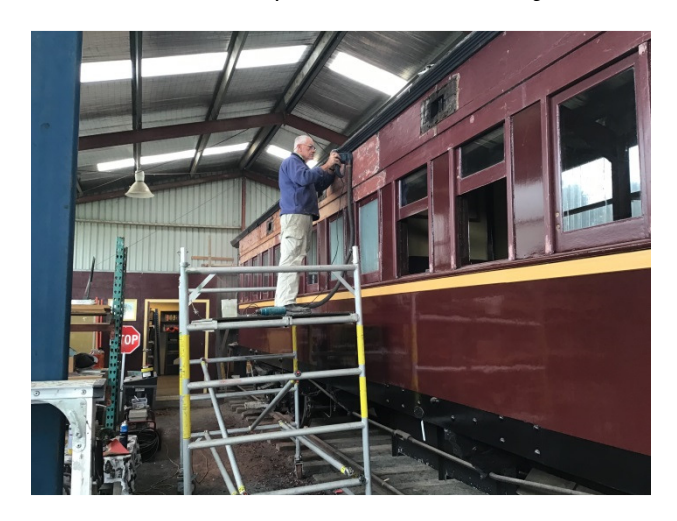
Restoration work in progress on HL854.