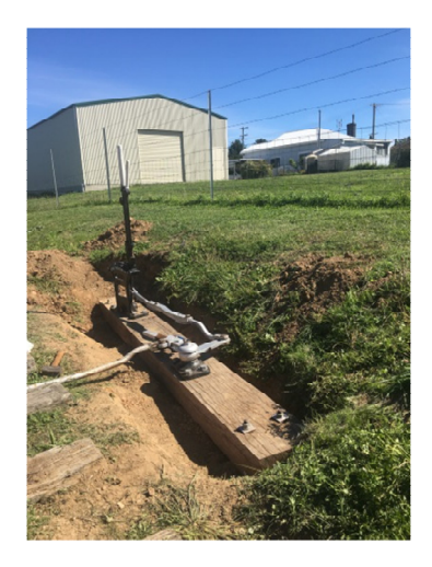
The E-Frame in place - March working bee.