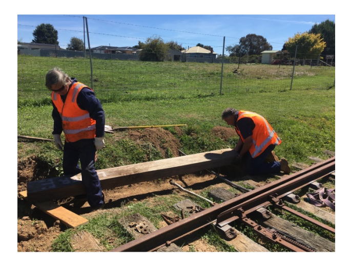
Lining the timber up - March working bee.