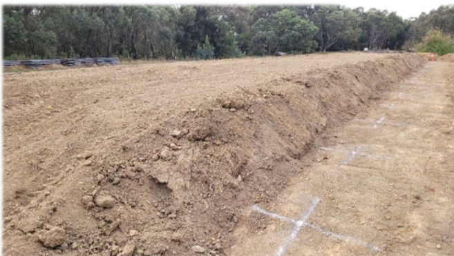
Leveling of earth for Hazelgrove platform