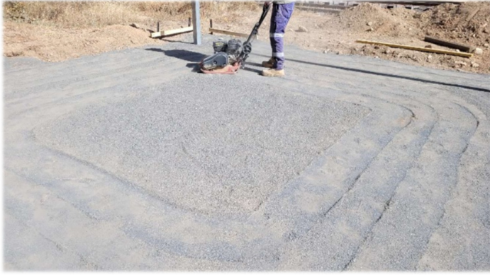
Preparing pad for picnic area