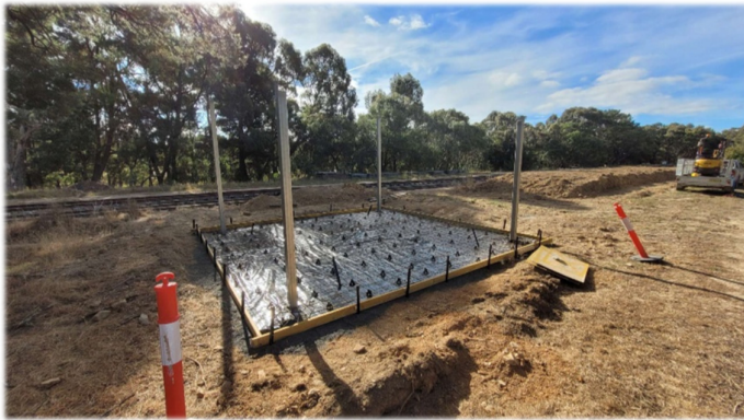
Pad ready for pour