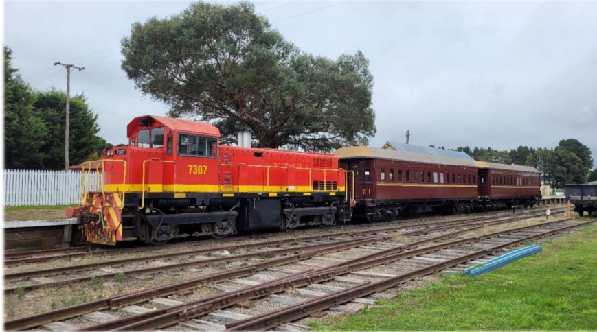
Set 21 at station for Open day

Our next Open Day will be on the June long weekend and we are trialling Sunday as an alternative to Saturday.