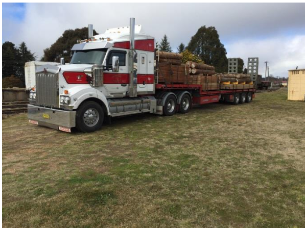
Load of station material has arrives at Oberon.

In the meantime delivery of materials has been completed and tenders prepared.