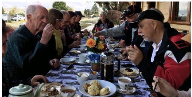
Hosting a recent group tour

If you are a member of another group, say a car club or Rotary or Probus or a gardening club, etc. and that group is looking for an excursion, please suggest they book a group visit to Oberon station.