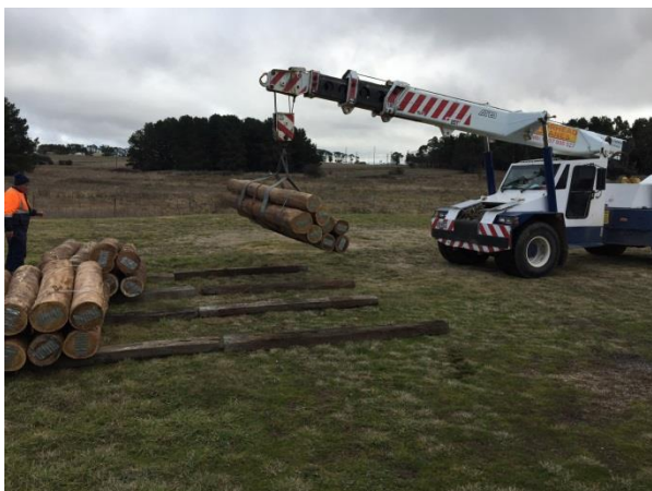
Timber posts unloaded from truck