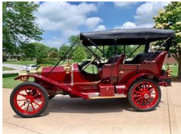
1909 Packard Model 18

If that's not enough to whet an enthusiast's whistle OTHR will also be hosting a visit from the 7th Horseless Carriage Club, International Tour also visiting the Bathurst Region in August/September. Their visit to the Oberon Tarana Heritage Railway Inc. Interpretive Centre will be 2 nd September. There will be a large number of vehicles all manufactured prior to 1920 will be on display for a short time from 11.00AM.