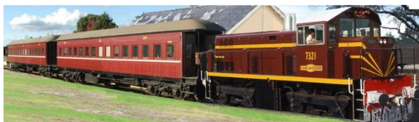
Artist's impression of the tourist train leaving Oberon station for Hazelgrove, NSW