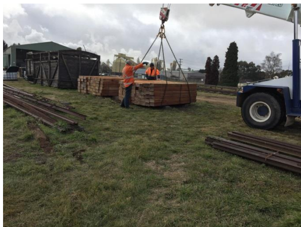
Sleepers unloaded and on the ground