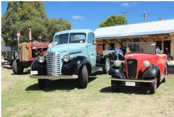
A recent scene at the heritage Oberon Station.

Or phone 0437 389 684 Greg, or 0408 606 889 Dave.