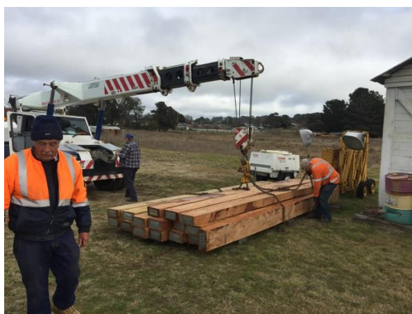
Coping timbers offloaded and on the ground