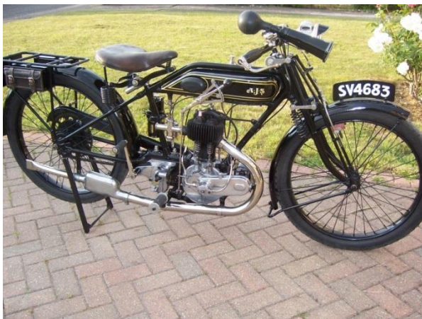
1925 AJS 350 E5 motorcycle

No, this is not a jam making conference!!