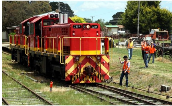
73Cl diesels owned by OTHR being moved to the rolling stock shed in 2017.