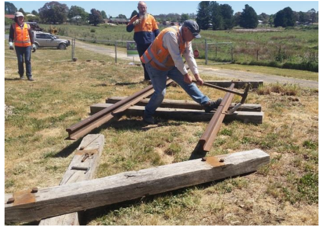
Using the pig's foot on a dog spike. Our volunteers hard at work.

Reserve Saturday 14 th March 2020 to enjoy a day of all things heritage. This event is not to be missed.