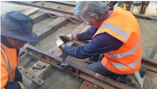
Lengthening the line in the Rolling Stock Shed

Currently we now have five sponsors on board, all sponsors offer in kind support for which we are extremely grateful.