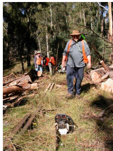
Volunteer activities. Circa 2008

We’ll have a look at some of the other aspects of the Convention during the next few newsletters.