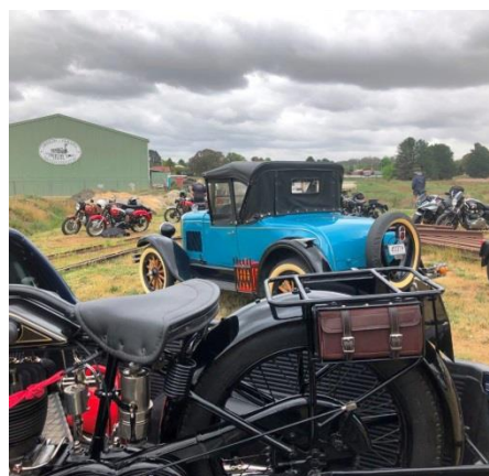
Some of the AJS & Matchless Motorcycles plus a locally owned Chevrolet at the Oberon Station Precinct.

Oberon, the perfect place to base yourself for a week or a few days or even just a day!