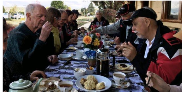
Hosting a recent group tour

If you are a member of another group, say a car club or Rotary or Probus or a gardening club, etc. and that group is looking for an excursion, please suggest they book a group visit to Oberon station.