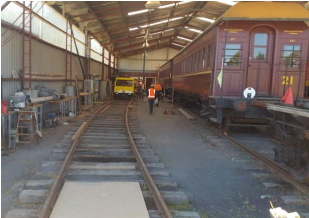
The 40ft track extension in the Rolling Stock Shed completed at the November working bee.