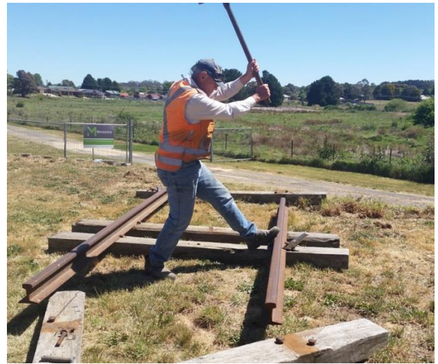
Removing a dog spike. Latest working bee activity