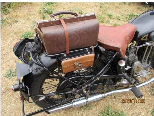
Who remembers a bag like this one?