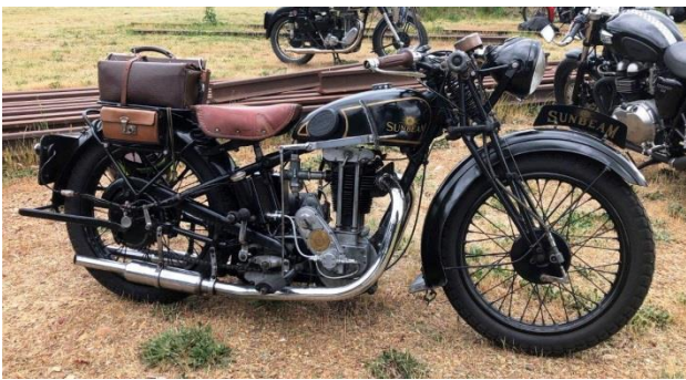
A classic motorcycle at the Oberon Heritage Yard