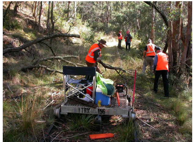
Volunteers clearing the line circa 2008.