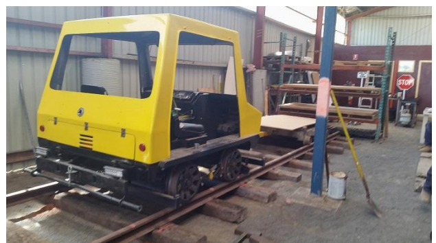
The end of the new line in the Rolling stock Shed.