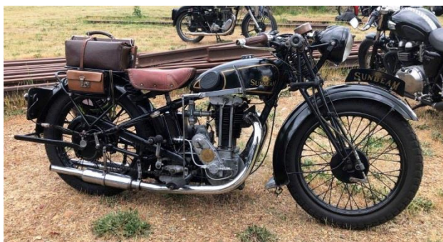
One of the competing bikes, a Sunbeam. What a fabulous bike