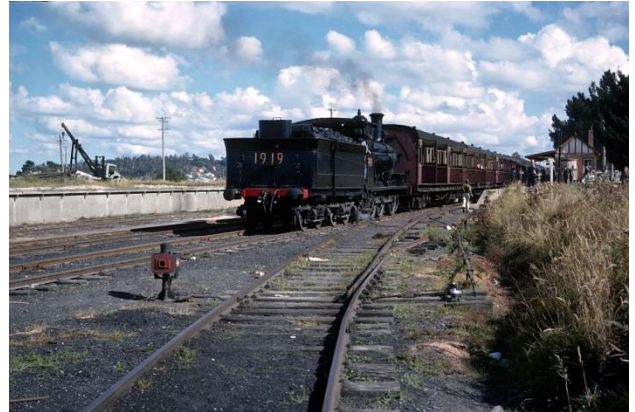
Locomotive 1919 about to depart Oberon Station on the way to Tarana. Photographer and date unknown.