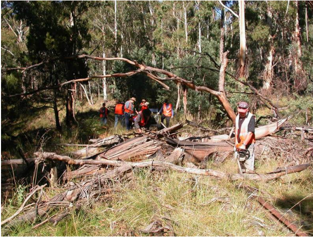
Volunteers clearing the track. Circa 2008