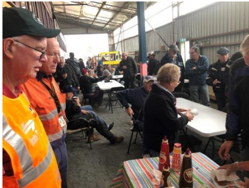
AJS and Matchless entrants enjoying lunch in the Rolling Stock Shed.

We would appreciate you passing this newsletter to others who might be thinking about a wonderful and vibrant trip to a spectacular part of Australia.