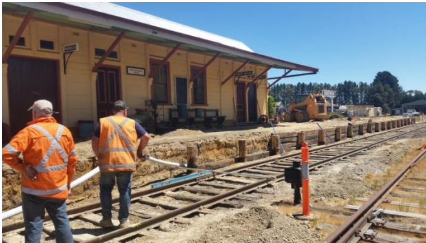
Another view of the Heritage Station Platform project showing installation of the piers and wall.