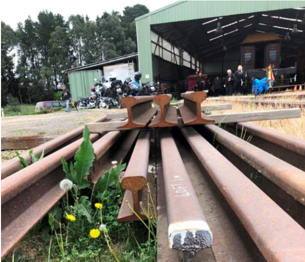
A creative photo of rail lengths in the Oberon Heritage Yard