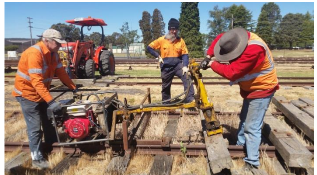
Volunteers using the OTHR Dog Spike Puller and our recent working bee.

Oberon Tarana Heritage Railway welcomed an Insight Railway Tour to the Oberon Heritage Precinct on Tuesday 22 nd October. A group of 15 enjoyed lunch and a tour of the railway precinct. Our volunteers made the group very welcome and were able to answer many interesting questions tossed up by the visitors.