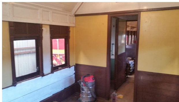
Start of the fitout of one end of one of the 1897 End Platform Carriages as a café.