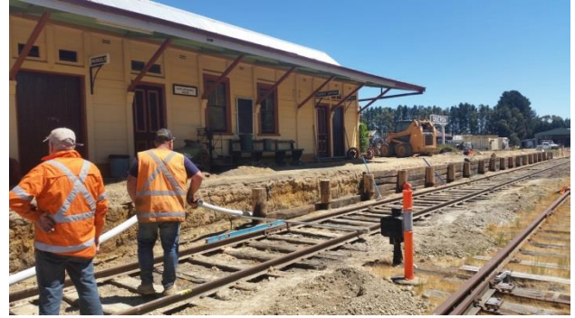
Oberon Station Platform refurbishment well underway

Interested in railways or the Oberon to Tarana line in particular, why not give your support by becoming a member?