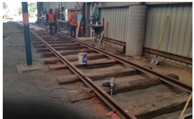
Line construction progresses in the Rolling Stock Shed

Still interested in volunteering? Then let's hear from you.