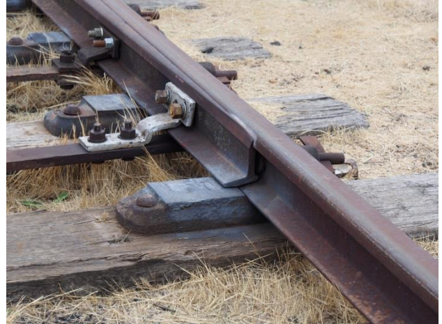
Replaced defective RH switch January working bee.