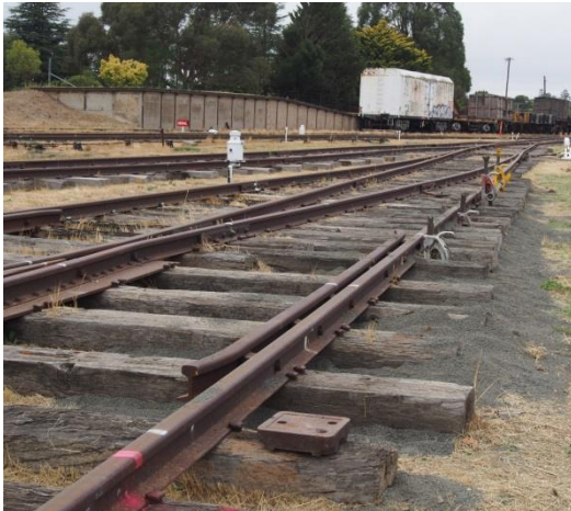
Road 6 jacked up reading for repacking.