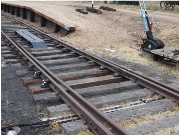
Replaced 2 sleepers near frame. Restored station platform in the background.