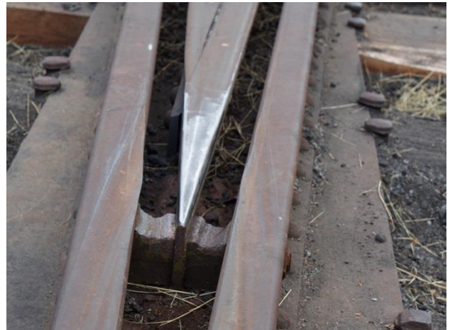
Repaired V nose overflow January working bee

OTHR also needs skilled tradespersons of all types. For example, Carpenters, Plumbers, Electricians, Boilermakers, Painters plus more. Please also contact Greg Bourne as above with your experience.