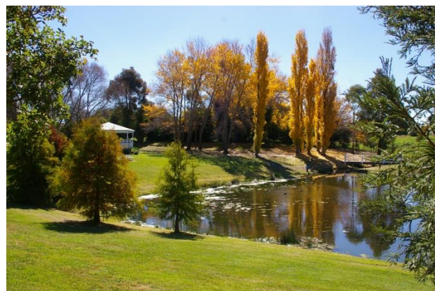
"The Common", Oberon's beautiful park located in the heart of town.

We would appreciate you passing this newsletter to others who might be thinking about a wonderful and vibrant trip to a spectacular part of Australia.