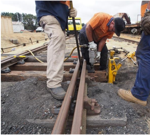
Volunteers at the January working bee replacing sleepers and pinning chairs.