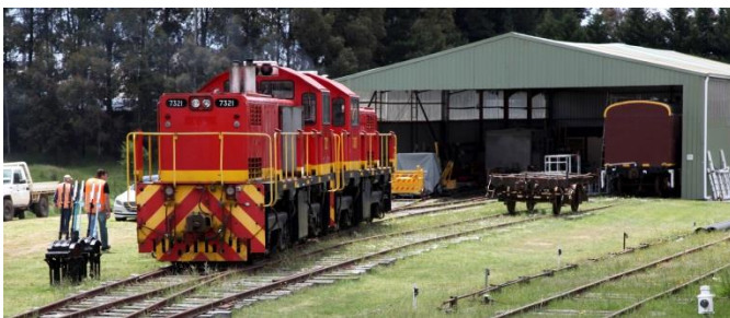
Locomotive movement soon to be a reality.

Look out for movement at the station and get the word out!!