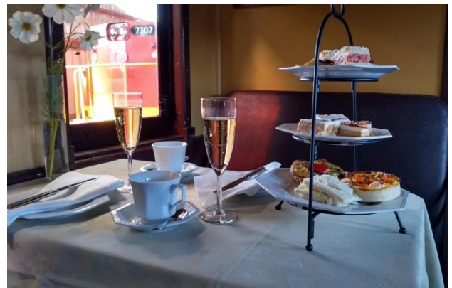
We can't wait to host you at High Tea in our new café!

The café is yet another innovative way guests and visitors can enjoy our railway journey.