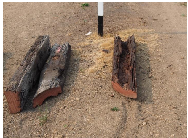
Yes, those sleepers really needed replacing! January working bee.