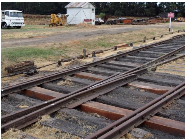
Replaced 4.1m timbers in runout. January working bee. Original Oberon lockup in the background.

Currently we now have five sponsors on board, all sponsors offer in kind support for which we are extremely grateful.