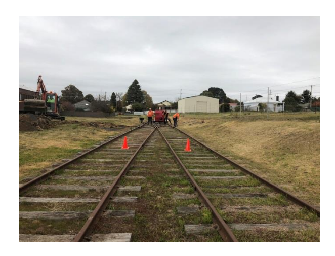
Volunteers work on roads near Scotia Street 2<sup>nd</sup> May working bee

"There are no negatives in life, only challenges to overcome that will make you stronger. Eric Bate"