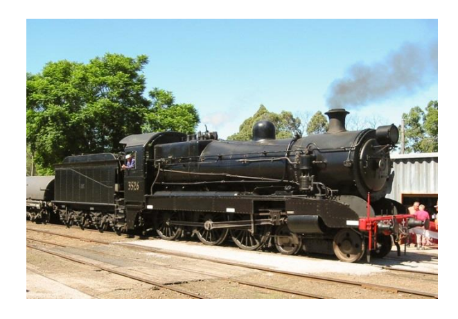
Steam locomotive 3526