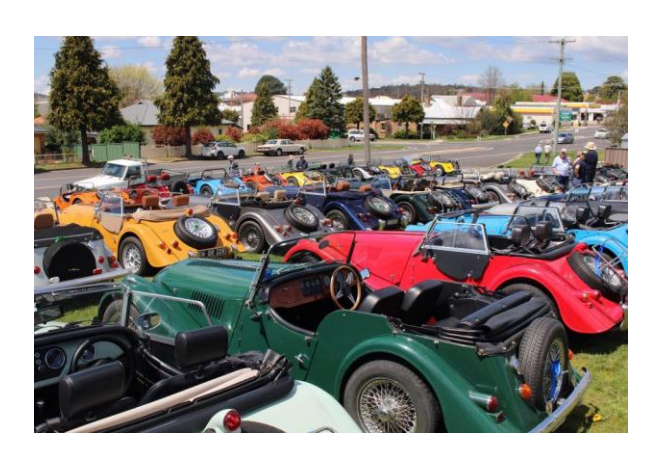
Part of the Morgan Muster display at the Heritage Station late in 2018.