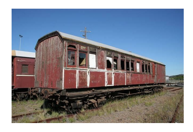
HS36 as it was some time ago. Currently it is housed under cover at Broadmeadows holding facility.

Composite branch line sitting carriage with guard's accommodation.