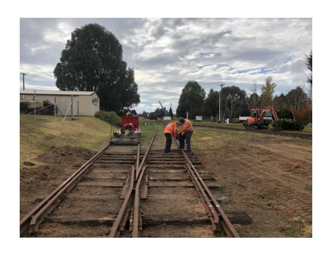
Last dog spike driven in on that part of the job. Volunteers working bee 2<sup>nd</sup> May

Refer to OTHR website to download an application.