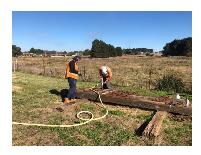
Deplating timbers Volunteers working bee 2<sup>nd</sup> May