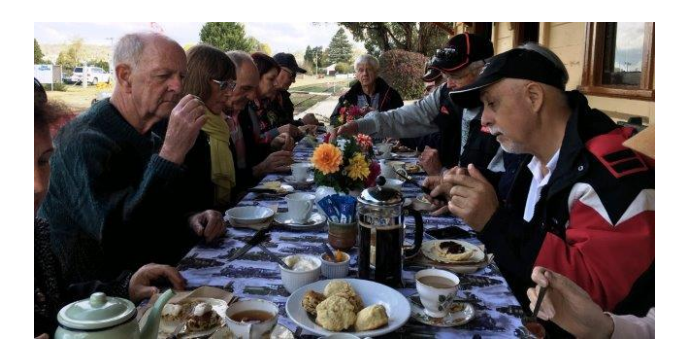
Hosting a recent group tour

If you are a member of another group, say a car club or Rotary or Probus or a gardening club, etc. and that group is looking for an excursion, please suggest they book a group visit to Oberon station.