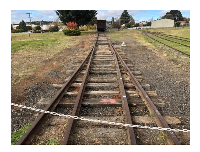
PWD's siding showing new timbers working bee 2<sup>nd</sup> May