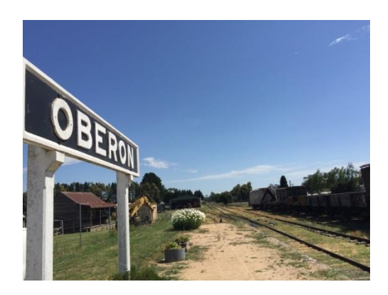
Summer days Oberon Station

In the meantime purchase of materials is taking place.