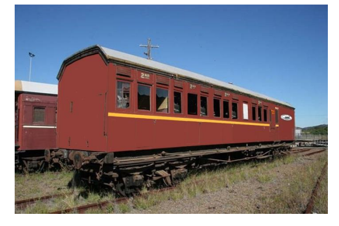
The fabled HS36 about to be returned to Oberon shortly

Along with the Australian specialist construction brands Orminoid and Lanko, Davco is part of the international ParexGroup. ParexGroup is a truly global company and a leading producer of speciality dry-mix solutions with 3.905 employees. The group has a strong local focus.