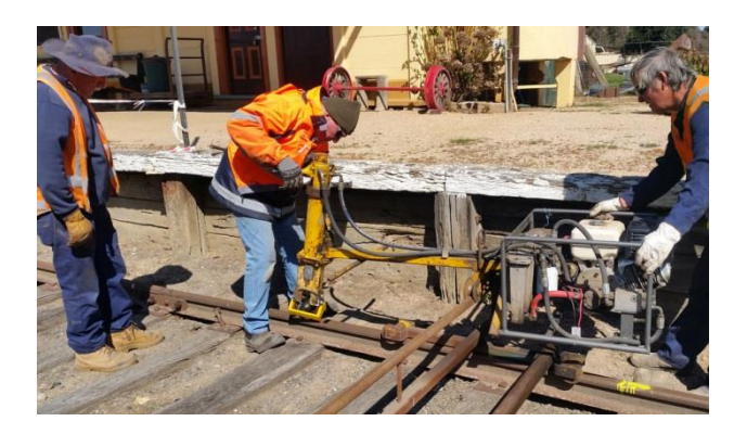
Not quite pulling teeth! Our volunteers using the dog spike puller. Working Bee September/October.

The Oberon Tarana Heritage Railway Inc. Annual General Meeting is being held at the Oberon RSL on October 2<sup>nd</sup> 2019 from 7.30pm. I would encourage all interested OTHR members and general community to attend."