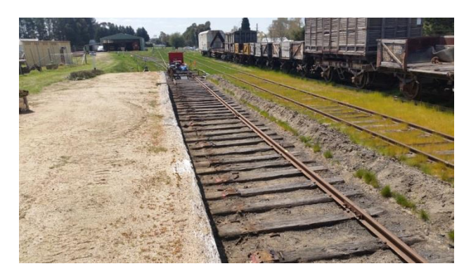
Ready for replacement. Working Bee September/October

These sales are a good source of income for your organisation.