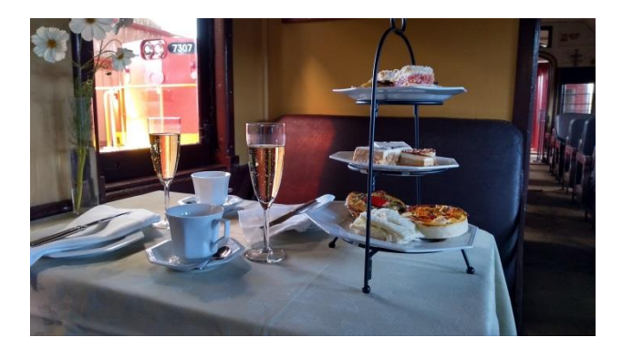
High Tea anyone? A view of meals on a carriage.