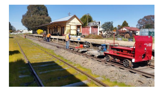
Work starts on replacing worn line at the Oberon Heritage Station Working Bee September/October 2019