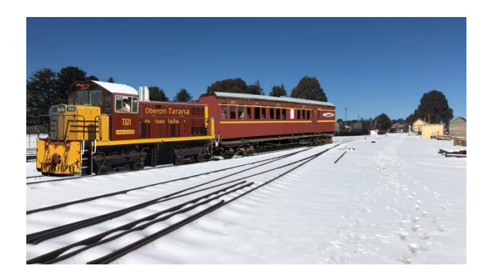
The snow train, Carlwood hauling an 1897 American style End Platform Carriage