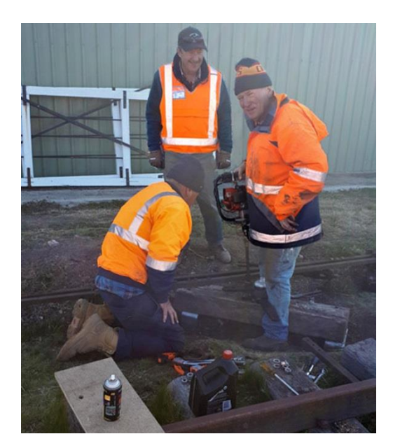
Why not be a part of our happy band of volunteers?