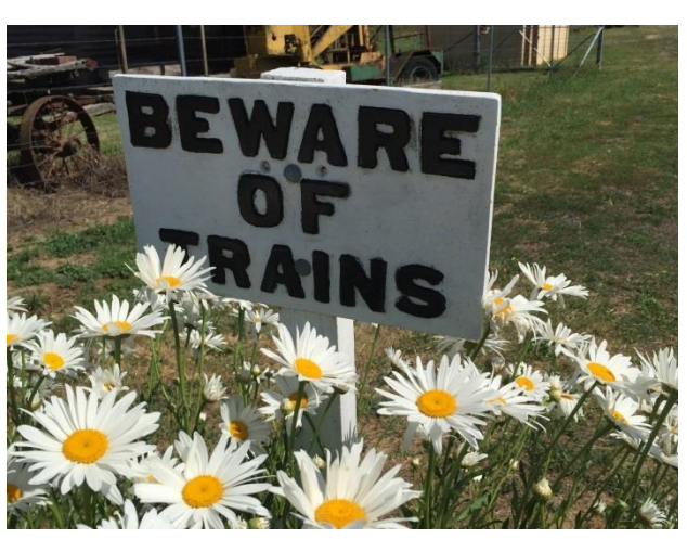
Beware of fake news. All these impressions are from the imagination of our clever artist in residence. They are of OTHR's Vision, soon to be reality.