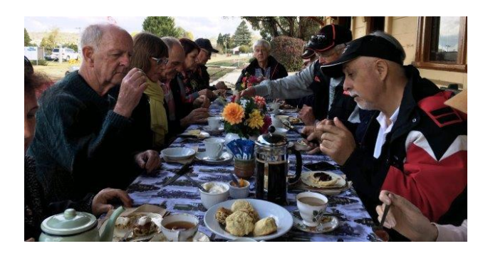
Hosting a recent group tour

If you are a member of another group, say a car club or Rotary or Probus or a gardening club, etc. and that group is looking for an excursion, please suggest they book a group visit to Oberon station.