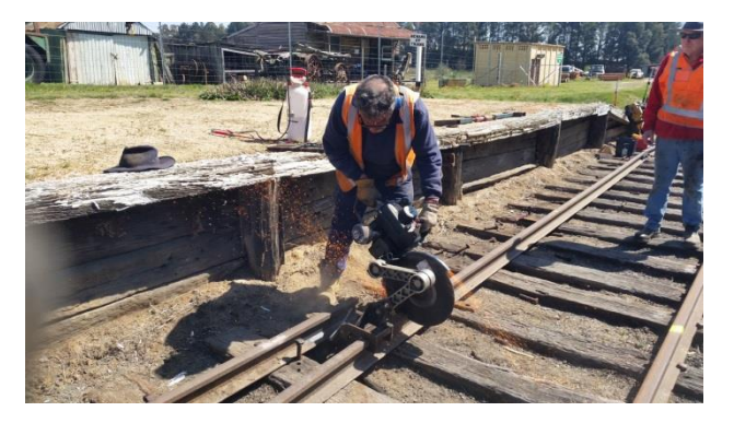
The sparks fly. Working Bee September/October