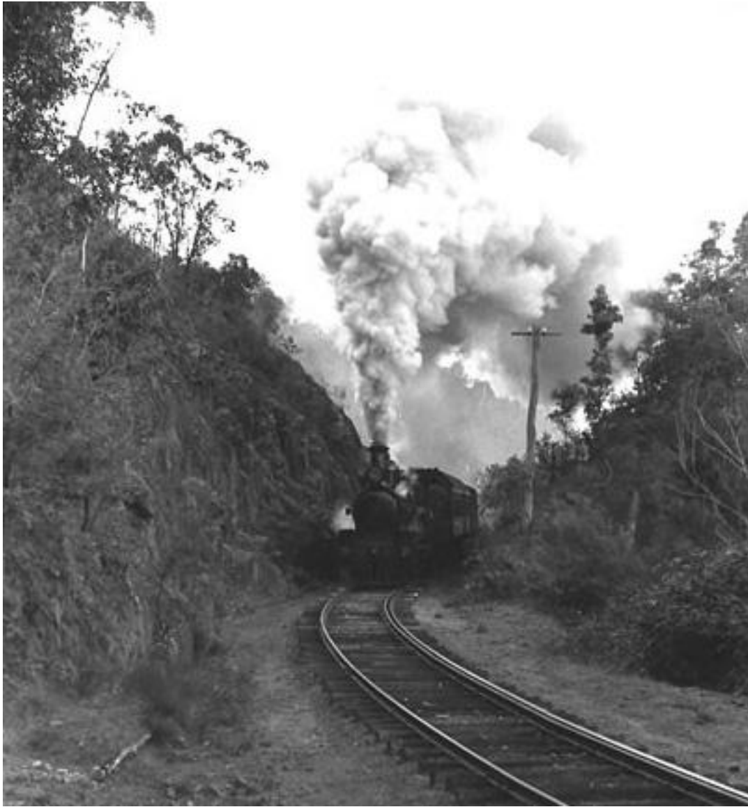
Figure 3: A hard-working 19 class loco climbs the 1:25 grade towards the summit with the Oberon mixed on its way from Tarana to Oberon – note the sharp curves with checkrails and essentially unballasted sleepers. (© Dennis O’Brien collection).