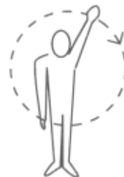
Release Automatic Air Brakes