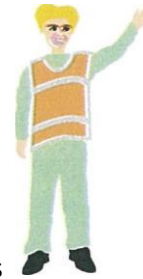
Acknowledgement - I see you and it's all clear to pass