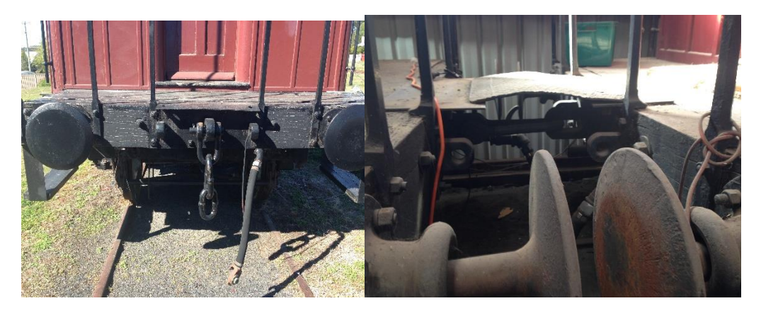
Examples of 'Intermediate' links

Operational Requirements: When a vehicle fitted with buffers, vestibules or diaphragm buffer plates and drawhooks is required to be coupled to another vehicle similarly equipped using an intermediate type link connection, the operation must not be performed unless;