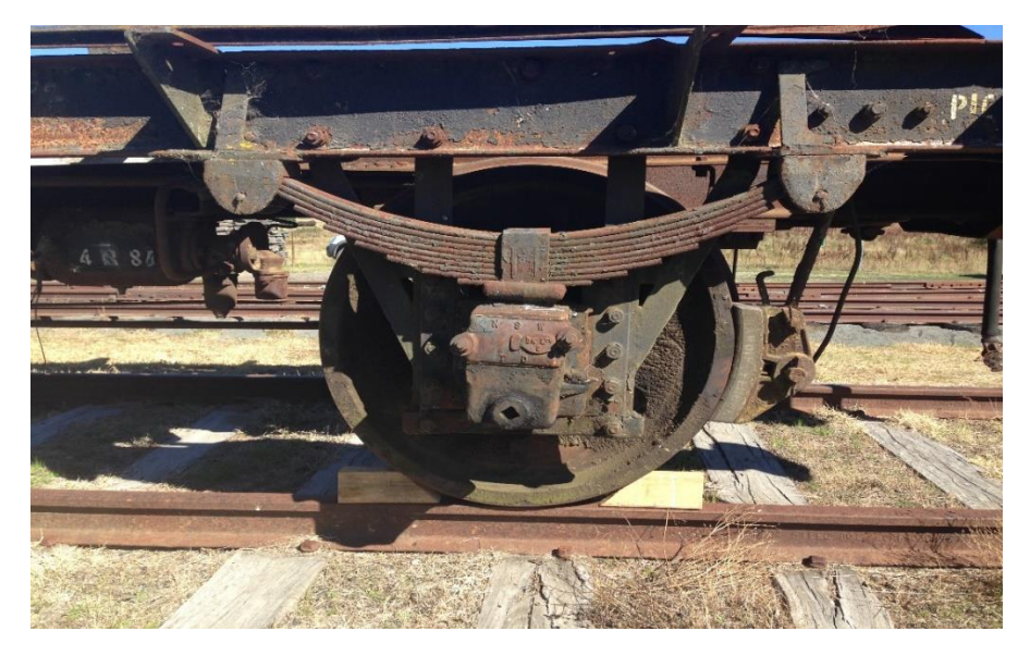
Place chocks either side of one wheel

• 7.7: How to couple and uncouple rollingstock and the different type of couplings