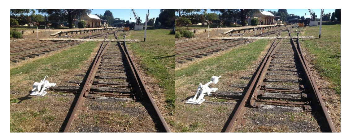
Points changed by a 'Throw over' lever