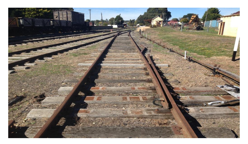
Catchpoints controlled by Lever 2 at the "B" frame

Issue Date: 12/12/2018 Review Date: 12/12/2021