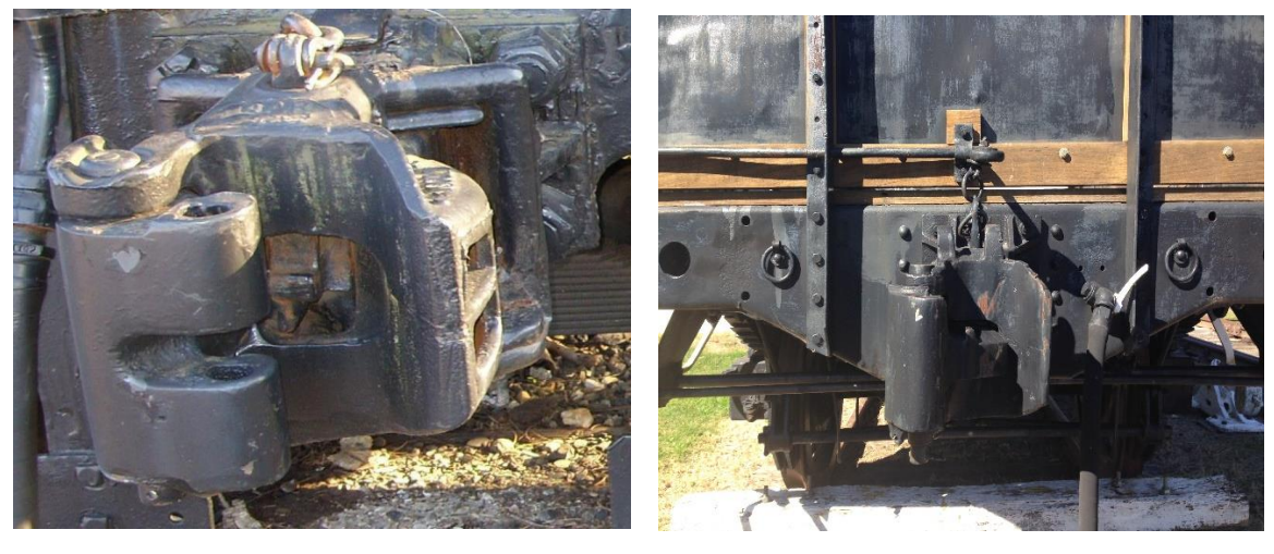
Auto coupler (closed)