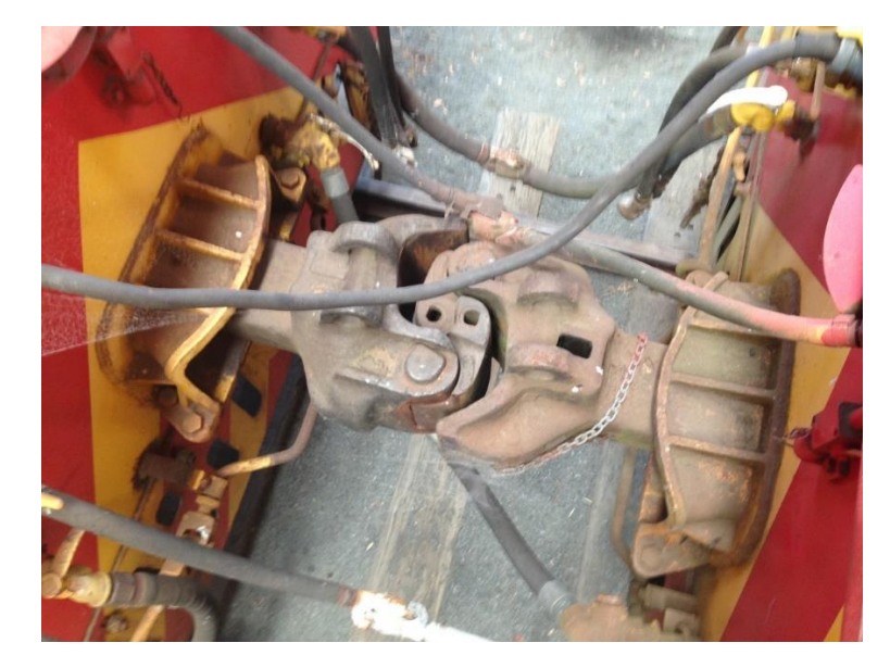
An example of two vehicles connected to with auto couplers

• 7.7.1: Auto couplers are used on all rollingstock now days