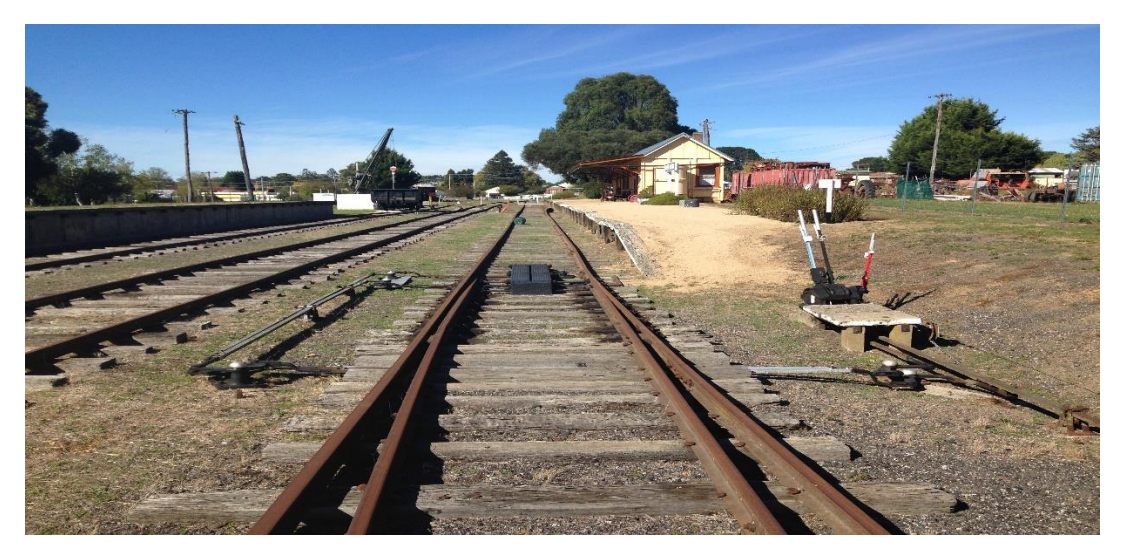
Frame points controlled by the lever 1 frame 'B' on the right

Issue Date: 12/12/2018 Review Date: 12/12/2021