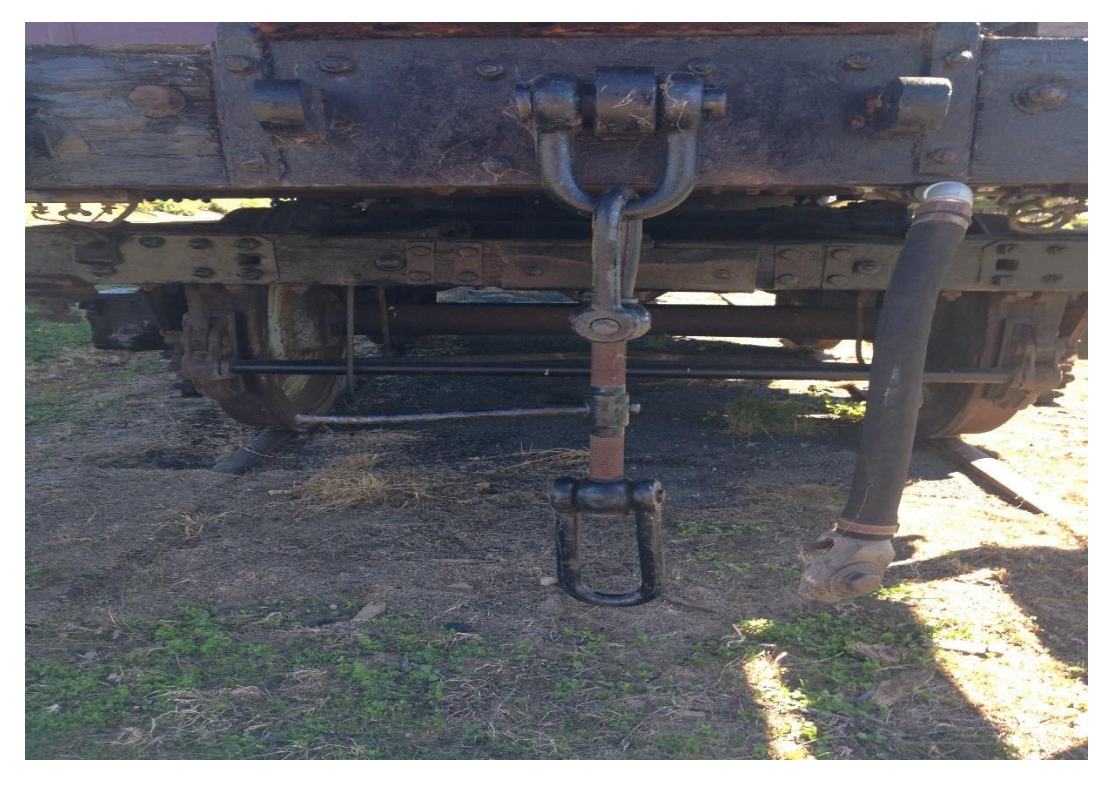
The link is connected to the hook on the other vehicle